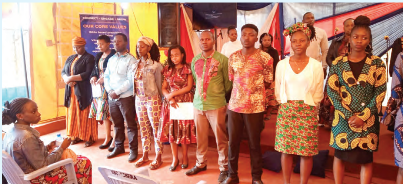
Receiving new members

There are seven (7) Home Group Fellowships that meet weekly, after the slow down caused by Covid-19. There have been trainings held for small group leaders, for the ushers and hospitality, Youth, men and women's ministry meet together for fellowship and to pray over different matters. The Daughters of Ruth (Single ladies) ministry has also picked up well. All these ministries were mobilized during mission month in September 2022, and were involved in door-to-door evangelism and an evangelistic drama production. We appreciate the support of the 3i8 training participants who came alongside NBC Kibera and the Clinic for these activities during mission month. Eighteen (18) of our leaders underwent the 3i8 leadership development program. We thank God for the twenty two (22) new members on 11th September 2022.