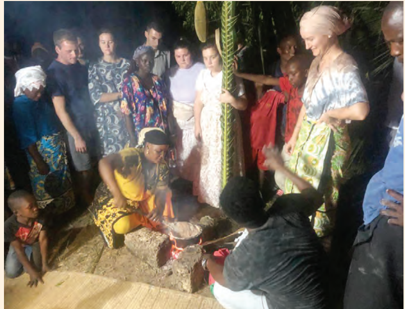
Digo night in Kwale

Greatly blessed.. My testimony.. I was feeling a little unwell today, had gone to the doctor this afternoon in Kilimani and figured, I’d come to