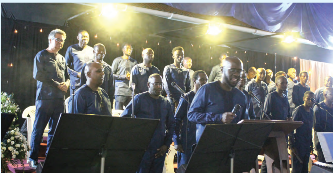
CD launch Princes (men's) fellowship

Young adults are a key part of our congregation. Their enthusiastic involvement has added so much life in the services and life of the church. A new cohort of KUPAA (post university) program was launched in February in which faith is emphasized and made relevant and applicable to the workplace. We had planned for thirty (30), more than double attended the launch to set off the program and about fifty five (55) have been attending on a regular basis. They are set to complete the program in October 2022. This has also been a great opportunity for the older to train the younger according to Titus2:4-8. The four intending couples in the dating and waiting club got married and transitioned into Ndoa Poa couple groups that meet monthly.