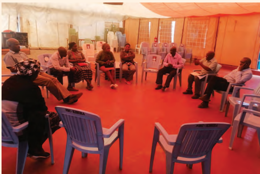
Entrepreneurship ministry at NBC Kibera

In addition to the communities in Kwale, the church continues to reach out through friendship evangelism, prayer walks and teaching language; five (5) English and two (2) Kiswahili students. During mission month, a medical camp took place in Eastleigh, that included one-on-one evangelism, as well as a public debate/discussion on faith matters. We appreciate all the medical personnel and volunteers who turned up to not only treat, but pray for those who came for treatment. The ministry also involves PPI in three primary schools. In May 2022 a class for special needs students was began, in which about fifty (50) children with impaired hearing attend the weekly sessions.