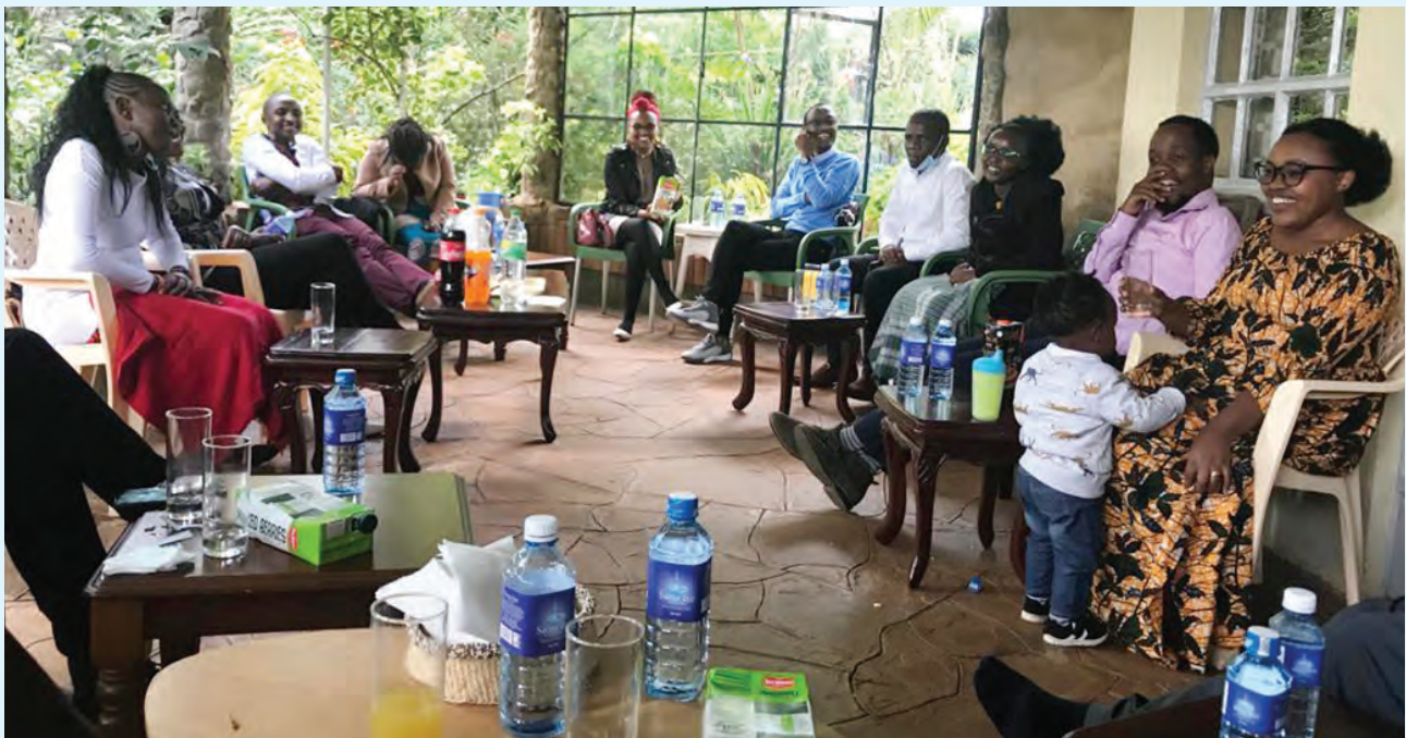
Ndoa Poa lunch

Young adults are a key part of our congregation. Their enthusiastic involvement has added so much life in the services and life of the church. A new cohort of KUPAA (post university) program was launched in February in which faith is emphasized and made relevant and applicable to the workplace. We had planned for thirty (30), more than double attended the launch to set off the program and about fifty five (55) have been attending on a regular basis. They are set to complete the program in October 2022. This has also been a great opportunity for the older to train the younger according to Titus2:4-8. The four intending couples in the dating and waiting club got married and transitioned into Ndoa Poa couple groups that meet monthly.