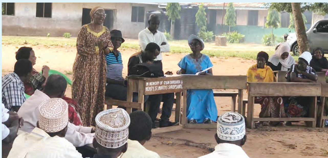
Assembly Leadership in Kwale

The Assembly Leadership Team made a bold move to go for a mission to our mission Station in Kwale; what a blessing it was not only for the community, but also for the leaders themselves. It was humbling to do home visits and share the gospel. They took time to visit the staff members, true to the Assembly's motto of 'Love Out Loud', it was very encouraging for the staff members.