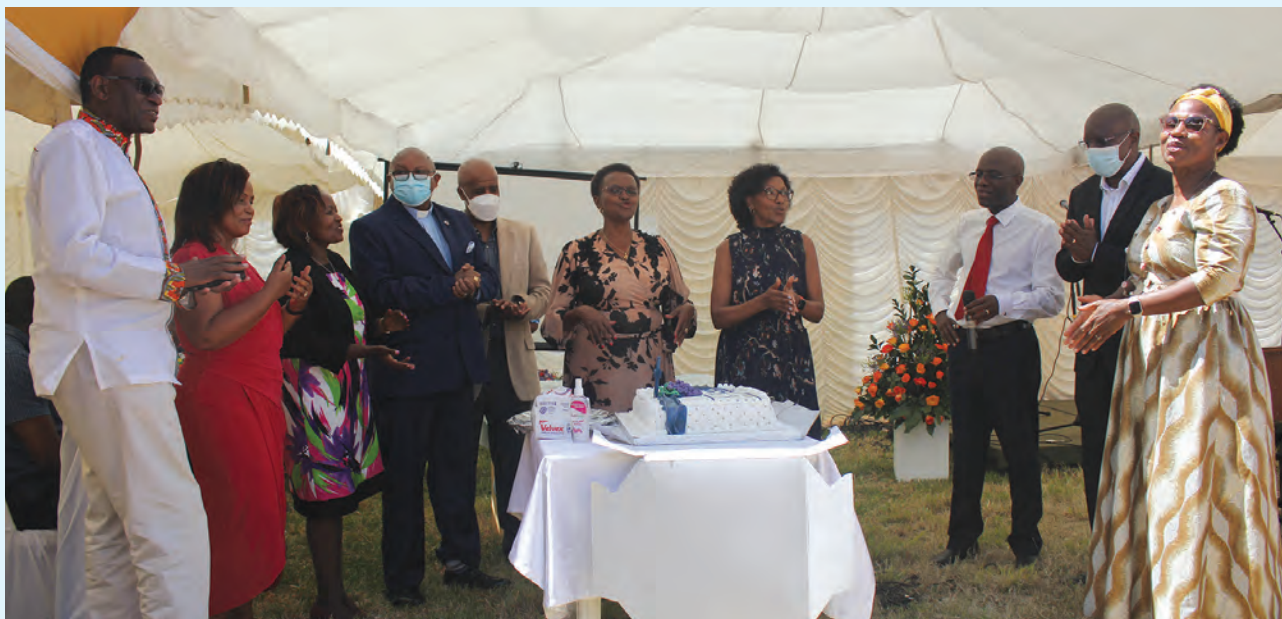
5th anniversary celebration

It has been five years since NBC Westlands was launched; and in this year of Grow and Go, we celebrated in a big way, with a service at the Ngecha Road property for the first time ever. We have used the property for ministry activities, but not a service due to change of use challenges. It was a beautiful day of thanksgiving, testimonies and ended with lunch for the congregation and invited visitors. The luncheon also raised over Kenya shillings three hundred thousand towards the Go and Grow resource mobilization initiative.