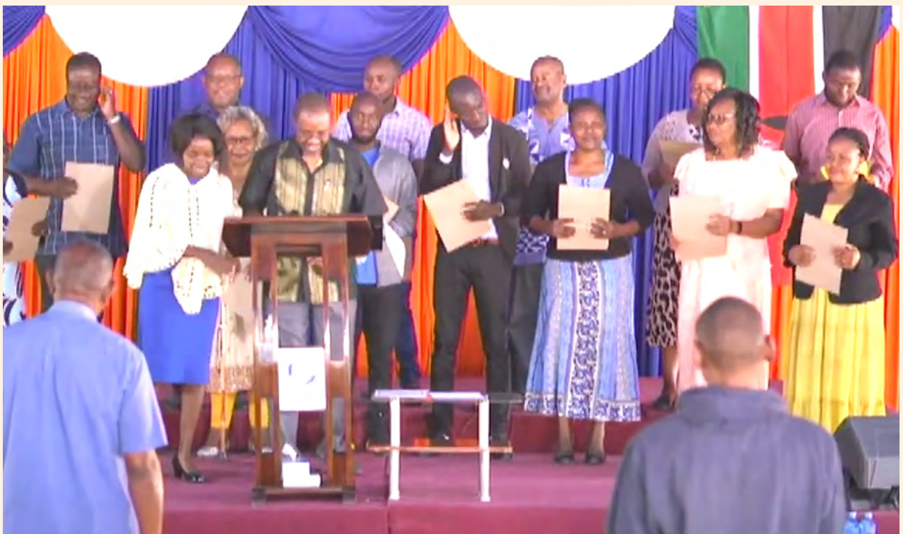
NBC Kitengela 3i8 Class of 2022

We have indeed seen the NBC Kitengela ministries, congregation and facilities Grow in different ways and we had the opportunity to also Go. All glory, honour and thanks be to our Lord Jesus Christ!