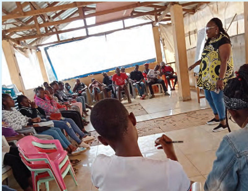
Session during teens week

We pray for God's guidance and His provision. Once a month, the children hold a prayer service, it is a blessing to see children engaged in prayer. During the April holidays, a teens week was held for Bible study and fun activities. Forty-two (42) graduated from 2021/2022 ROPES class, and another class began with thirty one (31) candidates. Badili (Ex-candidates' program) registered 11 candidates of those who had completed high school awaiting to join University and colleges. They completed the program and graduated on 11th September 2022.