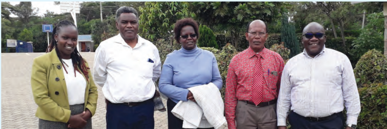
Church Trustees visiting NBC Ongata Rongai

Following approval by members to dispose of a portion of the Ngecha Road property, a task force was put together that has continued to follow up the matter. The process of change of use being endorsed on the title and subsequent sub-division has slowed down due to the ongoing digitization. The task force and leadership are considering all options of generating cashflows including a proposal from a neighboring organization to lease a portion of the property for parking space; the discussion is ongoing. Our primary focus remains settling NBC Westlands on this property.