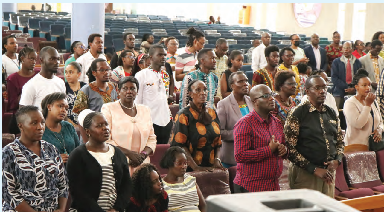
3i8 Graduation ceremony