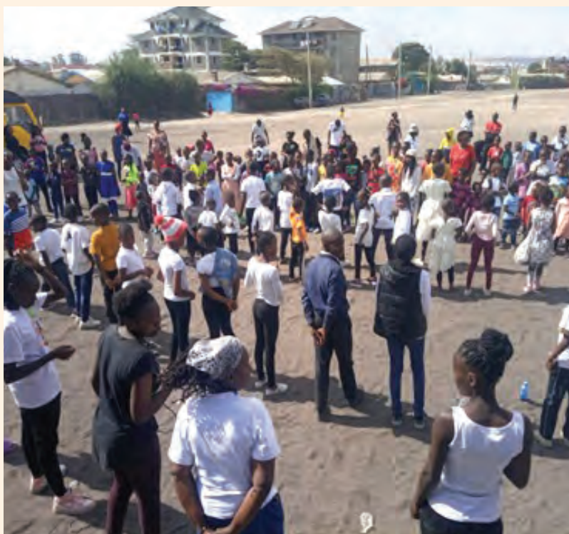
Children's Crusade in Athi River

During the September mission month, we held our first Children's Crusade in Athi River. In preparation, about forty (40) children were trained in evangelism and had an opportunity to watch Jesus Film, and fourteen (14) of them gave their lives to Christ. An estimated two hundred (200) children attended the Crusade, out of whom sixteen (16) gave their lives to Christ and two (2) were healed from sickness.