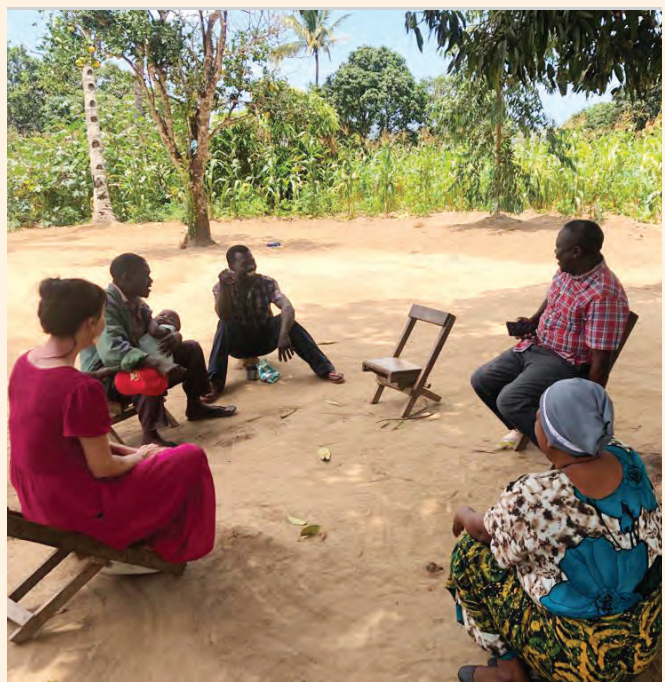
Outreach in Kwale

The clinic attended close to 100 patients and another close to 1000 infants who are attended to on Wednesdays by half way through the year. One of the Bapo Scholars who completed studies in nursing has provided valuable support to the Nurse in-Charge. During mission month, the clinic attended to about 500 people from the neighboring communities in three days, in addition to home visits; we praise God for about 30 who gave their lives to the Lord during the mission month, and the miracles experienced both by missionaries and the locals. The clinic benefited from various groups who visited and engaged with the community. NBC continues to support training of pastors from the local churches, which happens once a month. During mission month, NBC held a marriage