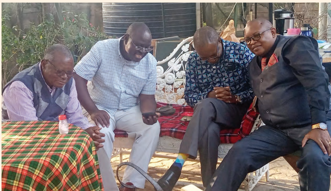
Fellowship of leadership team with Senior Pastor

Due to the nature of the church plant, the assembly did not have a leadership team since inception. In 2022, we were able to fully constitute an Assembly Leadership Team (ALT) and are working towards an Assembly Elders' Court as guided by the new governance structure. The ALT was introduced to the congregation on Sunday July 31st, and have been a great support to the pastorate, and to the leaders of all the ministries. The Senior Pastor's Office, the Senior Management Team and the Elders' Court have also been of great support to the ministry of NBC Kitengela.