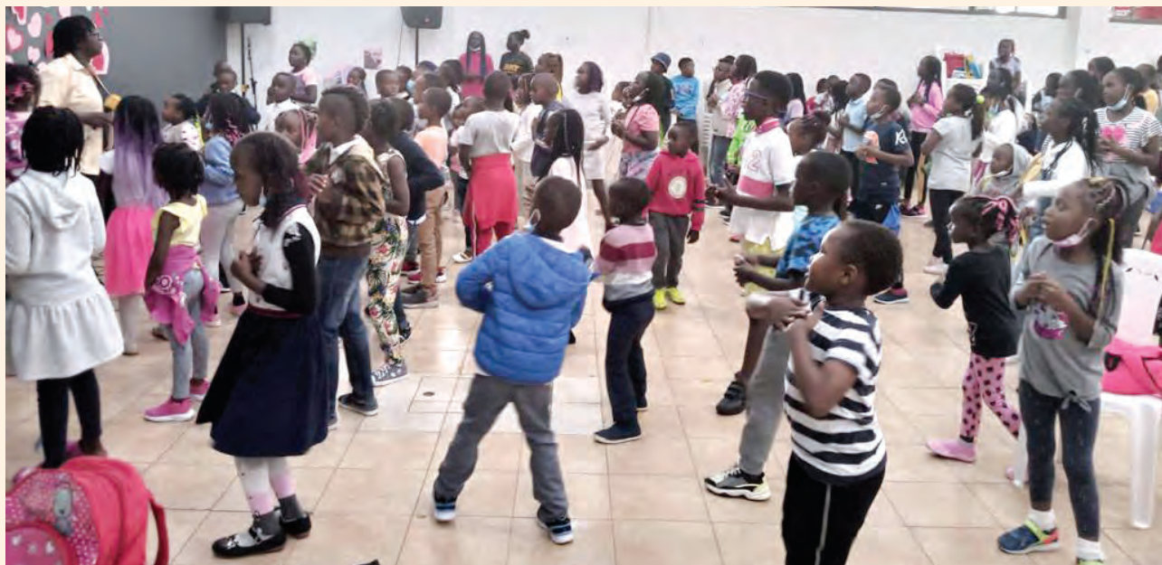
Holiday Bible Club

We held baptism classes and twenty (20) children aged between 7 to 13 years were baptized, we give glory to God.