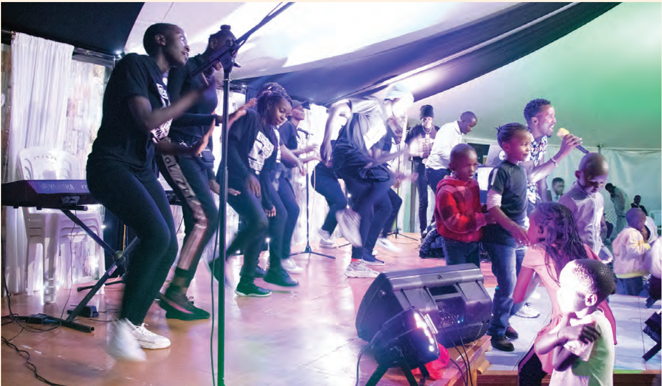
Back to school concert

The Church is blessed with a vibrant, growing Children's ministry; we thank God for the team of co-workers who serve tirelessly and sacrificially. After a long time, we held Holiday Bible Club in April 2022, in which over two hundred and fifty (250) children attended, and thirty (30) co-workers signed up to help with the activities during which many children encountered God and gave their lives to Christ. Learning of Scripture has been enhanced among the children through Bible Drills and