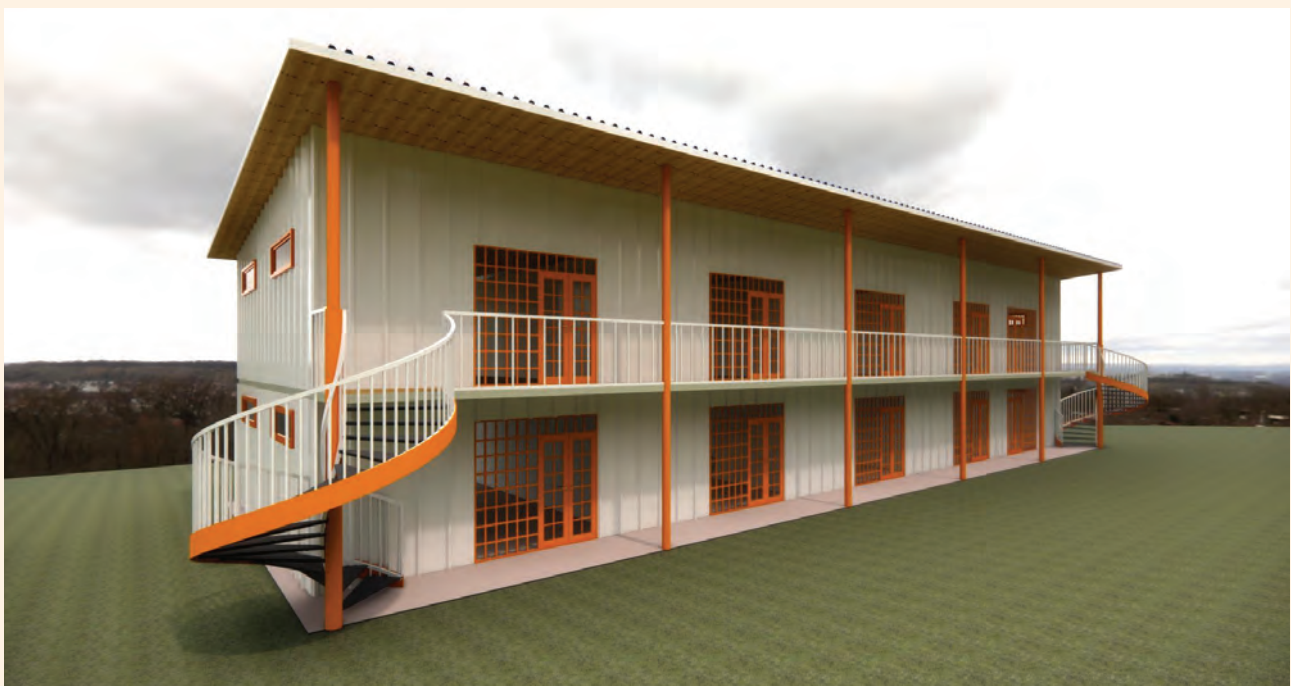
3D Architectural view of proposed Sunday School block

Not to us O Lord, not to us; but to You be all glory and honor.