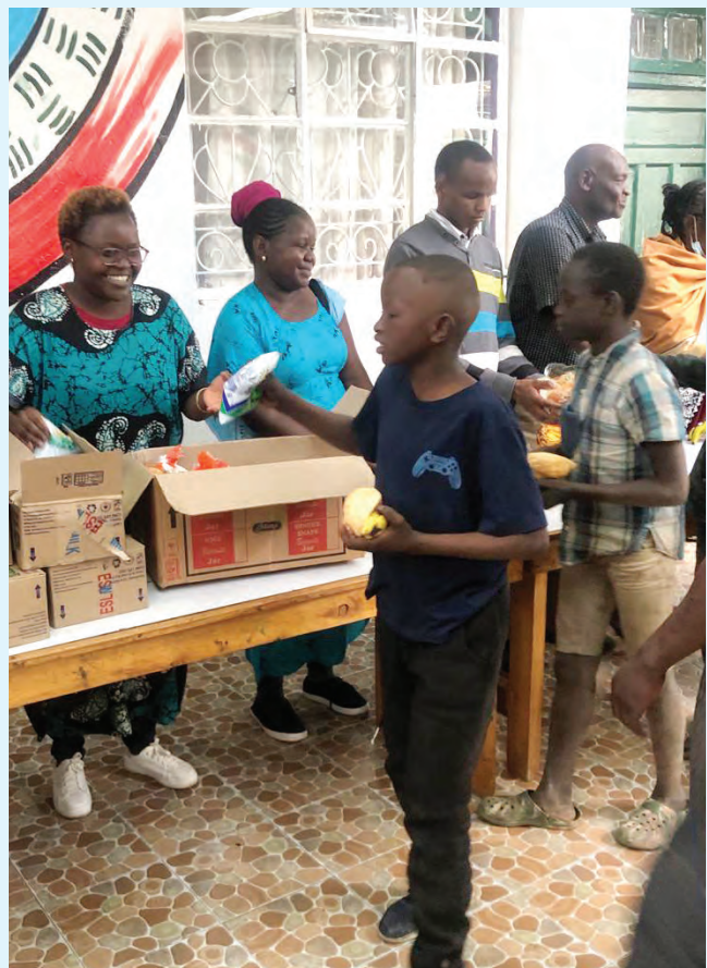
Staff in a mission