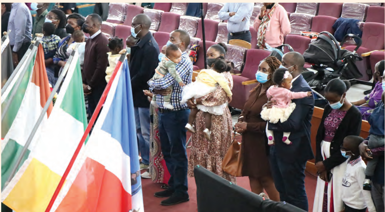
Child dedication Service

Couples have held four (4) online marriage building sessions with topics on the range of intimacy in marriage, through different life struggles.