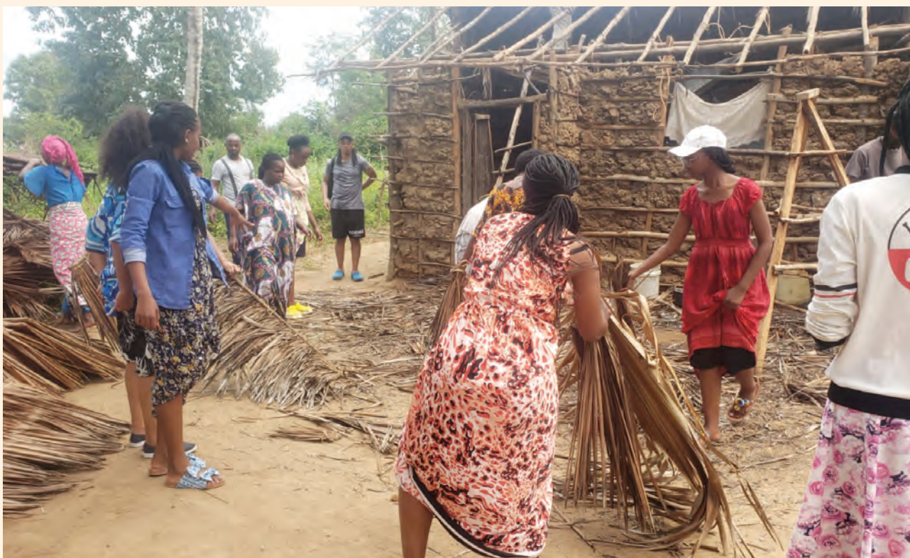
IMPACT in Kwale mission

The program ran from May to July and culminated in a graduation on the 7th of July. The ex-candidates were equipped on the various spiritual disciplines; learnt about various topics such as leadership, relationships, finances, time management, personality, etc.; and concluded with a camp in Diani. Within the camp was a day for outreach to our Mission Station in Dima, Kwale; in addition to sharing the gospel, a most memorable activity during the outreach was construction of a mud house for an elderly man. All in all, the theme for this year's program was emphasized, 'Don't Waste Your Life'.