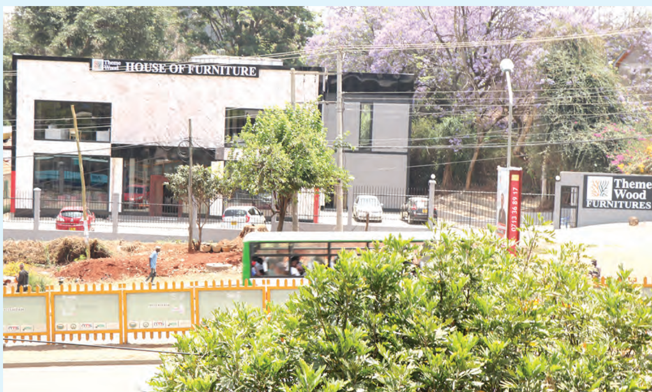
New Look of Annex Property

The economy has slowed down with the cost of living going up in the country. Despite of this, we were able to collect a total rent of Kes.13.7M as at 30th September 2022 against a projected level of Kes. 21.4M.