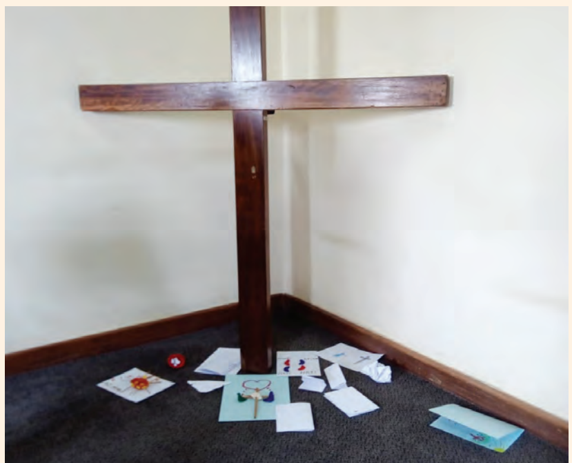
Outcome of an Art &amp; Trauma training session

Look out for the Jabali Family Convention in the fourth quarter of the year, it will be one of its kind! May God build us into strong family units, and a strong family of believers here at NBC.