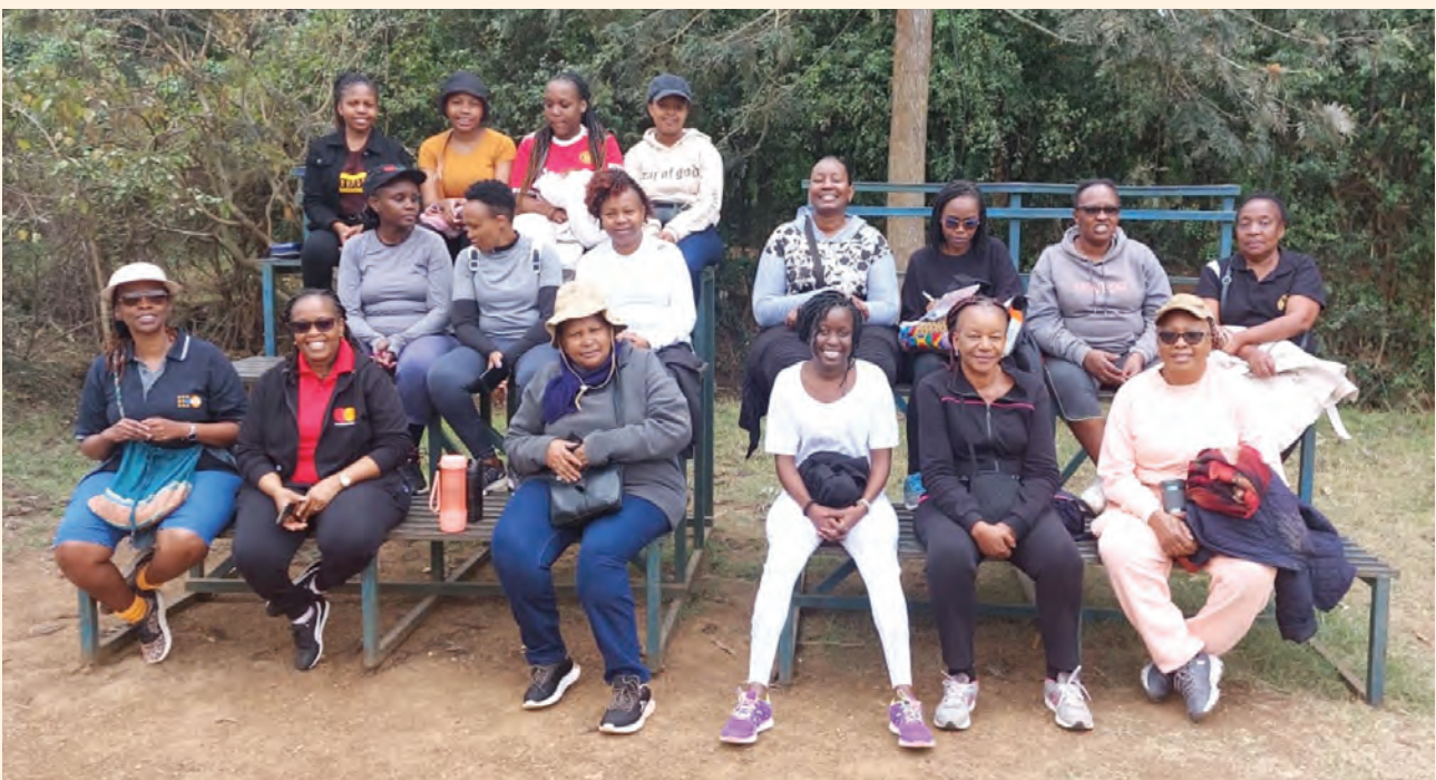
Angaza Ladies Outdoor fellowship'

In the monthly fellowship, the ladies have delved deeper into 'Grow and Grow', learning about discipleship and being agents of the gospel. The ladies have had two sessions of outdoor fellowship, walking through Karura Forest, while in fellowship with each other. They have actively participated in various mission initiatives of the church, to Mua Girls in Machakos, as well as to the home they adopted a few years ago: New Scent in Tala, where they were able to minister to the girls by sharing the gospel as well as gifts.