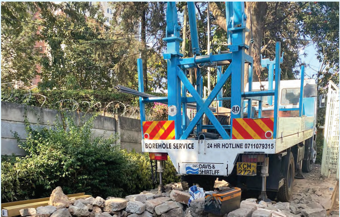
Borehole rehabilitation works

The company has reviewed various alternatives for this property and has, in conjunction with the Elders' Court, taken a step back to agree the best approach for future development opportunities.