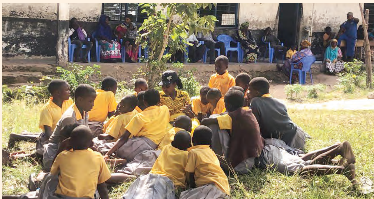
Kwale medical camp

enrichment seminar for the pastorate so as to strengthen the families. God has provided these host churches as partners for his work in Dima. They have participated in the PPI programs in schools and the Holiday Bible Club's that are held at the Station.