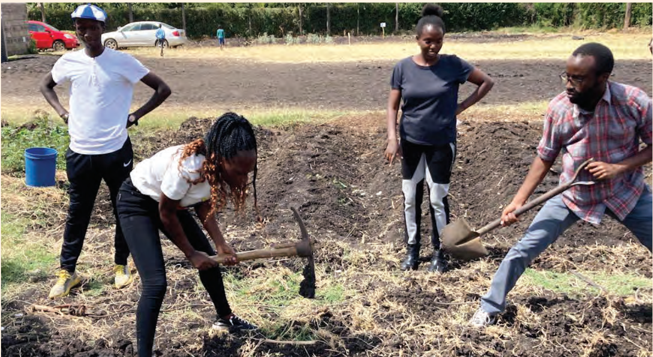
Youth Outreach at a Children's Home

The Youth Ministry continued with their own services but were also involved in the family service every fifth Sunday through preaching, worship, leading service, and presentations such as spoken words, dance and poetry. The children have certainly enjoyed the youthful energy of their older brothers and sisters and feel encouraged that they can look up to them.