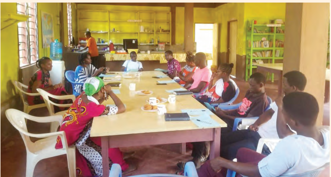
Tuition for Bapo Scholars at Kwale

Eleven (11) students were facilitated to join high school in form one. Holiday Mentorship and Study guidance for high school students done at NBC Ngong Road for two weeks where the mentors invited lecturers from Strathmore for the sessions. For Bapo Scholars in Kwale, a few youths from NBC Westlands facilitated holiday tuition for the students. For those in the program who had completed high school, a session was organized on career selection and were directed on how to engage with the Kenya University and College Placement portal. This enabled them select courses under guidance of the mentors. A total of eighty (80) students from all assemblies and mission stations, are supported through the Bapo Scholars initiative.