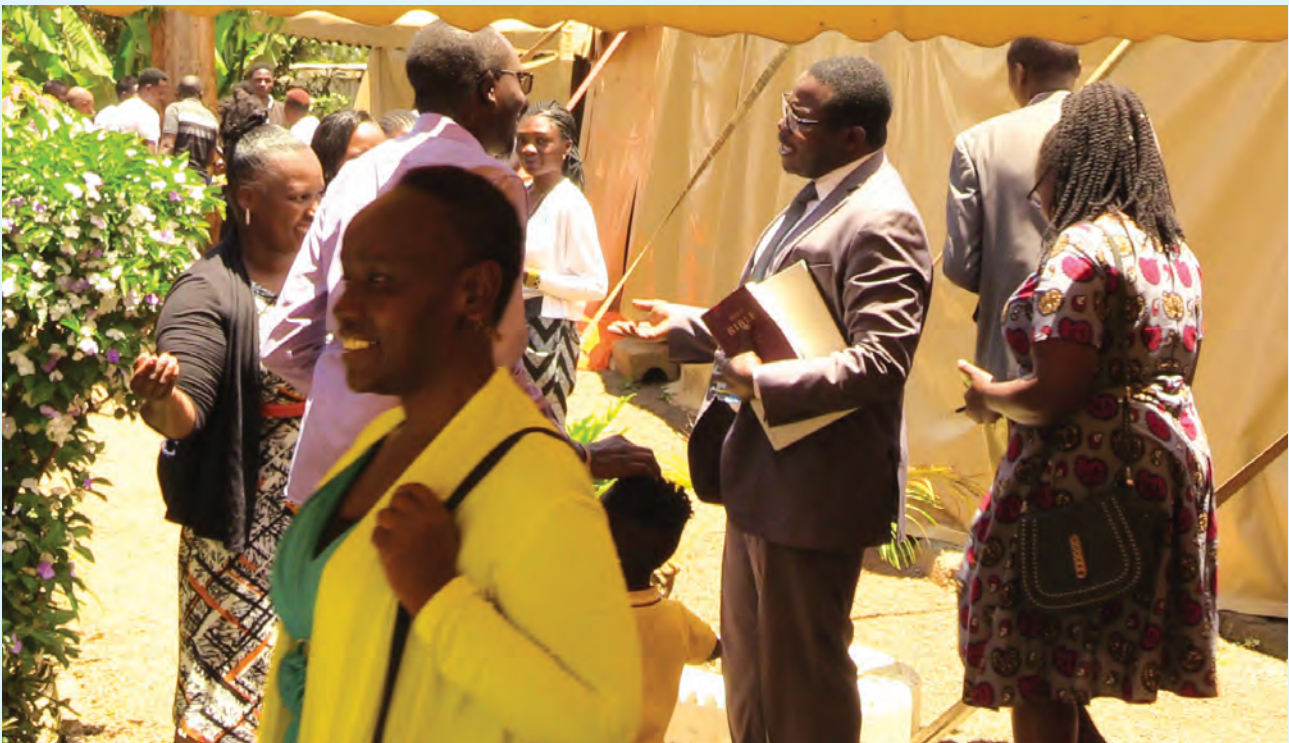
Fellowship after church

Eight (8) people went through training for facilitation of teenagers, particularly the ROPES program. This was made possible through Tanari Trust in partnership with the church.