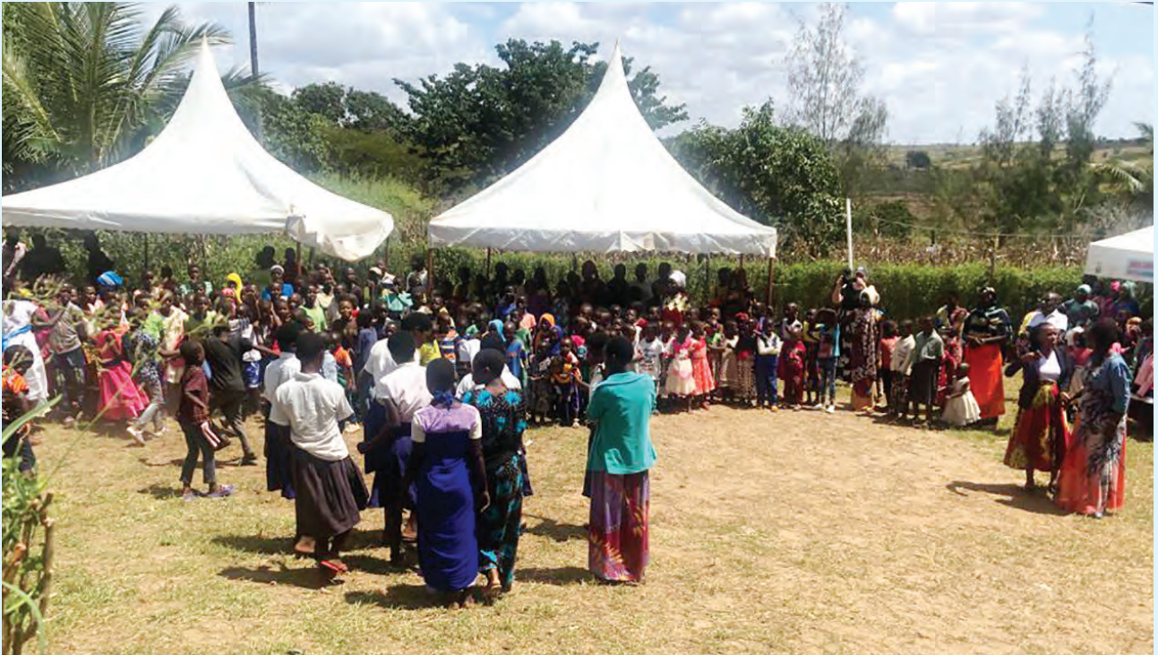
Kwale Mission Children's program

all our assemblies, the testimonies have been phenomenal. We also had several forums to train on integration of faith in the work place. As a Church, we are gearing up for engagement with mission work in Niger, we continue to pray ahead of active engagement. May we not grow weary in doing good, for all men, women and children need to hear and respond to the gospel. By God's grace we shall continue to be a Christ-centered Church that is establishing Strong Families and Transforming Nations.