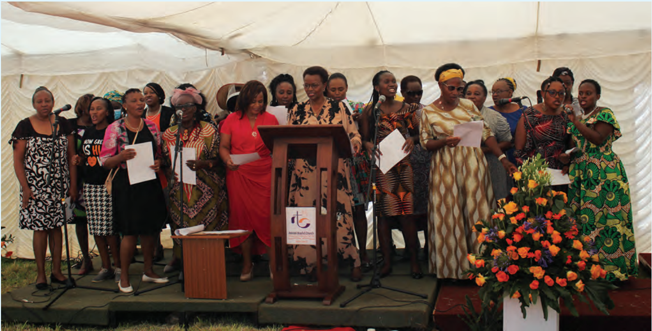
Daughters at 5th Anniversary