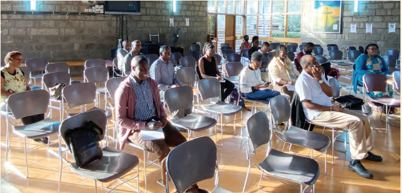
Training of Counsellors