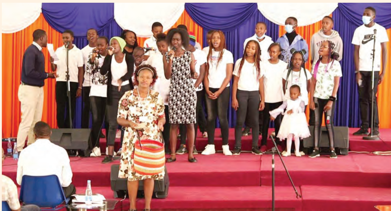
Teens-led Worship service