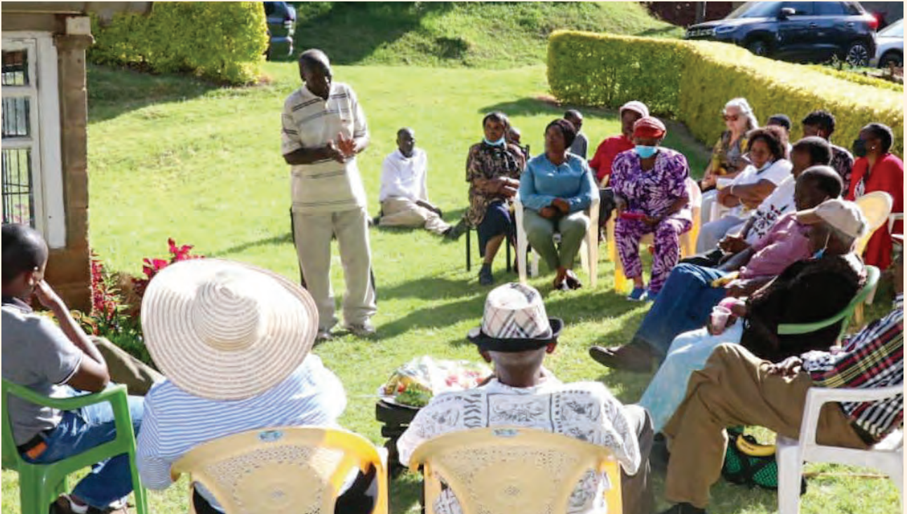
Senior Citizen's fellowship

The Children's Ministry has approximately thirty (30) teachers with twenty-six (26) of them actively teaching and the rest serving as assistants. The teachers have undergone training and evaluation to equip them in their service. Counselors were recruited for the Rites of Passages Experiences (ROPES) program.