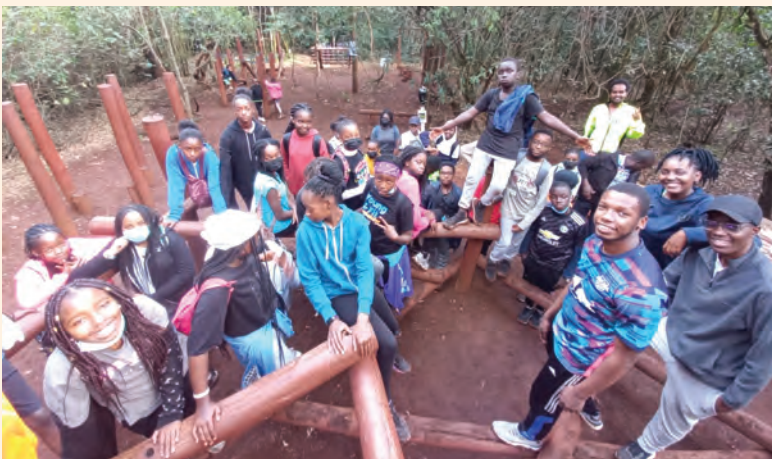
Ropers Day out

Forty eight (48) graduated from the 2021/2022 ROPES class in a colorful ceremony on 24th April 2022 and transitioned to teens' ministry. Currently, around fifty (50) are undergoing the rites of passage class, supported by a committed team of counsellors and their parents.