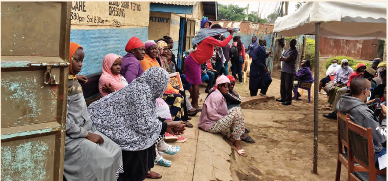
Medical camp at Chemi Chemi