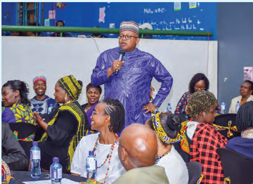
Go West Dinner