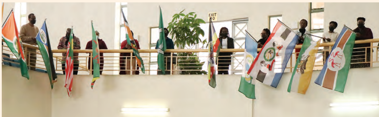
Parade of counties

At the beginning of 2022 we launched our annual theme 'Grow and Go'. A theme that has challenged us to grow in Christ in all aspects of our lives (Character, giving, prayer, leadership, fellowship and much more). This growth then should cause us to 'GO' to others, share the gospel and teach them all that Christ has commanded. The annual theme is projected through banners and the e-bulletin circulated each week. Even the pulpit area was designed with a completely new and catchy background to reflect the theme. More importantly, the theme has been expounded in our services through preaching, prayer and worship through music. The various sermon series in our services were true to scripture but also relevant to the times that we are in. We employed different tools in the services to help make the preaching themes clearer. Some of these tools are memory verses, video clips, live interviews and sermon series video trailers. We give glory to God for those who have received salvation and have been ministered to through the services. We thank the numerous co-workers who make our communal fellowship in the services what they are.