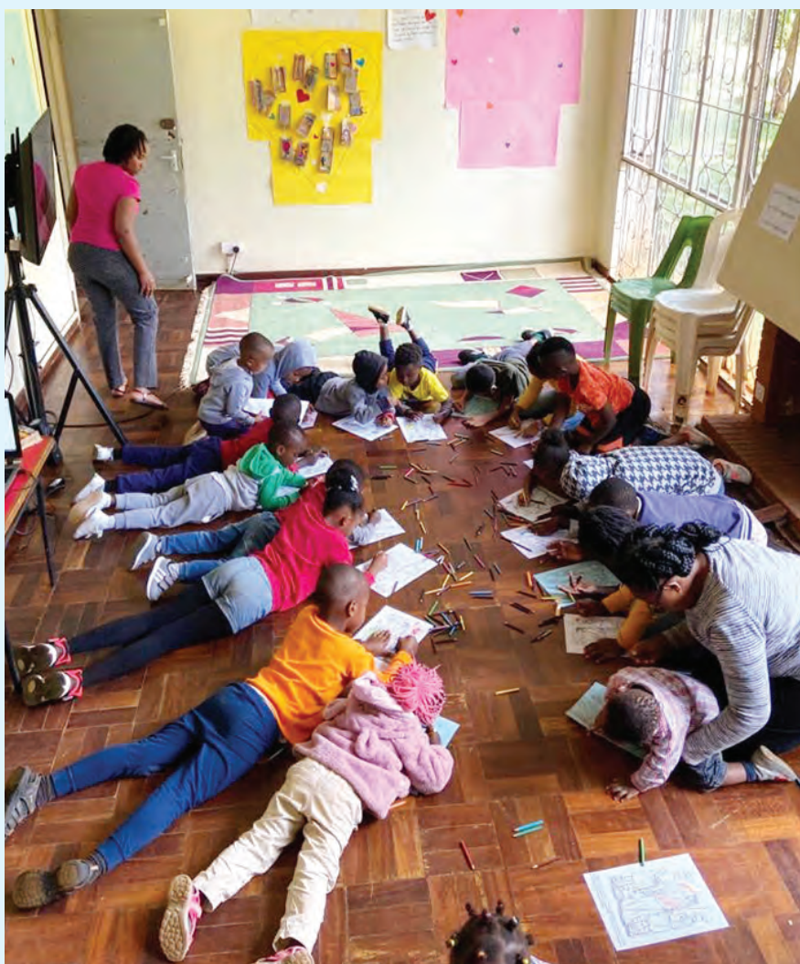
Holiday Bible Club

The Sunday school has grown from a single class Sunday to a triple class. We thank God for the generous donations of a family that donated tents where the children can meet, together with Sunday School Chairs. A Holiday Bible Club themed 'How Great is His Love' was held at Ngecha, in April 2022, in which an average of forty five (45) children attended. Alongside the HBC was a teens week, with fun activities and Bible Study. These culminated in a well-executed child-led Sunday service. We thank God for the extended time to disciple the younger generation. The Church adopted the Class 8 children of Farasi Lane Primary School and take them through the ROPES program and provide utility packs for the children. One hundred and thirty (130) children graduated from the 2021/2022 ROPES class, while the current class has one hundred and fifty five (155) children. A weekly Program for Pastoral Instruction (PPI) takes place in Primary school as well as the Farasi Lane Secondary School.