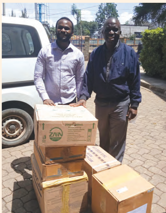
Receiving donation for Kibra medical camp

By June 2022, the clinic had attended to one thousand, three hundred and sixty-two (1,362) patients. In May 2022, the team did a health outreach that involved deworming and providing vitamin A supplements; one hundred and sixty (160) children were reached. The weekly mother-child clinic was recognized by the sub-county, and the clinic selected as part of a pilot study by World Health Organization, through Save the Children International. The team also donated a fridge for storage of the immunization medicines. In addition, an SMS Based follow-up system was implemented which has helped create more visibility of the facility and enhance services delivery, ensuring children do not miss their immunizations. Medi-care, therapy and social-economic support to HIV infected patients continues; the group has twenty-eight (28) members.