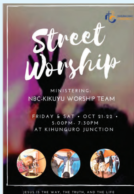
Street Worship Outreach

Outreach initiative in Limuru: We have started making inroads in Limuru area. We have visited children's home, contacted teens ministry and started youth Bible study. We are trusting God that this initiative though small now will grow into a congregation in the coming days.