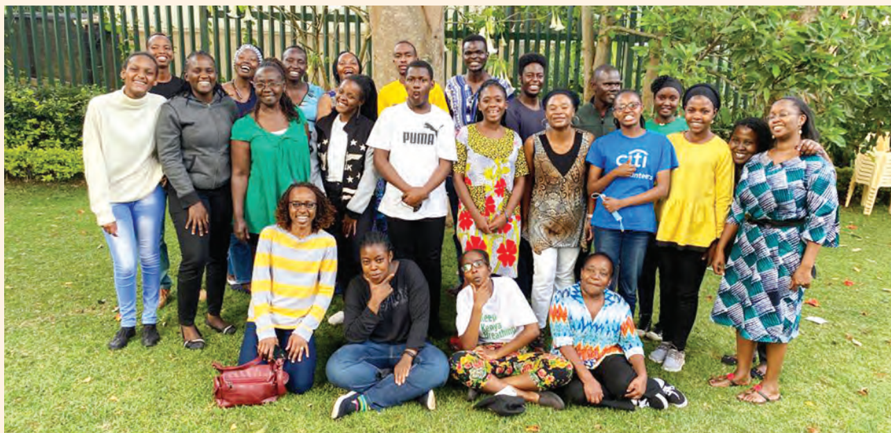
Worship ministry co-workers fellowship

In addition, this year we had the first live Easter Concert since COVID on 29th April 2022. This was a time of reminding ourselves about the wonder and power of the death and resurrection of Christ through song. The music teams also led the congregation in a wonderful time of musical worship during the Renewal week held on 7th to 9th September. This year we also had visiting music teams come to enrich our worship experience during some of our services. Some of the guest teams were Benefit experience Band and Twakutukuza choir. Our music team was also invited by Karen Community Church (one of our sister churches) to lead musical worship in June 2022.