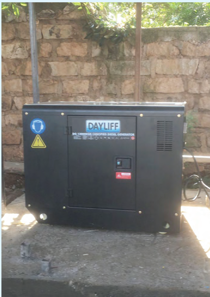
Generator installed for NBC Kikuyu

Expenditure continues to be guided by the approved annual budget and aligned to the actual income. We thank God for resources raised through the Go and Grow Resource Mobilization initiative, a portion of which enabled assemblies to be resourced with equipment necessary for ministry such as worship equipment and generators. The Church also facilitated all staff through purchase of laptops, the old ones were retired, some with over ten years of use.