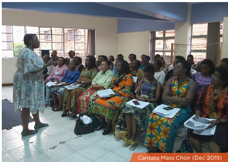
Cantata Mass Choir (Dec 2019)