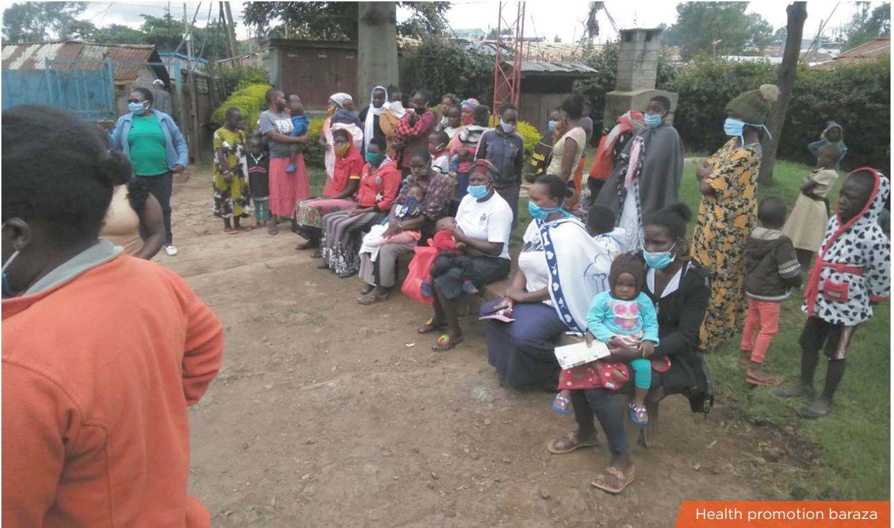
Health promotion baraza