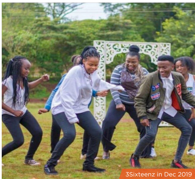
3Sixteenz in Dec 2019

Other ministries that have had the opportunity to meet online include the ladies, men, couples, worship team, and the young adults. The Kupaa ministry [a mentorship ministry for those who have just finished university studies] also met several times to finish the curriculum they had begun, which they successfully completed in July 2020. We thank God that there has been continuity of fellowship across various ministries at this time.