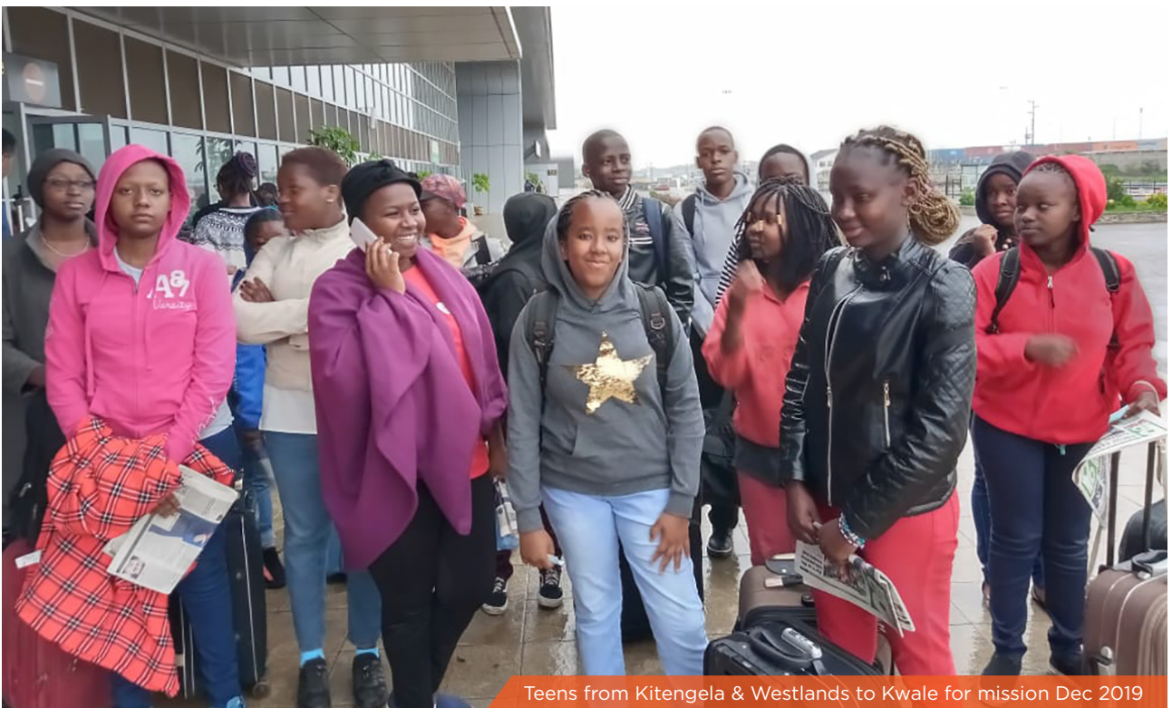
Teens from Kitengela & Westlands to Kwale for mission Dec 2019

In 2020, NBC supported five (5) students in theological studies, nine (9) missionaries who work in different communities in the mission field and eleven (11) mission organizations/agencies. The Church is also training-on-the-job six (6) Pastoral Trainees.