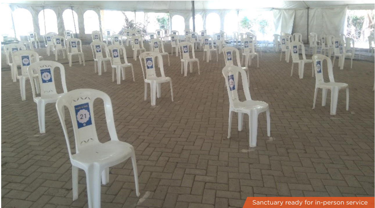
Sanctuary ready for in-person service

The measures to be taken to safeguard against the spread of the coronavirus as churches resumed in-person services, brought to light God's fitting provision. When we sought a meeting tent in 2019, we initially identified one but it suddenly became unavailable. We ended up getting a bigger tent than we had estimated we would need at the time. The bigger tent has made it possible for us to host the entire 1st service congregation, even with physical distancing! God surely ordered our steps in that purchase! We also thank God for the generosity of his people who gave sacrificially