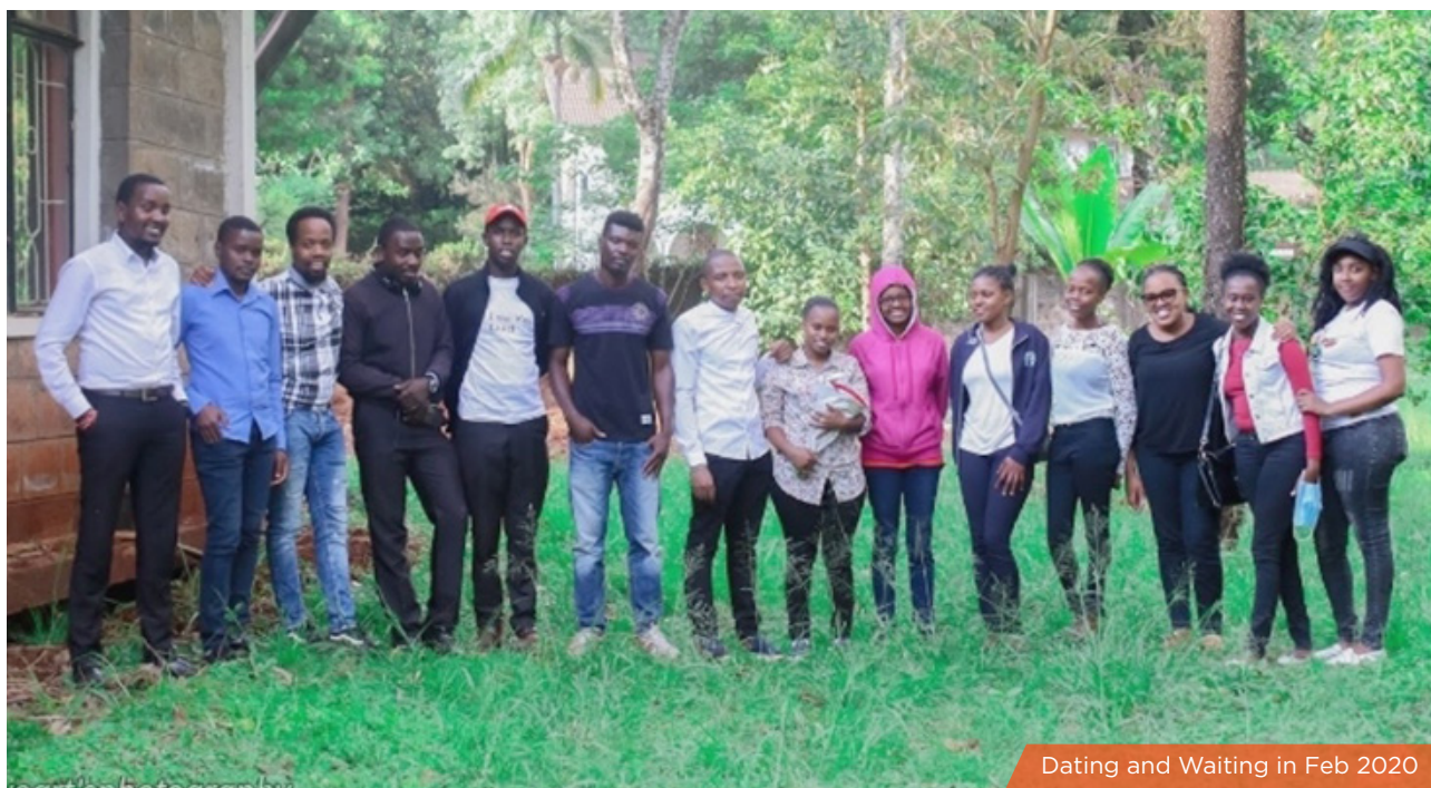
Dating and Waiting in Feb 2020

A ministry that started late last year but gained traction this year is “Dating and Waiting Club”. The ministry was a response to a number of young people from the university joining the church last year. It enables the young people who are in relationships to date each other in a God honoring way and to be mentored as they do so. They have continued to meet every month on zoom and three couples from the group have declared their intentions to get married next year, one as early as March 2021.