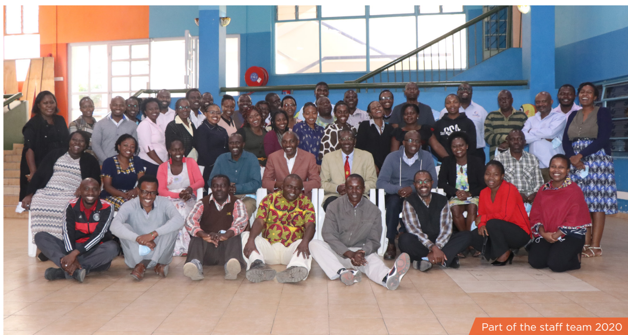
Part of the staff team 2020