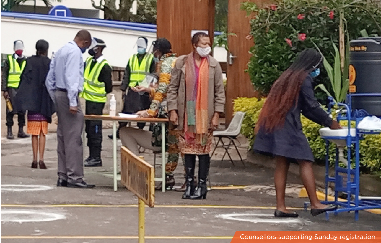
Counsellors supporting Sunday registration