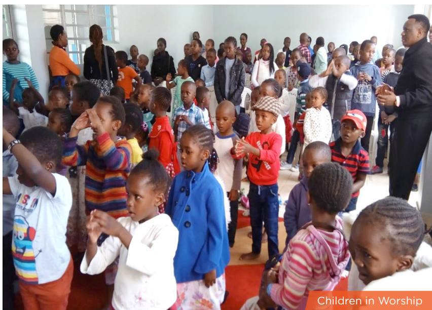
Children in Worship

and created WhatsApp groups for parents where they connect, communicate and minister to the children. Teachers post study materials, video clips and scripture memory, and get feedback from the children through the groups. It has been exciting for children to still learn about God and his unchanging character in such a time and meet with one another in the virtual platforms.