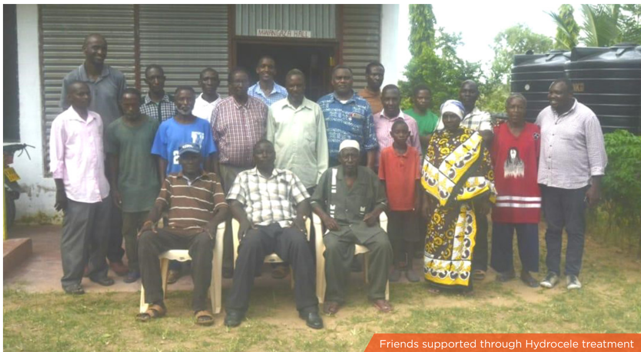
Friends supported through Hydrocele treatment

The Men's ministry of NBC Ngong road successfully supported and participated in a special medical camp for men living with Hydrocele disease for years. Subsidized from the Church kitty, men had an alliance of doctors from Kwale, NBC and others perform a surgery on thirteen (13) hydrocele (male) patients. The men had time to evangelize to the patients and set off missionary relationships before the surgery. What a sacrifice, relief, and joy to their families and the wider community.