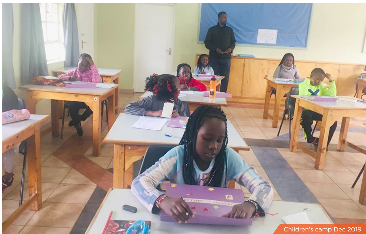
Children's camp Dec 2019

The corona pandemic caused us to adjust our approach to ministry. A steering team comprising five teachers and the two pastors for children was formed to consider the challenges, identify opportunities and provide direction on the best way forward. It is out of this that the ministry ideas have grown from placing materials on the website for parent's to access, to opening up an NBC KIDS CHURCH YouTube channel where recorded lessons were placed, to now having a live streamed children's service. The teachers have been amazingly supportive and committed, faithfully ensuring lessons are ready every week and thereby ministering to the children. A good number of children have also participated by sending recordings with presentations, or memory verses, or undertaking an activity challenge given. An average of 600 viewers engage weekly. We appreciate involvement of all the assemblies who have not only participated in development of content, but also participated in the services.