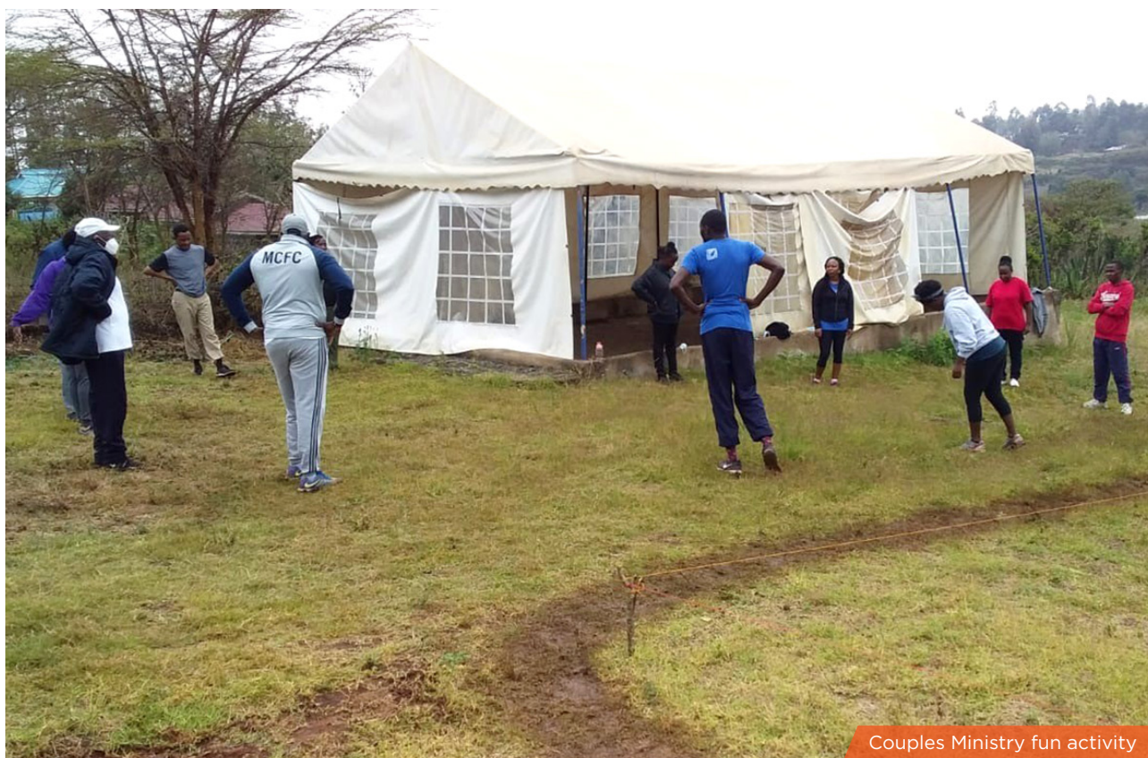
Couples Ministry fun activity