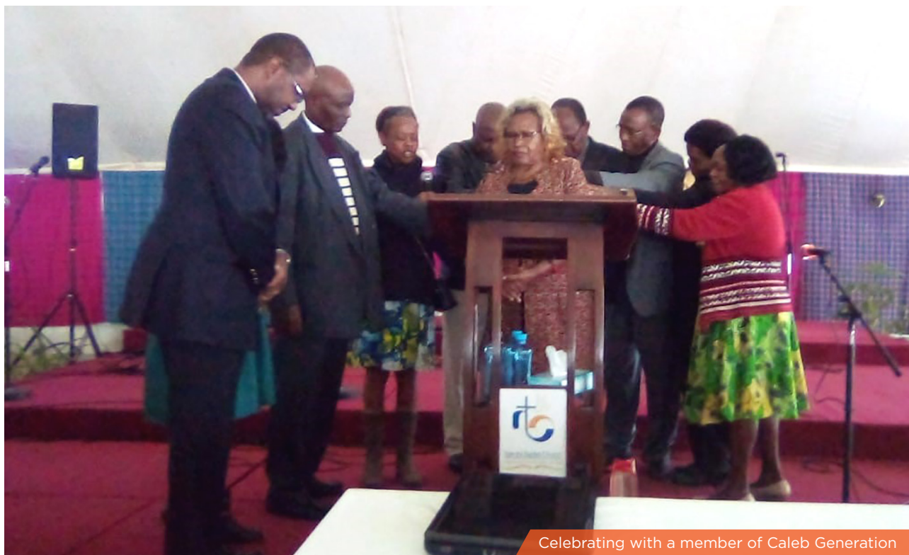
Celebrating with a member of Caleb Generation

In January 2020, the Kité Caleb Generation had the joy of celebrating the graduation of one of their own who had earned both a bachelor's and master's degree. It gave us a good opportunity to give thanks as a congregation and to affirm the truth of Psalm 92:12-15 that, "The righteous will flourish like a palm tree, they will grow like a cedar of Lebanon; planted in the house of the LORD, they will flourish in the courts of our God. They will still bear fruit in old age, they will stay fresh and green, proclaiming, 'The LORD is upright; he is my Rock, and there is no wickedness in him.'" This joy was dampened as the Angaza Ladies, Men of Valour and Caleb Generation were not able to hold their scheduled meetings following the lockdown and gathering restrictions. The Caleb Generation and those with existing medical conditions (who include some younger congregants) bore the greater burden of these restrictions. Thankfully, those within the Caleb Generation age were allowed to resume in-person service attendance at the end of September 2020.