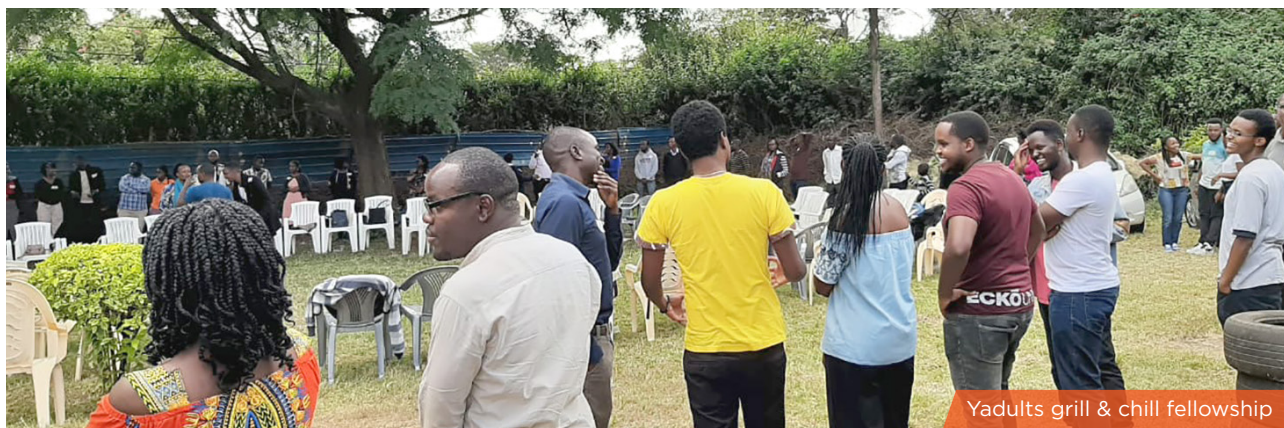
Yadults grill & chill fellowship

We pray that through these initiatives and others, as the Lord leads us, the youth and young adults will continue to grow and be strengthened in faith.