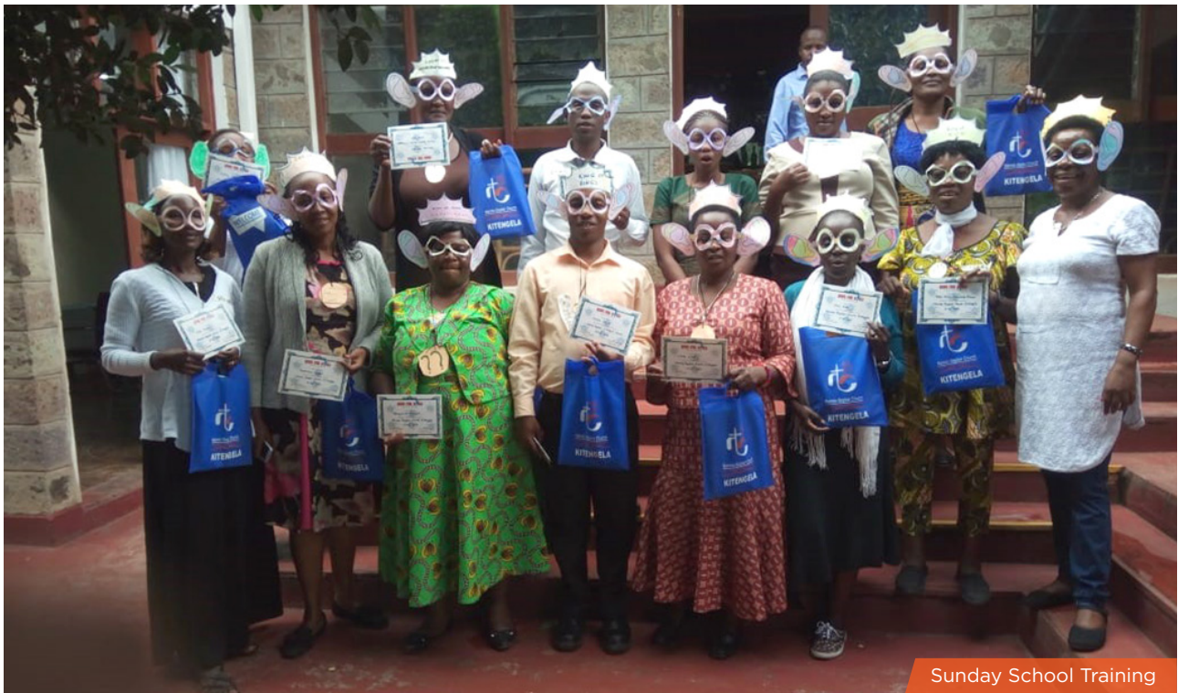
Sunday School Training

We began the year 2020 in obedience to Prov. 16:3, “Commit to the LORD whatever you do, and he will establish your plans” and here we are looking back to see yet another truth strongly confirmed: “Many are the plans in a person’s heart, but it is the LORD’s purpose that prevails” (Prov. 19:21). The LORD God who in his Sovereignty and Eternal nature knows the end from the beginning and what is yet to come, moved the history of 2020 as he pleased; according to his purpose (Isaiah 46:10). May it all be to his glory and praise!