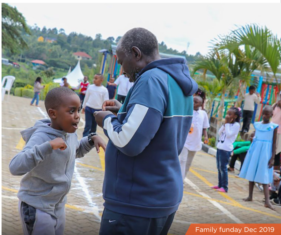
Family funday Dec 2019

Over the years, we have established a relationship with our surrounding community through the door to door evangelism. This year God provided another opportunity to demonstrate his love by providing food through the Love box. They came from within and far and we got a chance to establish new relationships, to share the gospel, to pray and encouraged many. As we adhered to the Government regulations, we were able to visit some when they could not make it to Church. We thank God for many who gave sacrificially even when they were facing uncertainty. As a result, we had people giving their lives to Christ, families encouraged and more so the testimonies of God's faithfulness.