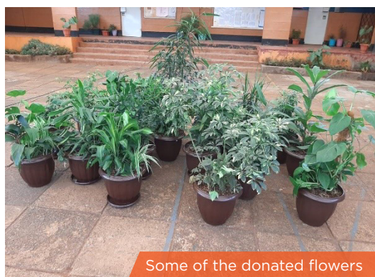
Some of the donated flowers

The services are going on well as improvement on the venue continues. We thank God for this move, which is not only cost saving but has also taken the church to the vicinity of our Ngecha property