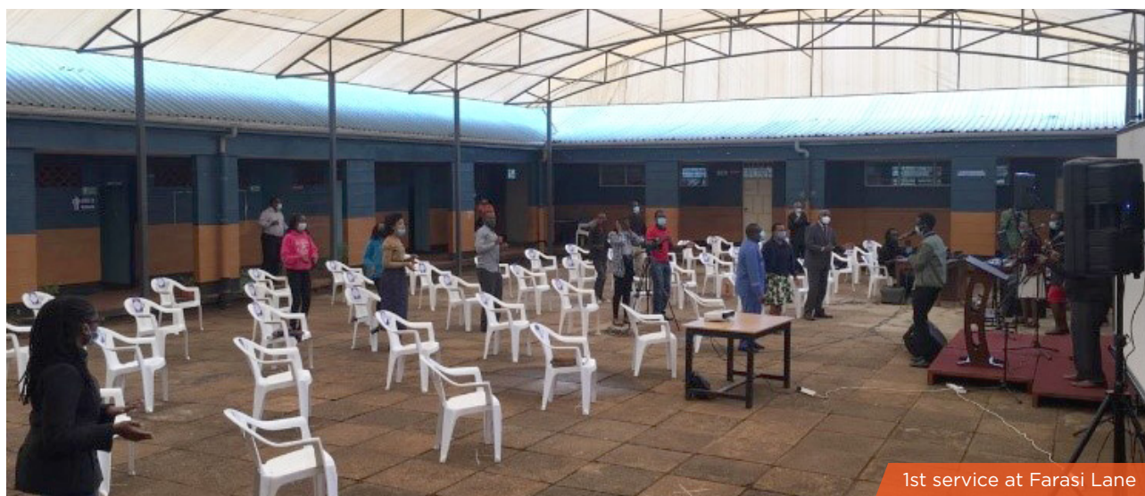
1st service at Farasi Lane

We have received very positive feedback on these videos. The congregation is now psyching up for the "Philippian Challenge" which will run until January 2021 when we hope to have memorized the Philippian letter.