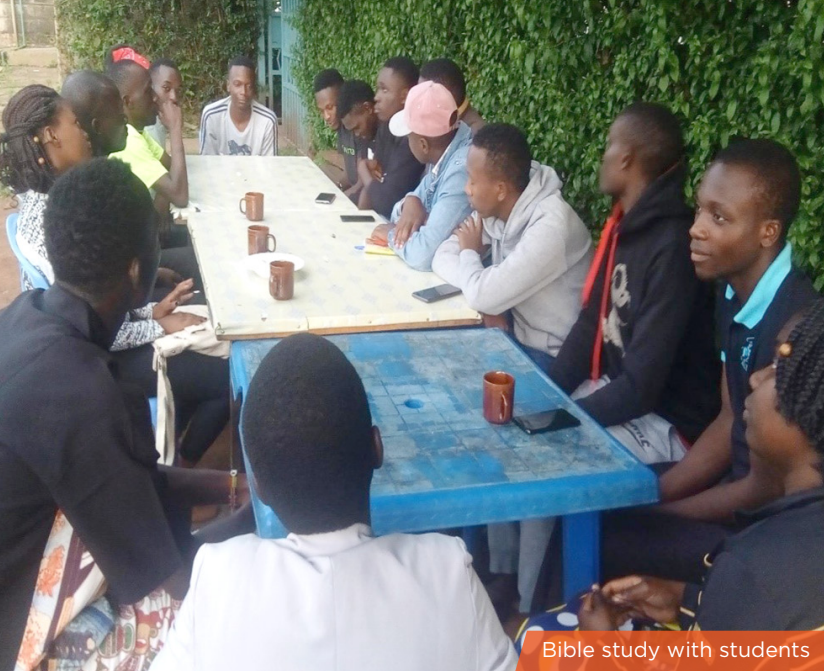
Bible study with students