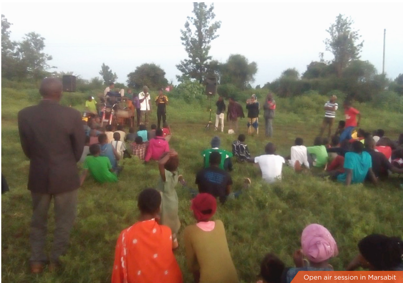
Open air session in Marsabit

We closed 2019 with a fact-finding mission to Marsabit with a view to assessing possibility of adopting one of the communities as another area of mission focus. We barely had started planning a series of follow up and mission trips before Corona struck. The mission team discerned a receptiveness to the gospel and have partnered with a group of believers, and recent graduates from the area. There are children to be fed, women to be clothed, school children to be supported, men to be empowered and church leaders to be disciple. May the Lord make a way!