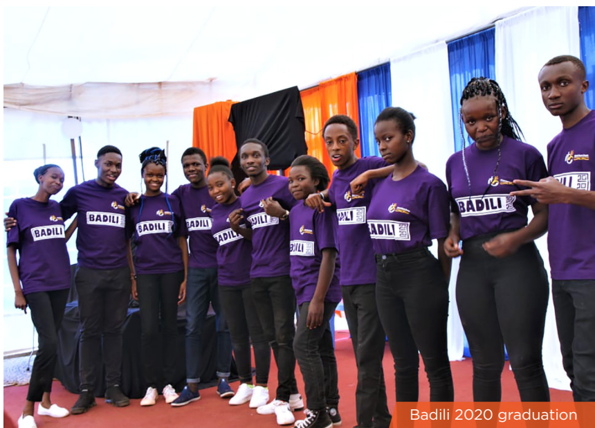
Badili 2020 graduation

This program for ex-candidates halted soon after it was launched. However when a window of fifteen (15) people meetings were allowed, the program was restarted. We are glad to report that ten (10) youth successfully completed and graduated in a colorful Sunday service. These young people have been plugged into and are actively participating in ministry. We pray we shall have opportunity to positively impact young people within the community and enable them think positively of themselves as God's children.