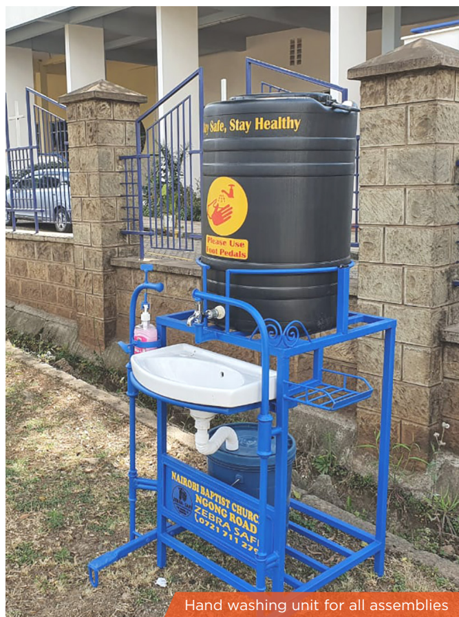
Hand washing unit for all assemblies

Through the procurement office, we have streamlined suppliers through pre-qualification, ensuring services required by the church are available from vetted suppliers. NBC is in the process of evaluating tenders for security and cleaning services, a process that is expected to be concluded in October 2020. We look forward to improved service delivery in these two critical services.