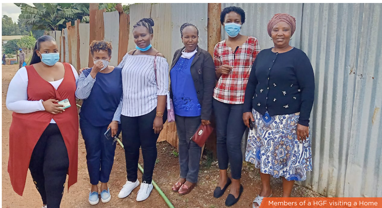
Members of a HGF visiting a Home

The ministry team visited Langata Women's prison every Tuesday of the first quarter for Bible study and prayer time with the ladies. It was amazing to see hope come alive through study of God's word. The team also donated toiletries and was in the process of following start-up of a Sunday school class alongside the adult Bible study. We look forward to resumption of this ministry once restrictions are lifted.