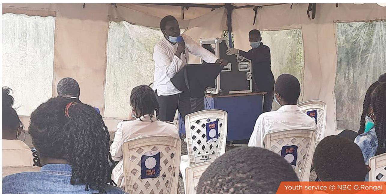
Youth service @ NBC O.Rongai

This year saw growth within the youth ministry both spiritually and in numbers. The ministry had to be split into two: The teens who met each Sunday and the young adults who joined the adults' church and had fellowships during their monthly hangouts. Our 2020 Impact Program had twenty (20) ex-cans who met weekly for their training. We thank God for a revamp on the Bible