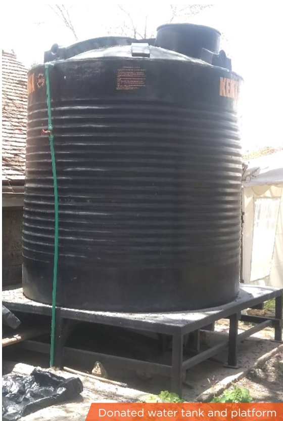
Donated water tank and platform

given throughout a very difficult year. In addition, as at September 2020, the church had received a number of gifts in kind including: An 8000-litre water tank and its supporting frame, 9 litres of hand sanitizer, two 43" LED screens, and two lapel microphones with their receivers.