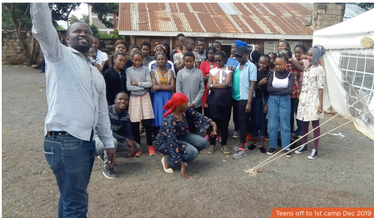
Teens off to 1st camp Dec 2019

During the first quarter a group of twenty one (21) congregants were received into membership, having completed the membership process.