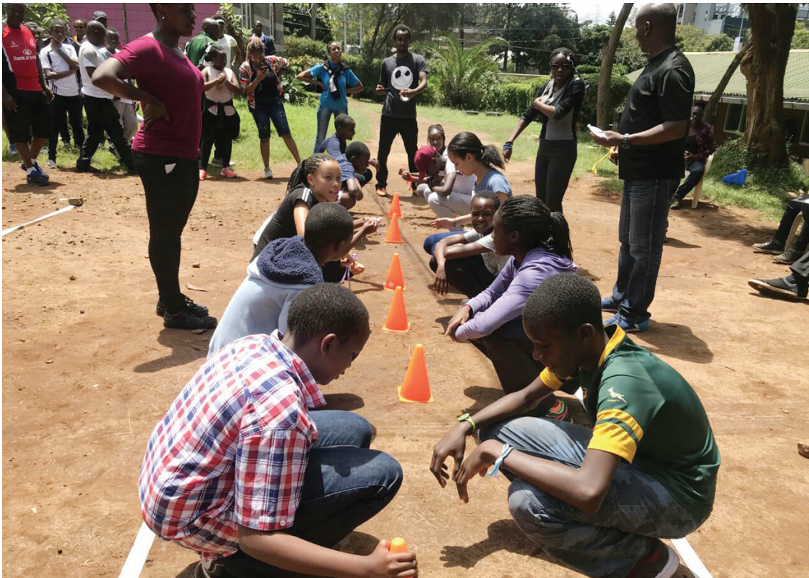
Children-ROPES family funday

The 2018 ROPES (Rites of Passage Experiences) class has 61 teenagers participating. The parents have shown great commitment to the programme. The class held a family fun day in April 2018 where children and parents interacted in fun activities and a sleep over. The programme culminates in a camp which will be held in December 2018.