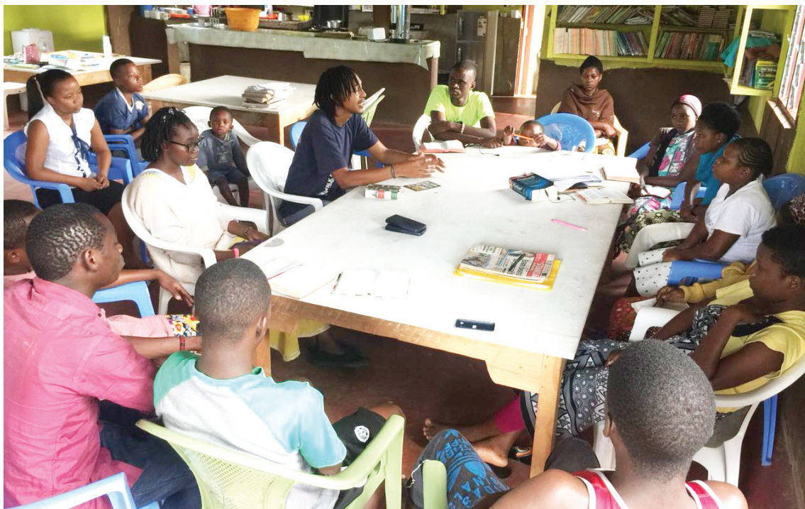
Tuition in Kwale by one of our youth

We thank God for the positive report received from County Public Health officers who checked the clinic for compliance recently.