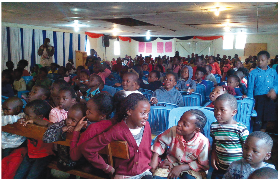
NBC Kibera Children