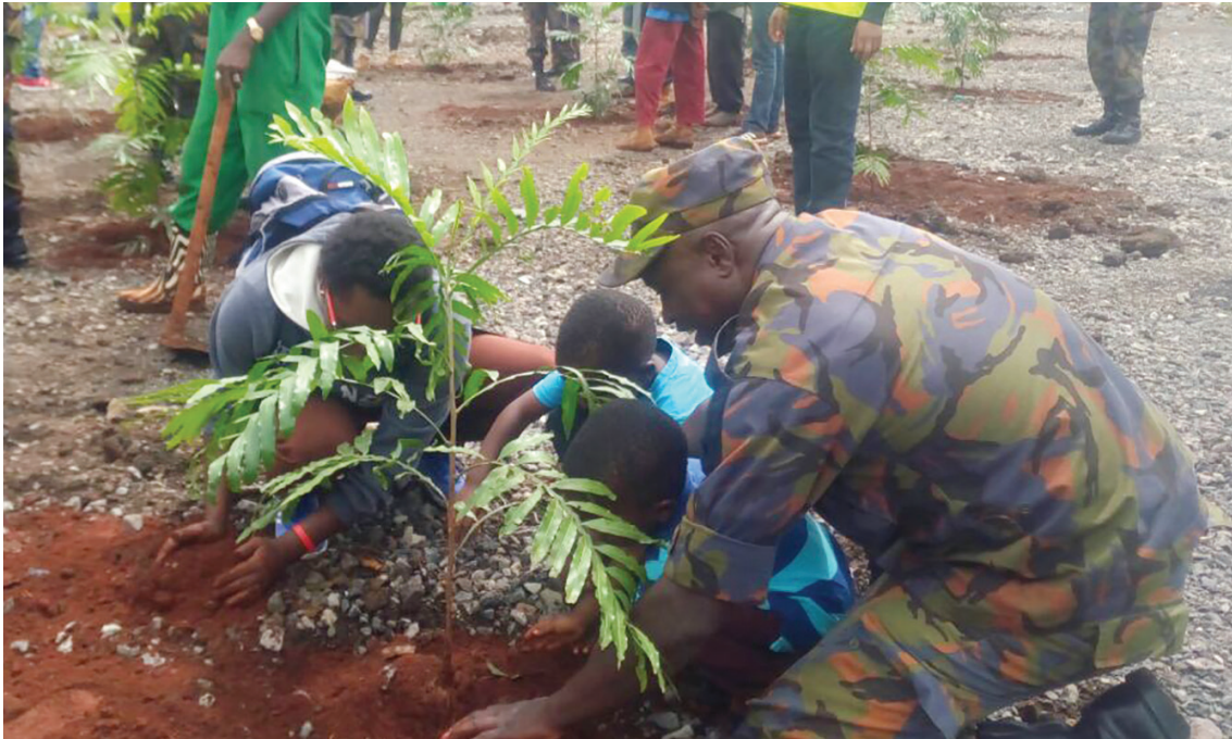
Tree planting along Ngong Road

The growth through church planting has been exciting and stretching at the same time. We are learning and making adjustments as we move forward. Below is an outline of staff movement: