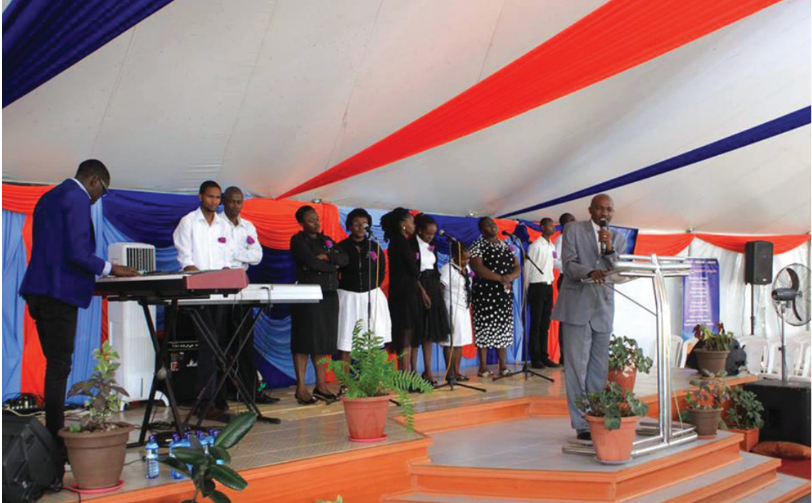
NBC Rongai Service