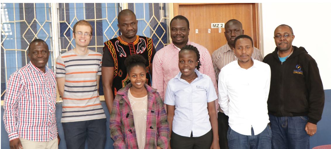
Lunch with some of the 2017 visitors