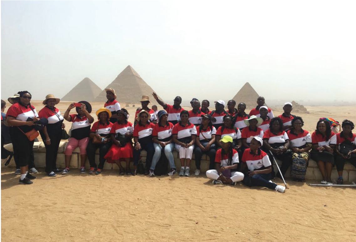
NBC Pilgrims in Egypt-Isreal trip

homes for fellowship and in also to serve Holy Communion together with the Pastor in charge. The Caleb Generation Melodies was recently formed with the intention of promoting hymn singing and coordinating hymn fests.