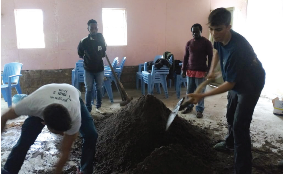
Friends from Ireland improving Church facilities