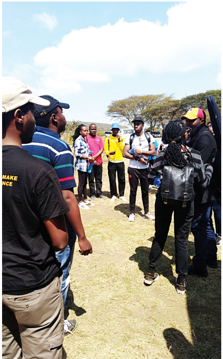
Yadulcs hike to Mt. Longonot

The church is now daring to go out and reach out in the streets, institutions and neighbourhoods the motivation being to advance the gospel in Westlands. We have had several engagements with Chiromo Campus of Nairobi University which have seen several graduates from the campus become regular attendees. Other outreach activities lined up in the month of October 2018 include: a Coffee Run [an outreach within the streets of Westlands at night] and Men [Princes' Ministry] outreach in Lower Kabete Campus where they will lead the service, preach and have a talk with the students after the service. It is our hope that these two universities will be the bed-rock of our students outreach. Pastoral Instruction (PPI) has also started in Cheleta primary school with others to follow. All Vine Groups have also been challenged and encouraged to not only disciple but also to reach out in their different areas of influence.