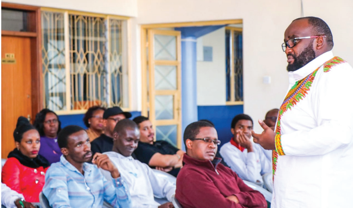
KUPAA in session

The monthly young adults' fellowship is vibrant and exciting. There has been good attendance and participation from the young adults. A recent fellowship brought together 80 young adults.