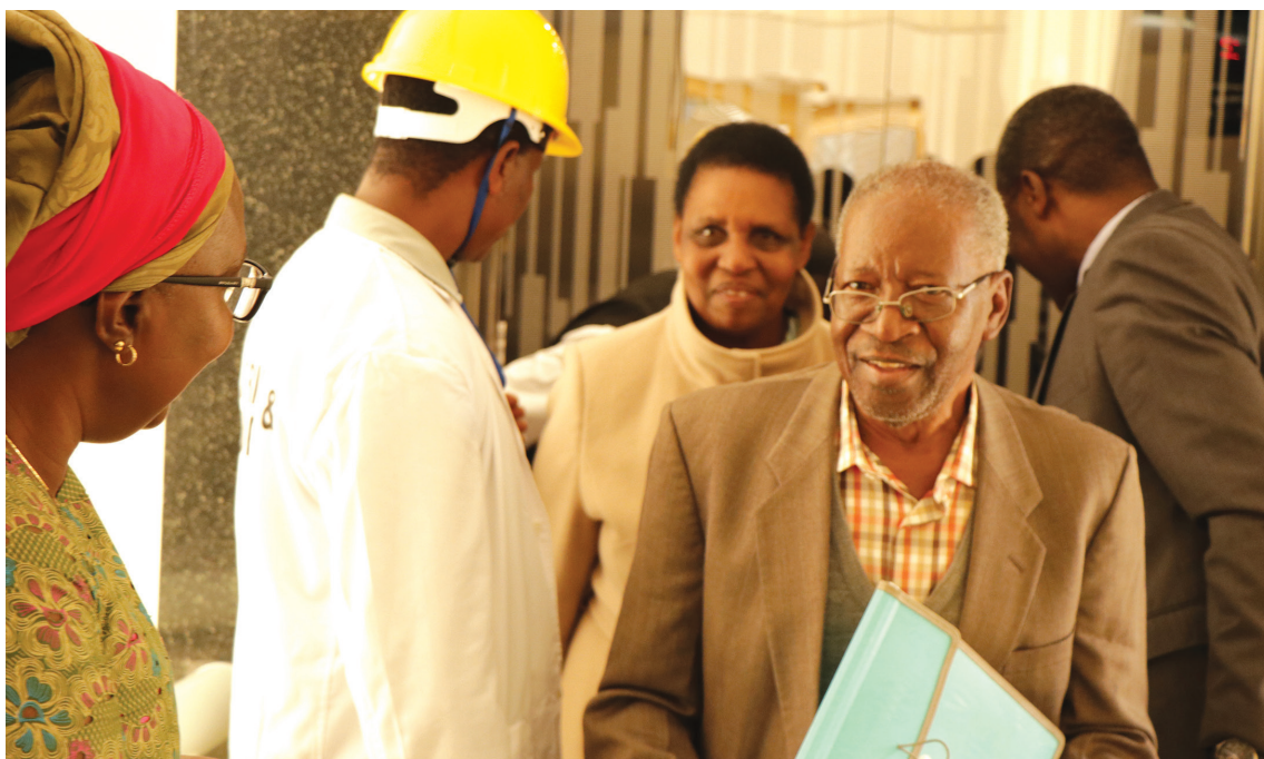
Lift Commissioning & handover

Besides the normal operations, the Finance section was able to facilitate acquisition of a Bank loan to settle NBC Westlands, following member's approval in the Members Day of November 2017. We are grateful to God for enabling us to acquire this prime 2.51 acre land situated on Ngecha Rd near Lake View estate, Spring Valley where we plan to settle NBC Westlands once the change of use status is approved by the County Government.