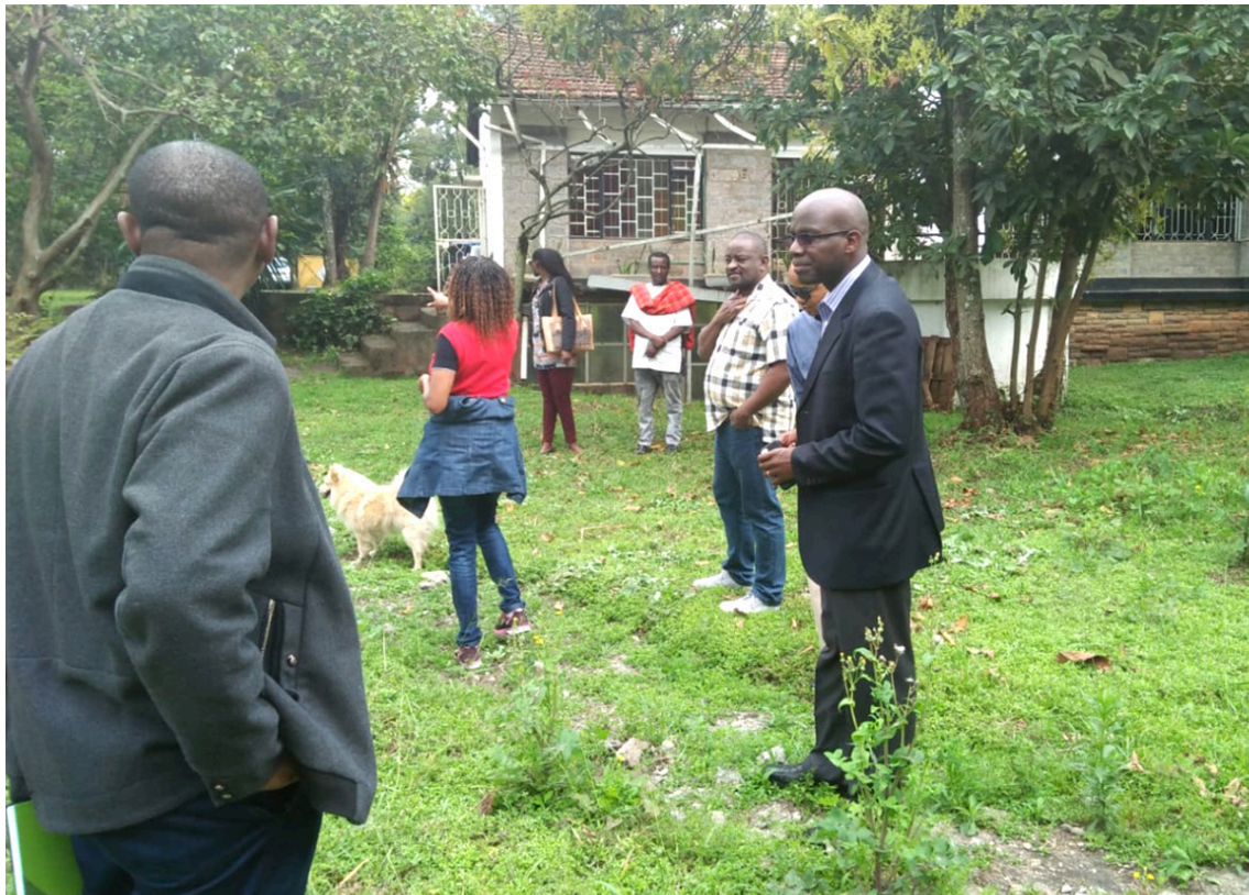
Handover of Ngecha Rd property

We were able to get more stable, reliable and less costly internet connectivity at Ngong Rd. The new connection reduced the monthly cost with about 70% from what we have been paying previously. For the other congregations, we acquired mobile routers that have enabled them to access internet also at lower costs. We have automated room booking at Ngong Rd with an online system. We now have a new looking website that is continually being updated and revamped. We hope to have more processes automated as we go along at minimal costs.