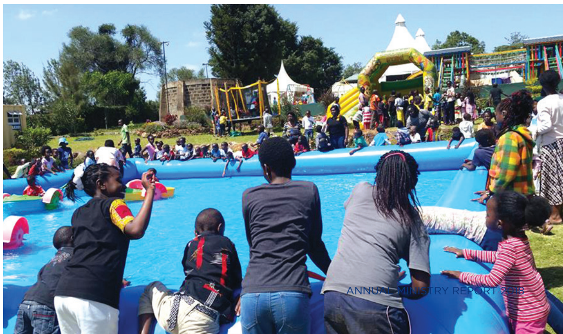
NBC Rongai Family Fun Day

Children’s ministry as one of the pillar ministry at NBC-OR has experienced significant growth which we are really grateful to the Lord for. Our regular Sunday school attendance is between 180-200 children. Because of this growth, we are making preparation to have more classes and to subdivide some of the classes that are too big. We thank the Lord for the Sunday school teachers who are committed to see our children taught in the ways of the Lord. The April and August Holiday Bible club brought together an average of 250 children per day. One of the challenges that we experienced is the need for better Sunday School classes especially during rainy seasons. We hope to develop the plan for better Sunday School class in the coming year.