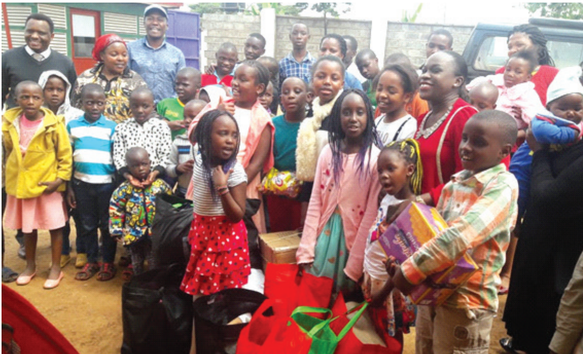
Each one teach one Outreach

We have so far had 80 visitors for the first three quarters of the year. The hospitality ministry has diligently handled the visitors every week and held three luncheon for visitors and the church with the help of the hospitality team managed to gift each one of them with an NBC Westlands visitors pack. Among these, 24 of them are now fully plugged into ministry and our prayer is that all of them will fully plug in.