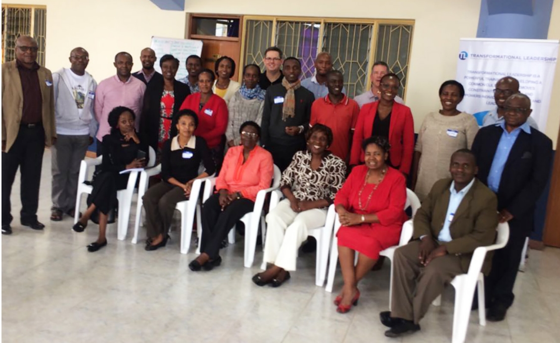
School of Leadership participants