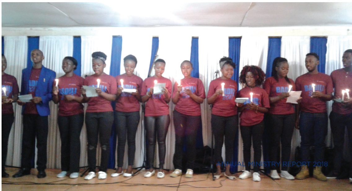
2018 BADILI participants

May God's light continue to shine brighter and brighter in our community.