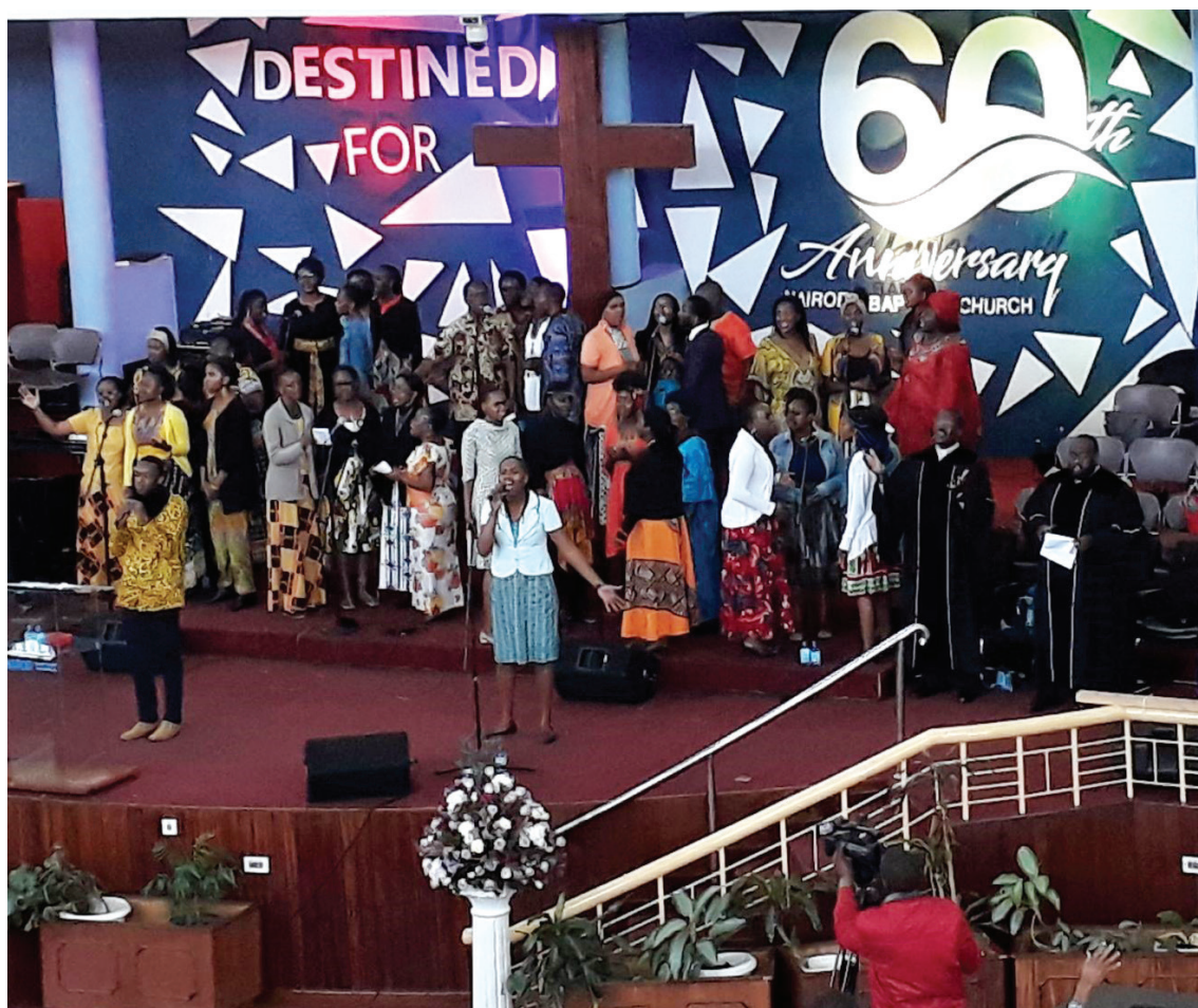
Leading worship through music