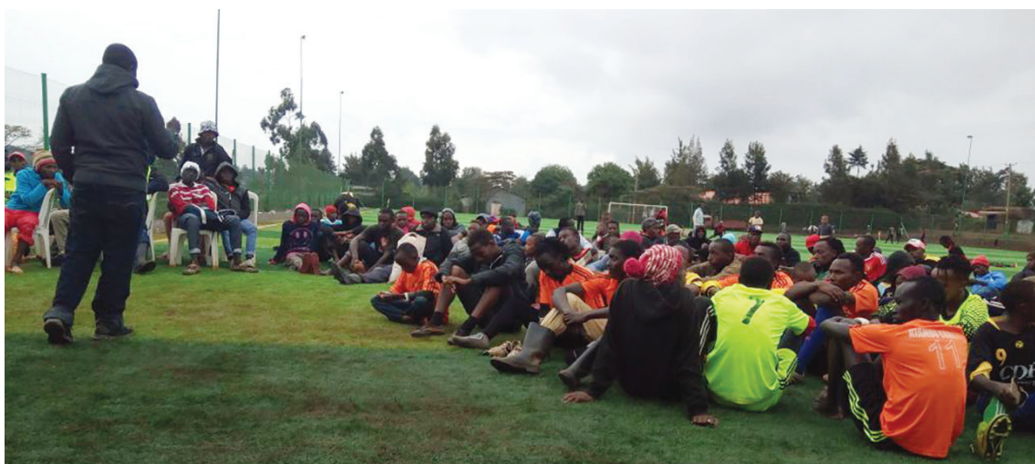
Football tournament & evangelism

By the grace of God we are looking ahead to a great harvest in the area.