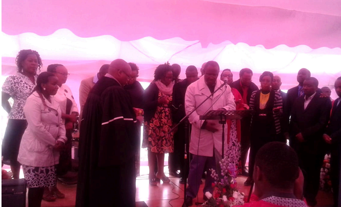
Praying for NBC Kikuyu leaders during 1st service