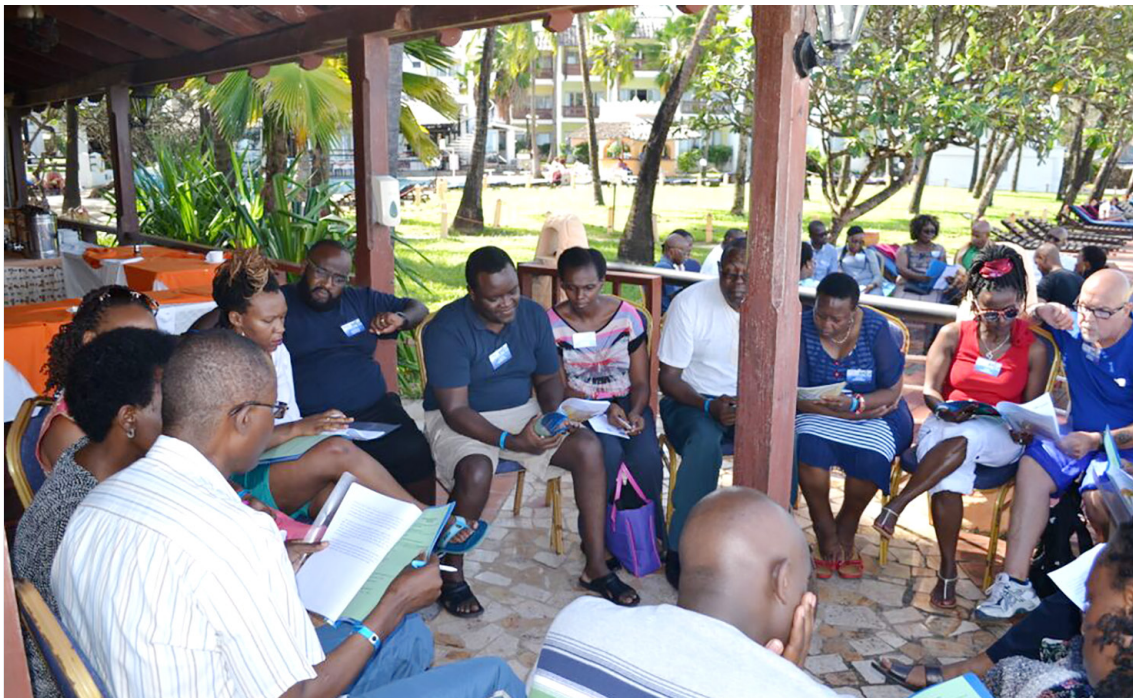
Enjoying a session at Marriage Enrichment Retreat