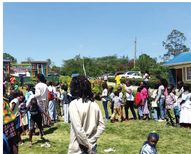
NBC Rongai Sunday School

The youth service has continued to experience steady growth and we thank the Lord for this. In the course of the year, a facility was refurbished to enable the youth to meet and they have risen to the occasion by taking responsibility for most of their meetings. Two youth concerts were held in the year which were successful. The youth have been empowered to lead the main service every fifth Sunday of the month. Through this initiative leadership talents are being developed among the youth.