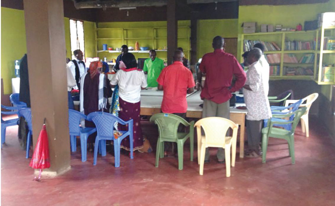
Pastors fellowship at the Mission Station