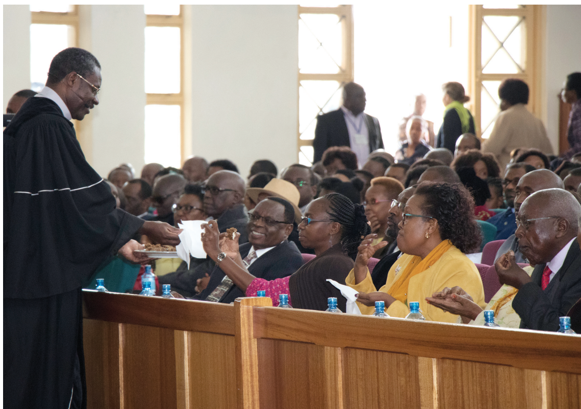
Senior Pastor serving 60th anniversary cake