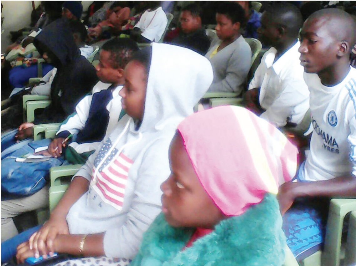
Bapo Scholars & Parents forum

The outreach ministry of NBC continues to be established. We are amazed by God's work in spurring the hearts of His people in the area of missions, who have come forward to participate in the various initiatives of NBC. We pray that as a church we shall be alert to promptly respond to God's direction when He leads.