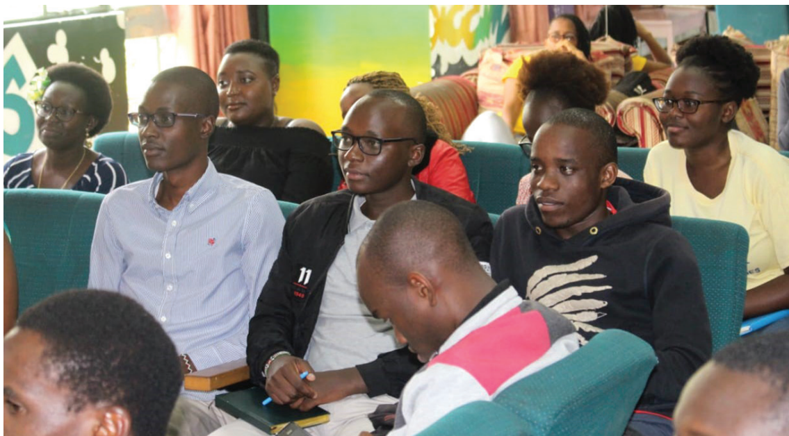
Youth-Forum for Medical School students

Like Paul in Romans who desired to see Christians in Rome strengthened for fruitful ministry, youth ministry main desire has also been to see youths equipped for ministry and become true disciples of Jesus Christ. To help accomplish this desire, the IMPACT (form four leavers) program has had a stronger emphasis on discipleship; 25 youths completed the six months program.