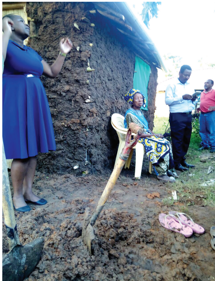
Dedication of Mama Fatuma House

We continue to actively engage in evangelism to persons of other faiths through sports, open debates and volunteer teaching in a training centre. We thank God for the opportunities and pray that as God enables us we will see more fruit of those who acknowledge Jesus Christ as Lord. The church has adopted one couple for training in Theology and one student in secondary school education. There is more that happens in this ministry that cannot be shared on a public platform.