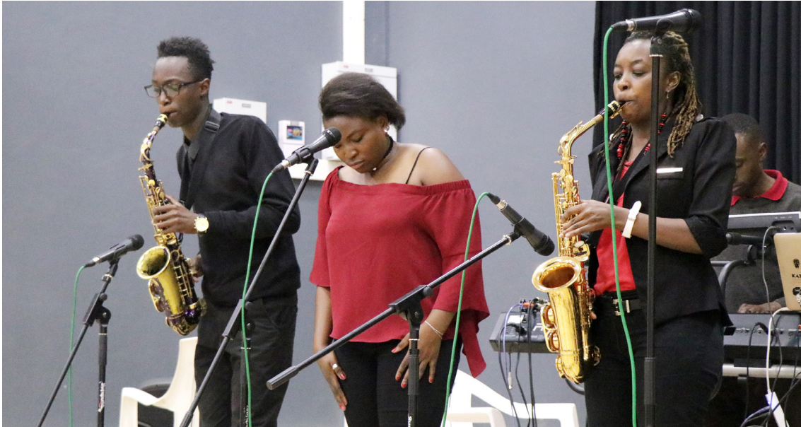
Young adults salsa night