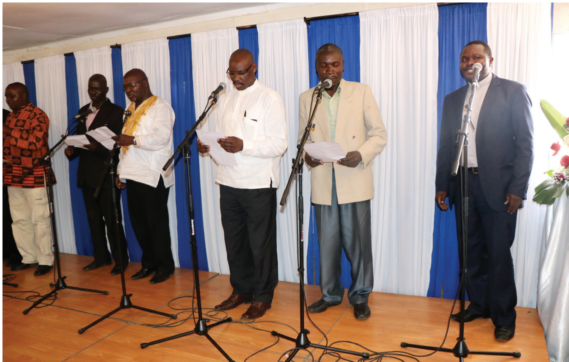
NBC Kibera Men's Team

The Church continues to experience growth through ministry of the Word, every week. The church has three services each week; a Children service, Family service and a Youth service. Worship through music continues to be vibrant. We also have a weekly prayer service every Thursday evening and monthly prayer keshas with an average of 150 in attendance and in which God has graced us with signs and wonders such as healing, for the Glory of His Name. We thank God for the 23 who have given their lives to the Lord in 2018 through the services.