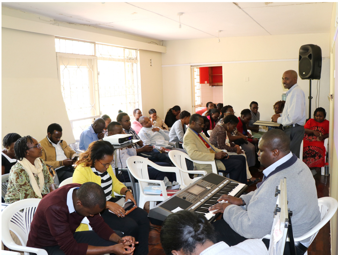
Staff devotion at Ngecha Rd

In line with the strategic plan's key priority area on 'streamlining our Governance and Management Structures', the human resource structure has been reviewed with the facilitation of a consultant. This resulted to reviewed job descriptions, evaluation of all positions, and a new salary and grading structure guided by a market survey that was conducted. The consultant will also develop a competency framework to enable management to recruit effectively and plan better for capacity building. The outcomes of this process will be implemented in phases between November 2018 and Mid-2019. In the coming year, we hope to review and improve on the performance management system of the church. We appreciate all staff members for their faithful service. God