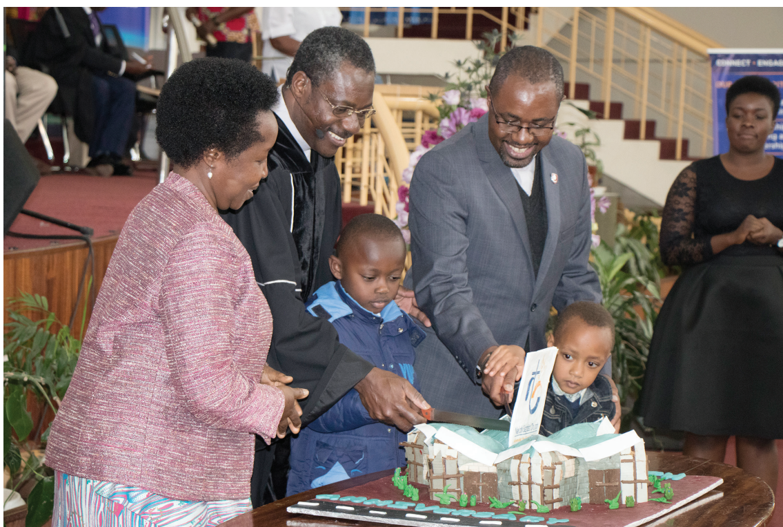
60th Anniversary cake cutting

God created us to worship Him and may our lives daily emulate this for His glory and honor! We continue to entrust ourselves to Him who is able to do exceedingly, abundantly above all we can ask or imagine.