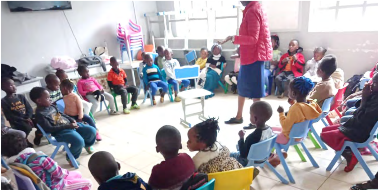
Sunday school class