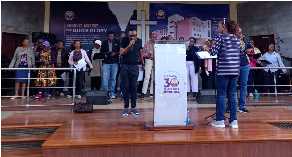
Taraji Choir practice at Kahawa Sukari Baptist Church