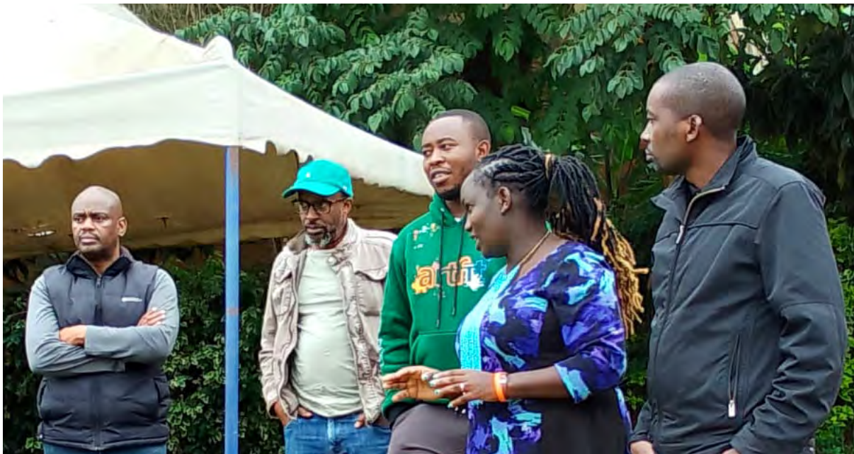
Development Committee visiting NBC Ongata Rongai