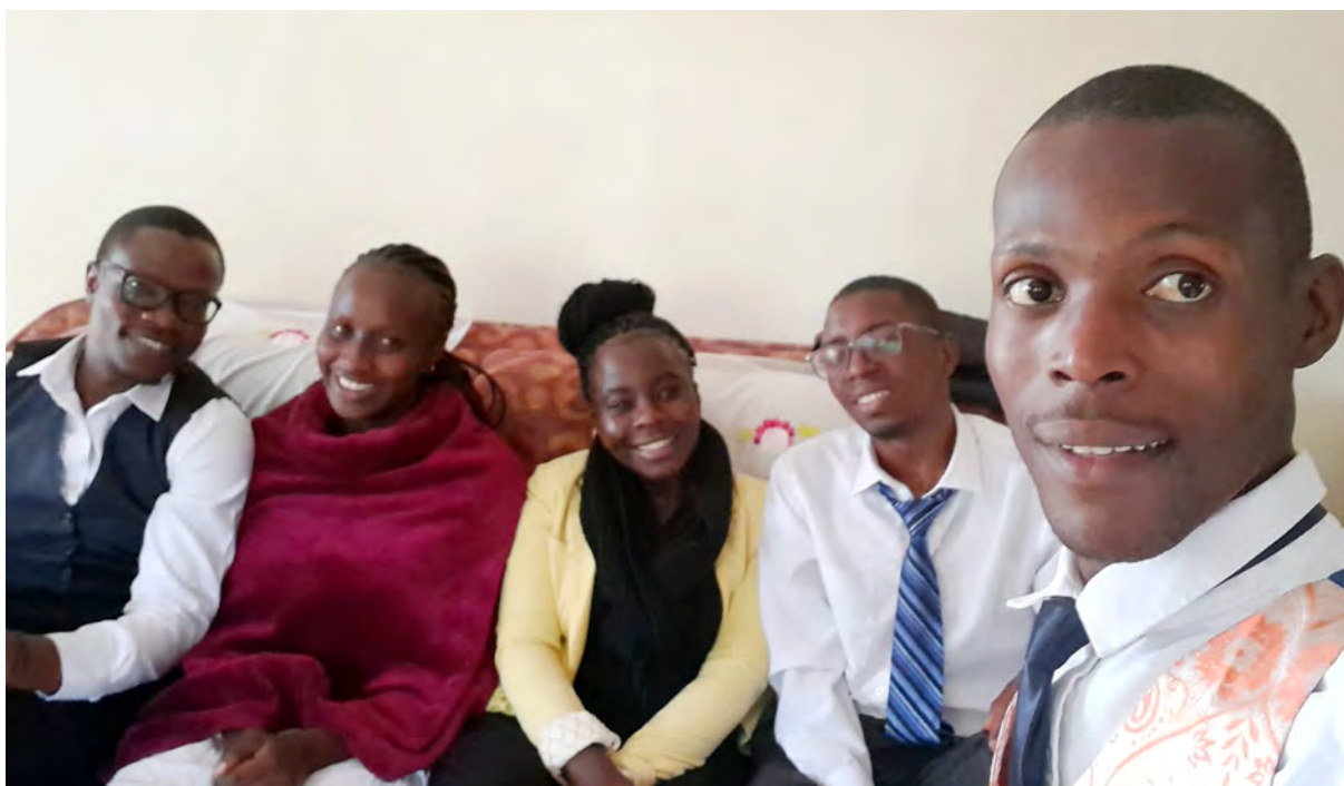
Young adults missionaries in Uganda

The youth and young adults continued their Bible studies and active involvement in the Sunday service. Seven (7) young adults joined a 'Growing in discipleship' group on Sundays using the Navigators' material. The IMPACT (ex-high school) program took place in quarter one of the year, with eight (8) participants who were trained in Christian living and participated in outreach and other ministry engagements. In September, six young adults attended an annual youth camp, in Uganda, organized by the Luweero Community Pastors Fellowship.