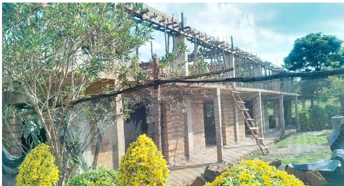
Sunday School classroom project

We pray for God's providence to complete the Sunday school building.