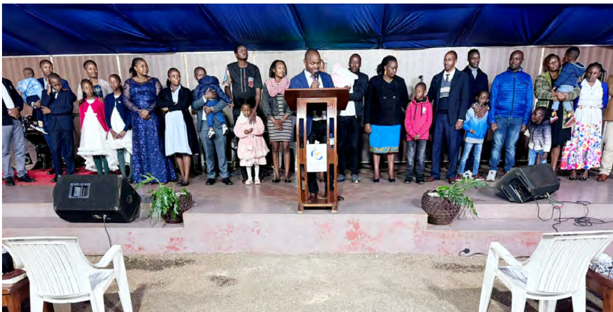
Child dedication service