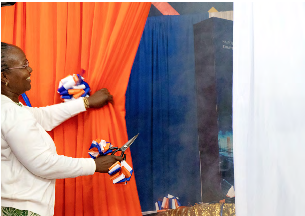
Launch of strategic plan at NBC Ngong Road