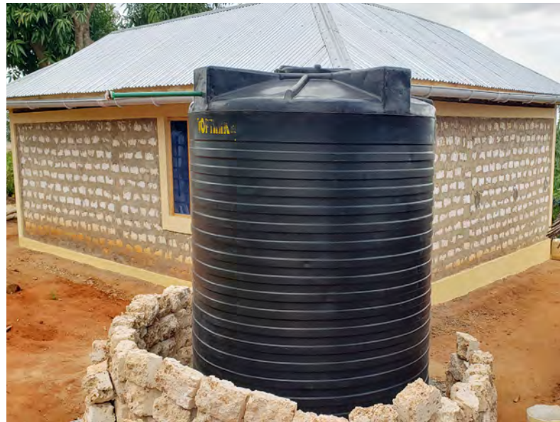
Community Engagement in Kwale by Church Trustees