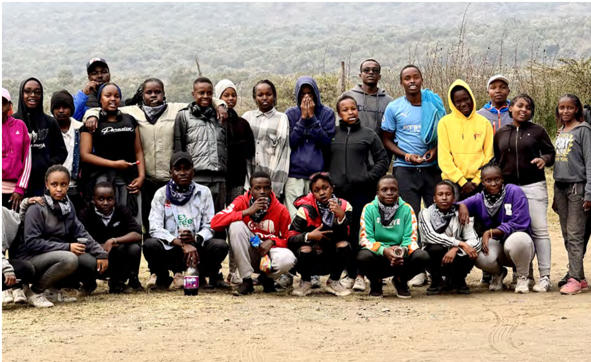
Teens hike to Mt. Longonot