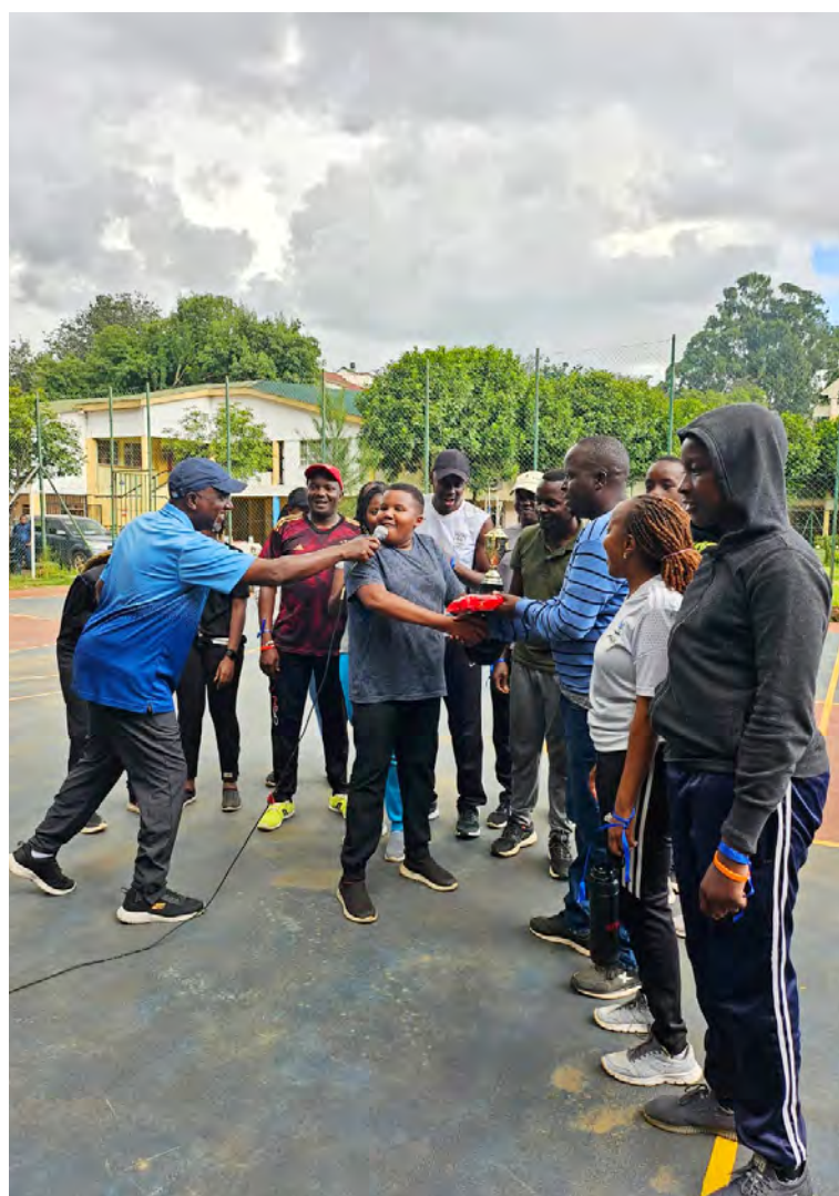
ROPES Day out

ii. Holiday Bible Clubs: We are grateful for partnership with youth ministry. The presence of the children's big brothers and sisters is inspiring for them. In April, the HBC was on "Unstoppable God" and an average of two hundred (200) children attended, while in August, the HBC was on "Built for a Purpose." In addition to Bible lessons, an average of four hundred and seventeen (417) children who attended displayed skills in music, dance, crocheting, artwork and science.