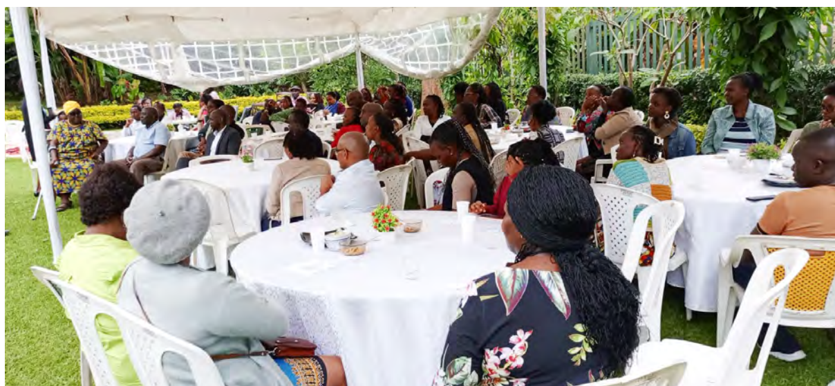
Children's ministry co-workers luncheon