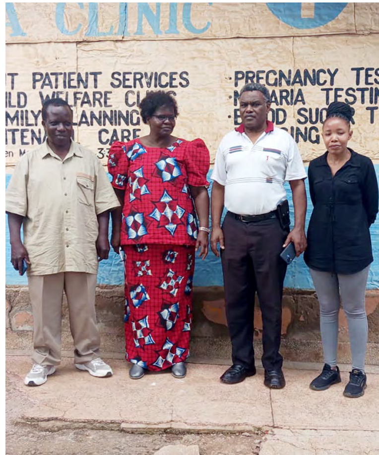
Trustees visit to Chemi Chemi Clinic

Our God is high and lifted up! To Him be praise, glory and honor.