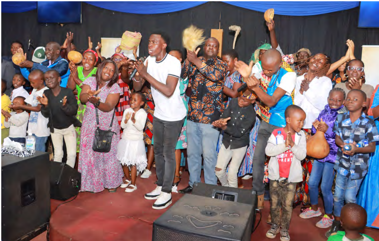
Cultural Sunday 2024