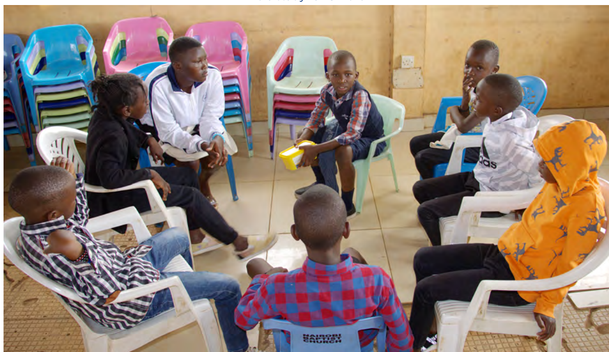
Bible study for Children

Continue to meet monthly in members' homes to open and discuss the word of God at a deeper level.