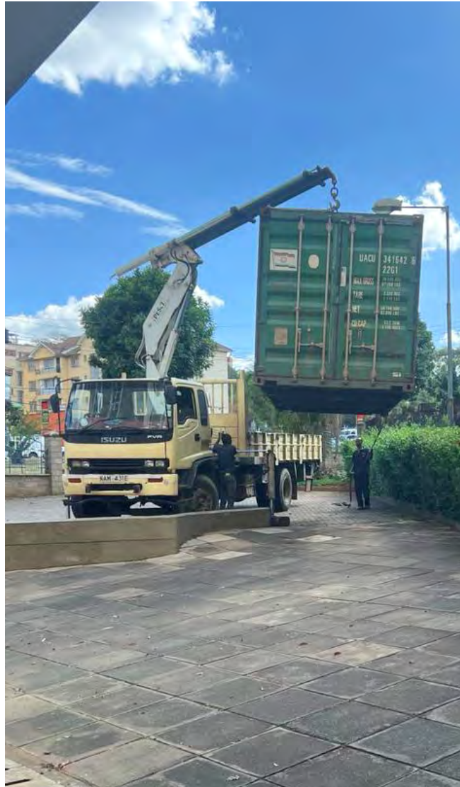
Arrival of storage container