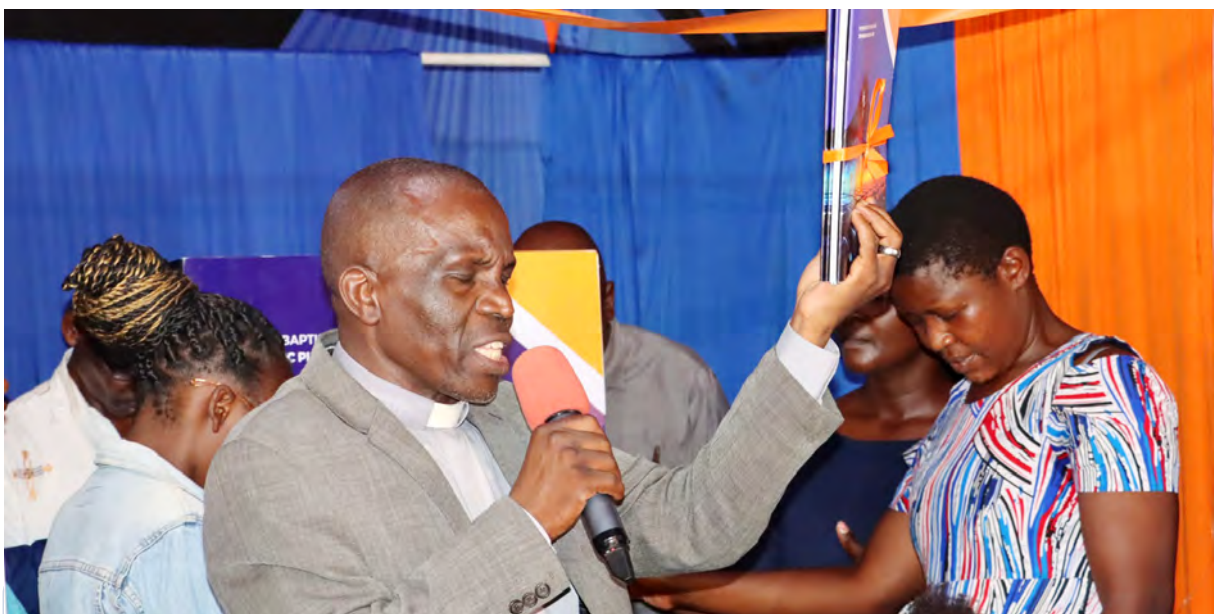
Lead Pastor praying for new strategic plan

We are praying for a lasting solution to our challenge of space especially for the Sunday school. We invite NBC members to pray with us.