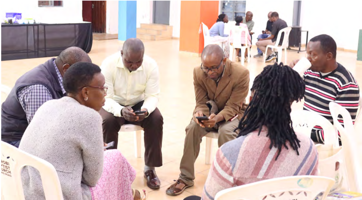
All leaders meeting