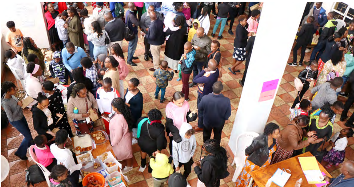
ROPES class entrepreneurship sunday