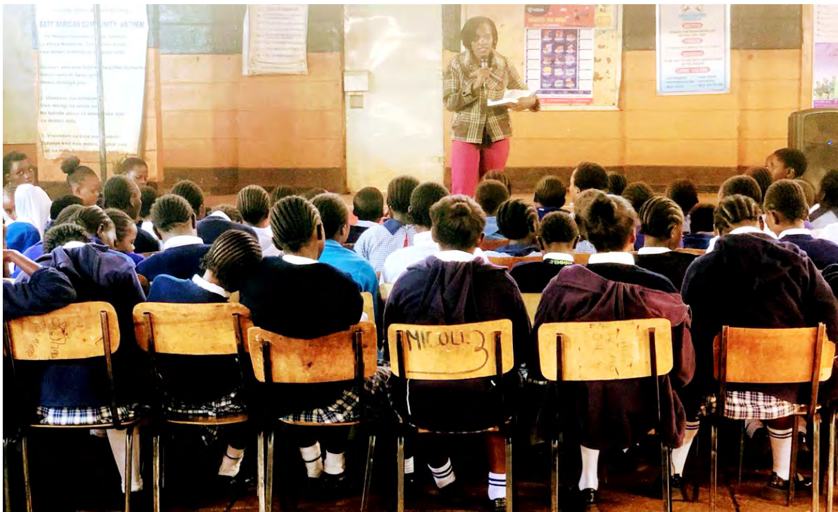
Adopt-a-child girls' session

We have continued our partnership with Farasi Lane Primary and Secondary Schools where the assembly is involved in Program for Pastoral Instruction (PPI). In addition, Adopt a Child Campaign takes place within the primary school where we minister and provide support through dignity packs, boxers for the boys, and mentorship programs. This initiative has impacted approximately 210 students in total and has also been instrumental by offering vital support to the pupils. Meetings take place every second Tuesday of the month when the school is in session. In all our efforts, we are reminded of the words of Jesus: "Let your light shine before others, that they may see your good deeds and glorify your Father in heaven" (Matthew 5:16).