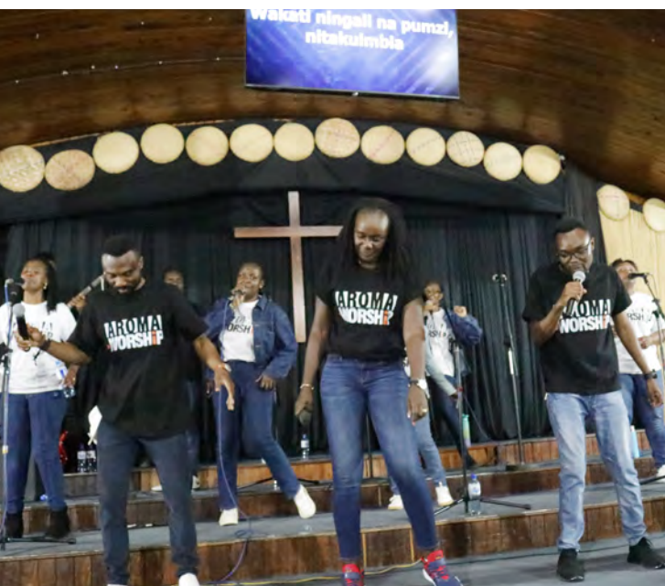
'Aroma' worship experience