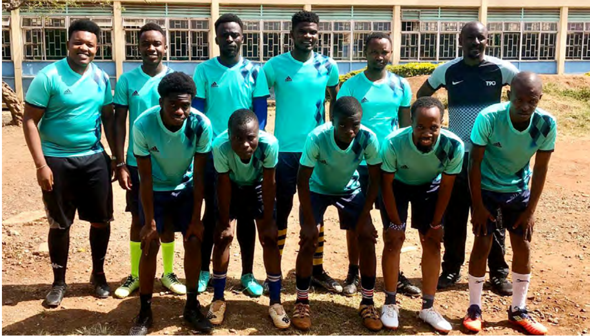
NBC Westlands football team