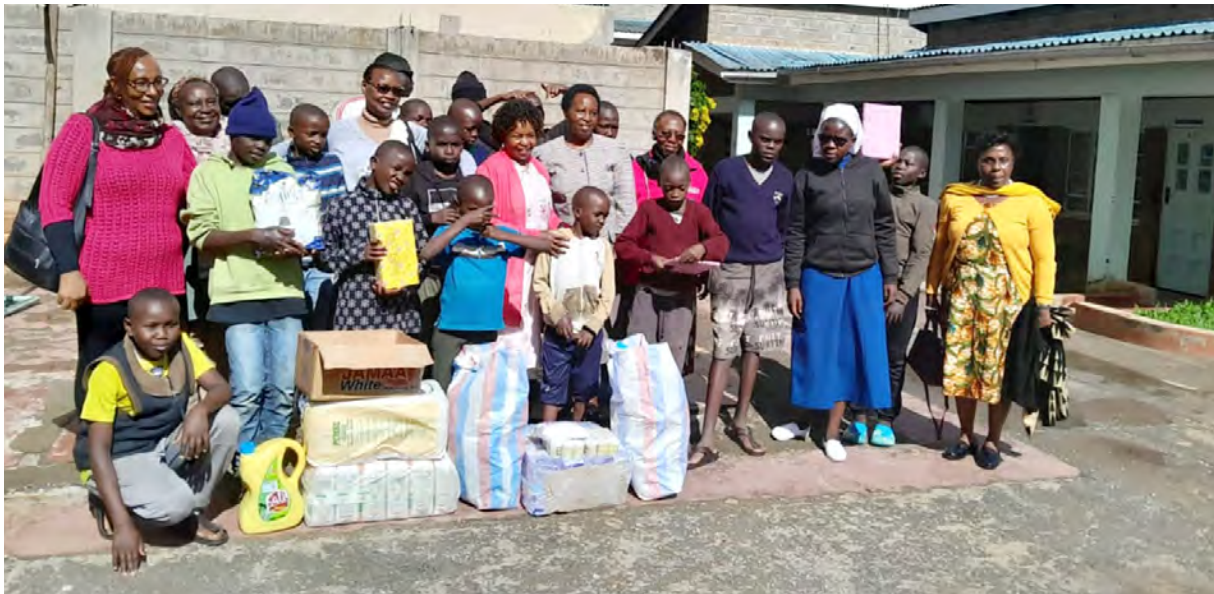
Outreach by Golf course HGF (Nov.2023)