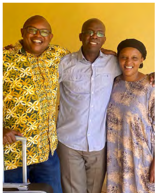
Pastoral visit 2024

Follow the monthly newsletter for regular updates on the mission activities.