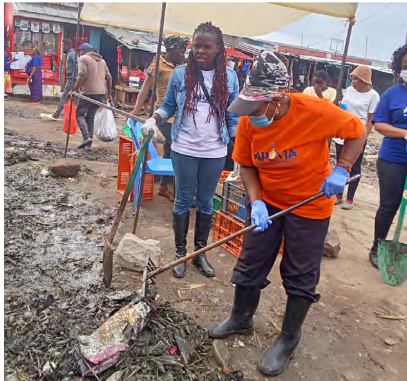
Community clean-up day

The Assembly couples held a dinner in February attended by thirty-six (36) couples whose marriages were enriched. The children, youth, Angaza Ladies, and Men of Valour enjoyed fellowship every last Sunday of the month during our Pamoja Sunday. In addition, the Angaza Ladies held a successful breakfast meeting with over thirty (30) women. The Men of Valour continued their monthly breakfast fellowships. During a special breakfast on 10th October, men's fellowship hosted the youth football team. This answered a long-standing prayer of the men, to begin mentorship relationships with the youth. Out of this interaction, twelve (12) mentorship groups were formed with a minimum of four (4) persons each, comprising a mix of older men, young adults and youth.