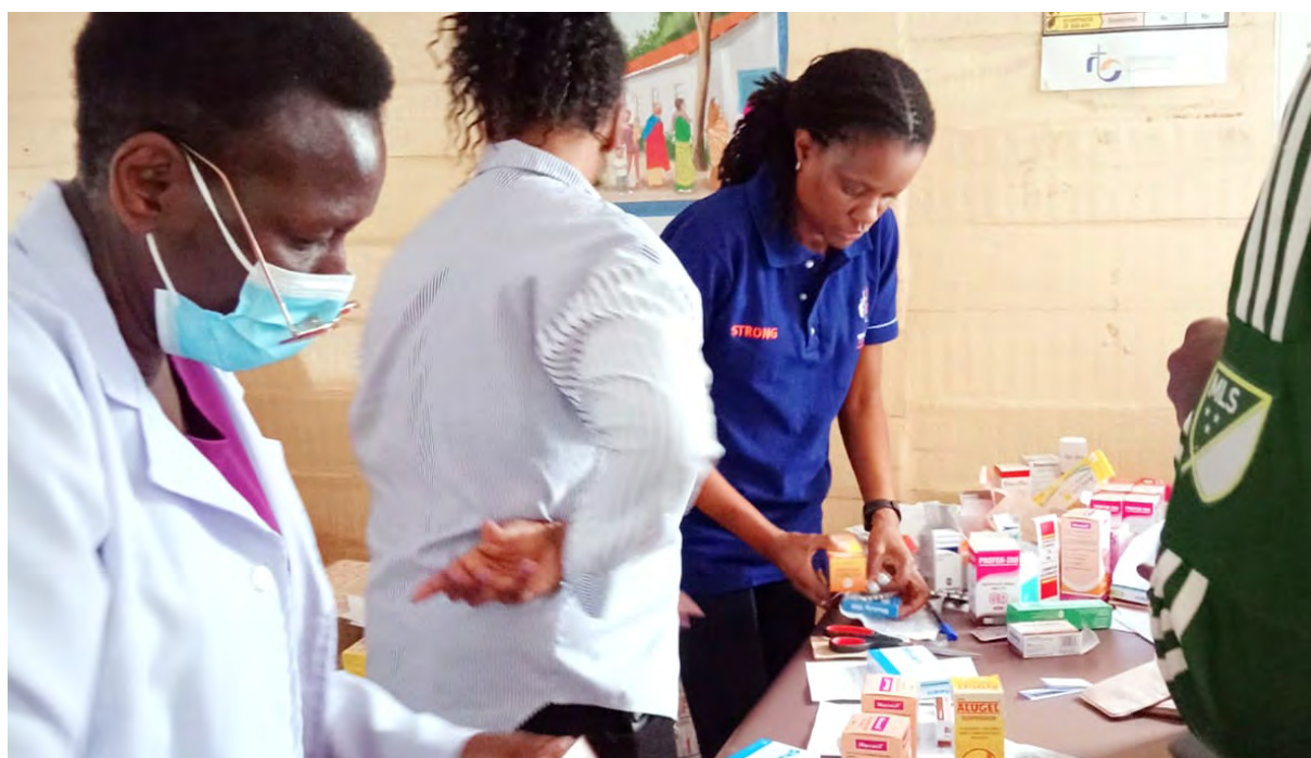
Dispensing medicine during Chemi Chemi medical camp