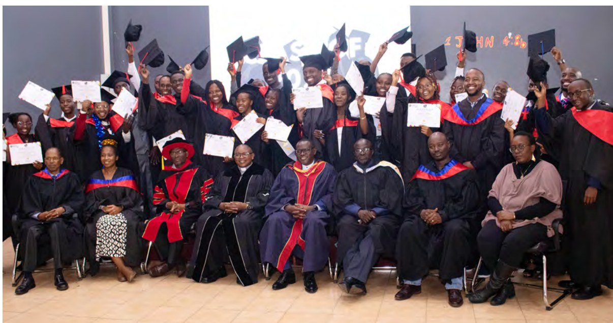
Sauti School graduation

c. Sauti Master Classes: The Media ministry has been able to run two master classes in August covering Video production & Content Creation and in October covering Audio Production and Sound management with participants being from NBC assemblies and neighbouring churches.