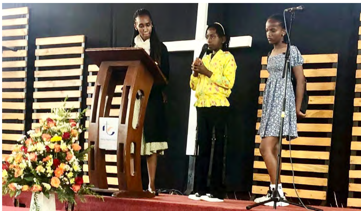
Child led service