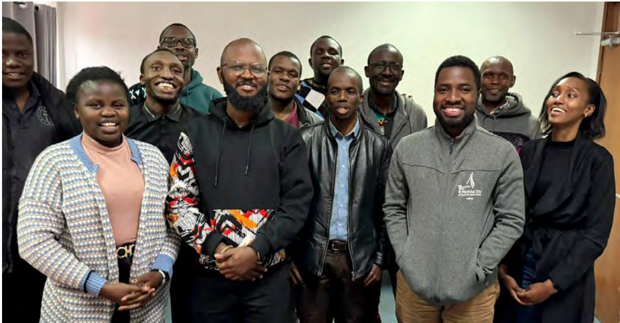
Trainee's training session