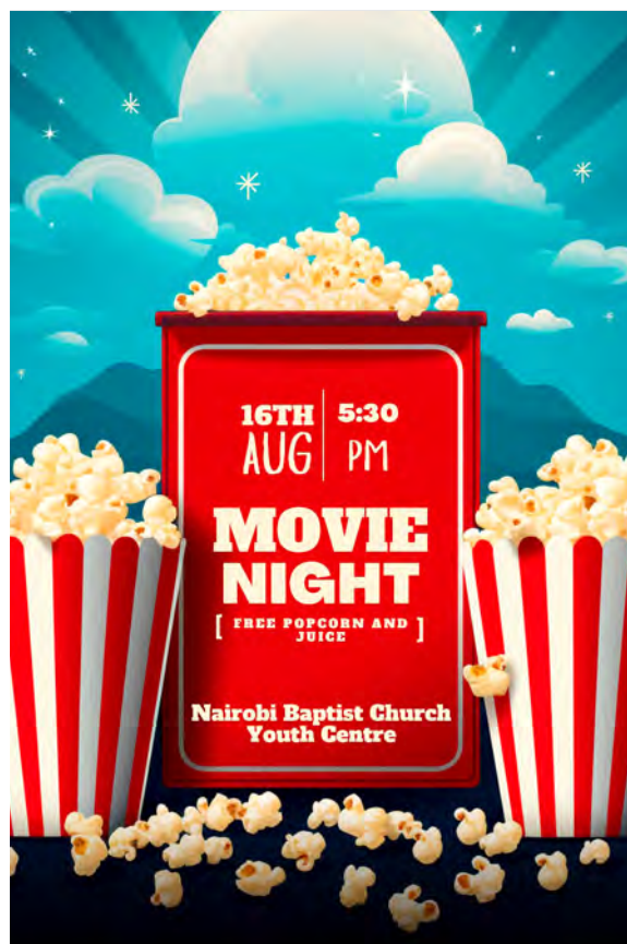
Youth Movie night Invitation

vi. Youth Outreach: There have been several outreach initiatives. Key to note was street evangelism with food distribution which the youth cooked and distributed as they shared the gospel. The gospel was also shared during a youth movie night. We thank God for this opportunity to be the aroma of Christ.