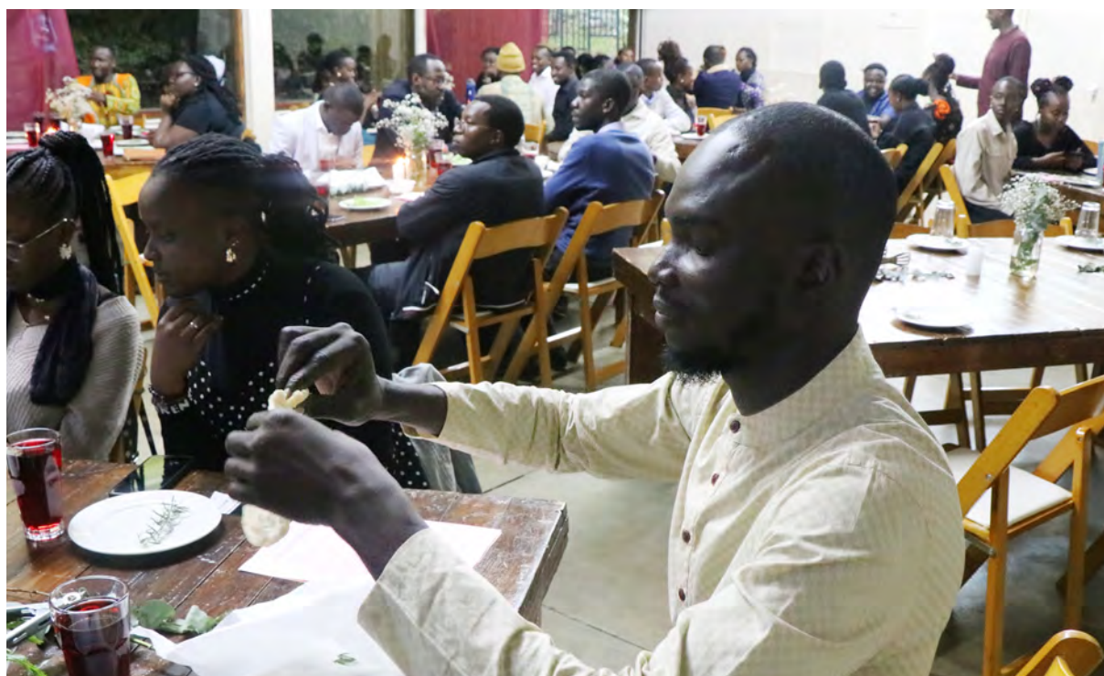
Young adults dinner