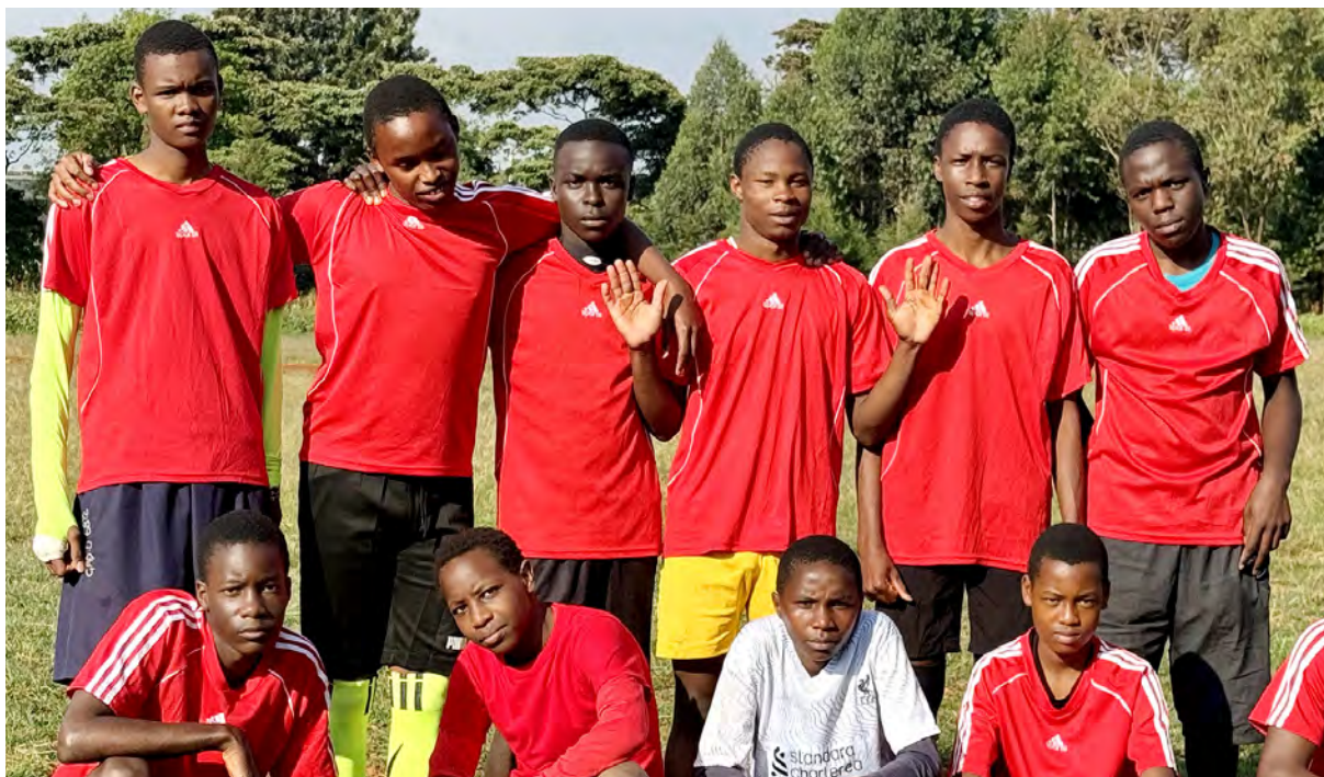
Teens football team