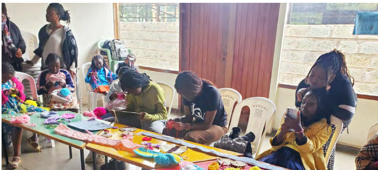
HBC talent displays