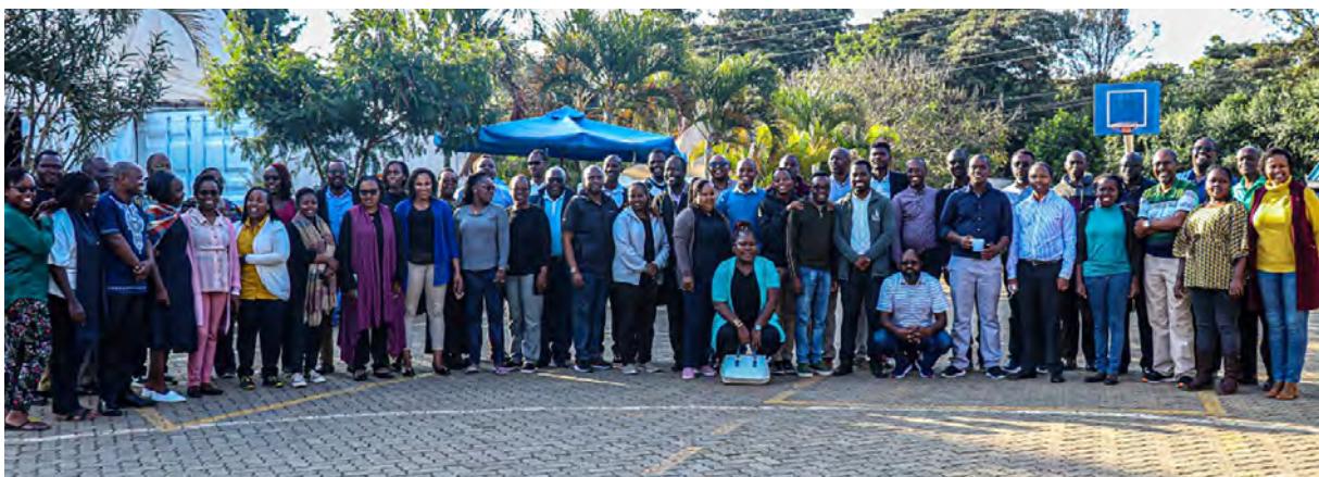
Staff after a planning meeting

c. The Procurement, ICT and Support Services functions continue to support ministry in all assemblies, to the glory of God.