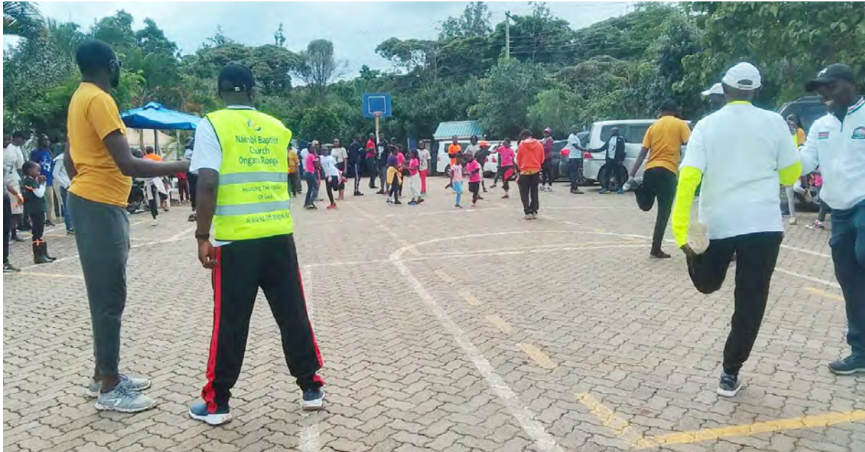
Warm up before fundraising walk