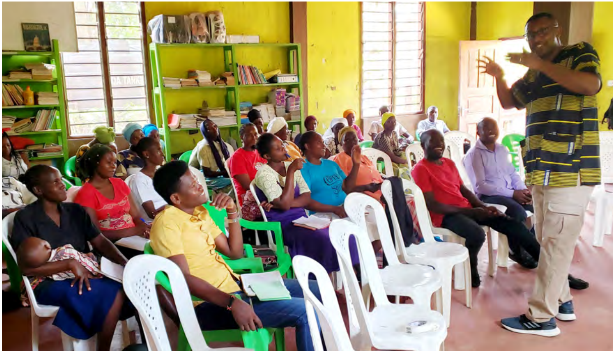
Children ministry co-workers training