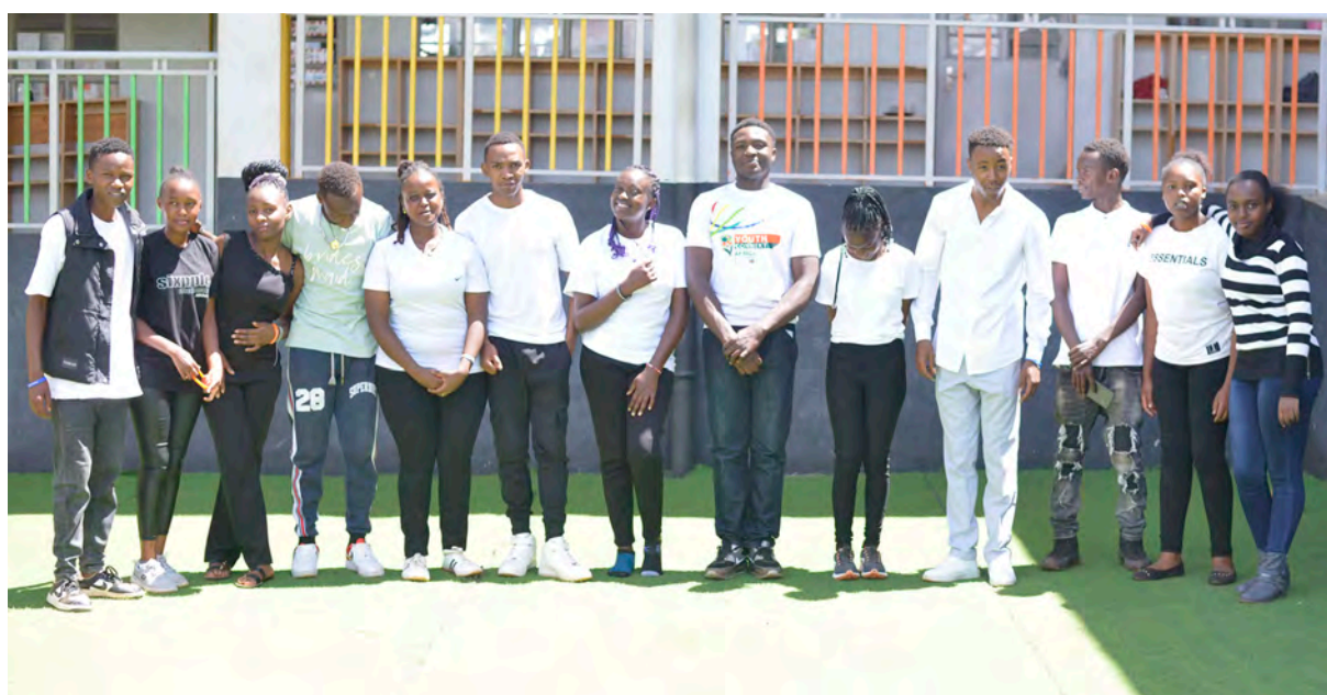
Transformers (Ex-candidates) program

Our teens' classes are conducted every Sunday during school holidays where they are taught God's word. About forty (40) teens were actively and consistently involved during Teens' Week held in April and August. We have contact with about 100 teenagers from the church's neighborhood who are not regular congregants, but we minister to them in partnership with YoungLife Kenya.