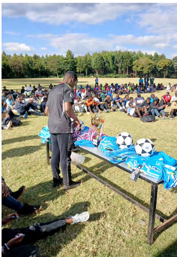
Award ceremony Inter-Assembly football