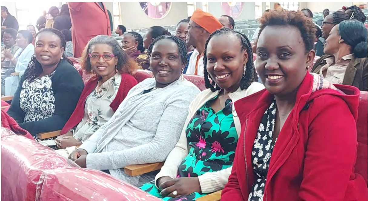
Some of 3i8 graduands

The people at the center were all boys of 7 to 24 years of age with most having been taken from the streets and given a solid life reformation and foundation at the centre. We played games with them, donated 2 sacks of clothes, got to hear their life experiences, but most importantly, we shared the Word of God and had 31 of them give their lives to Christ. It was a wonderful experience that we would not like to end there but form a relationship with the Centre in supplying them with their spiritual needs as they grow in Christ, and if possible, their physical needs.