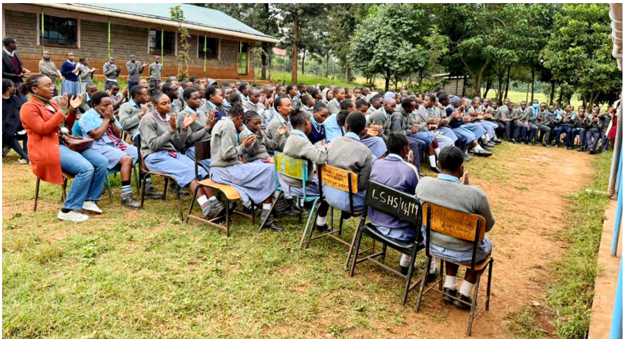
High school outreach