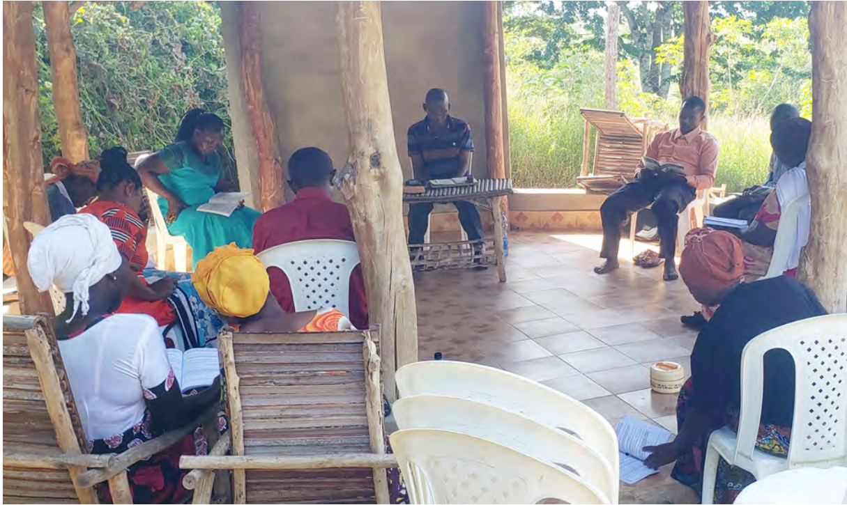
Theological Education by Extension (TEE) for Kwale Pastors

As we reflect on the close of 2024, the Global Missions and Outreach Ministry stands in awe of God's faithfulness and provision. He has continually done immeasurably more than we could have asked or imagined.