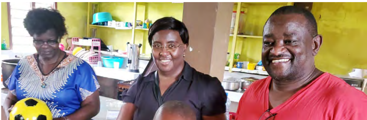
Trustees in Kwale

Under the three commitments, NBC ensures to intentionally seek God's direction through prayer, emphasize and grow member engagement in NBC ministries, small groups and fellowships, intentionally deploy and optimize all resources for ministries and intentionally identify and meet assembly specific development needs.