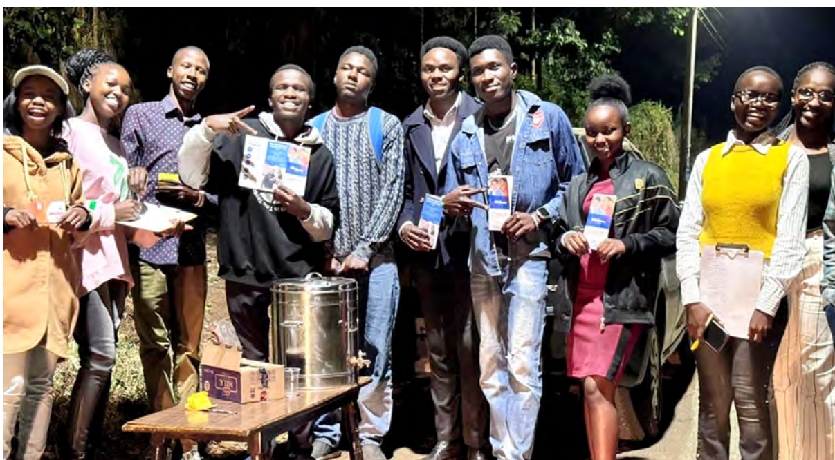
Coffee run evangelism by 3i8 students group