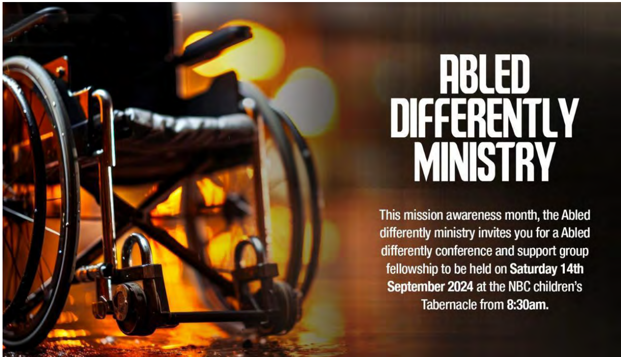
Conference invite for Abled-Differently and caregivers

In August this year, we had a successful retreat for the individual missionaries that aimed to refresh and refocus the team towards the urgency of missions