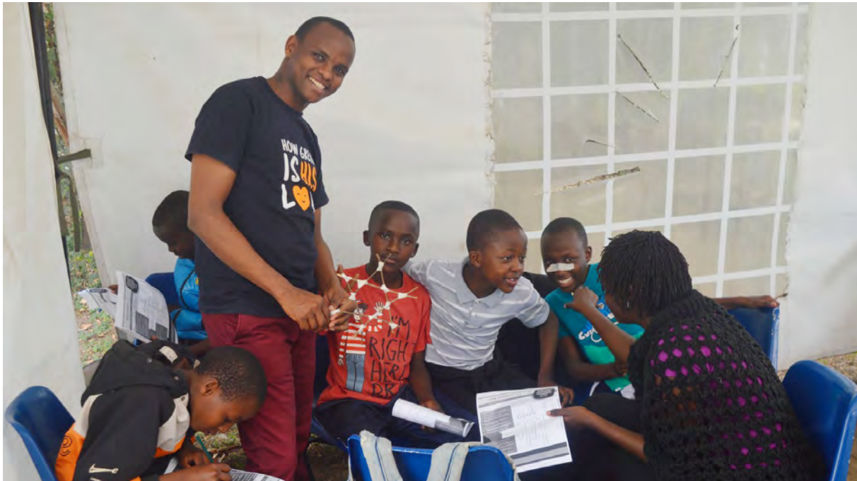
Holiday Bible Club class