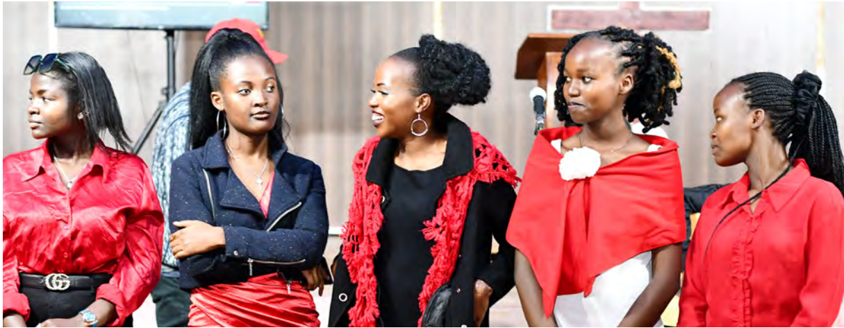
Colleger's Valentine dinner