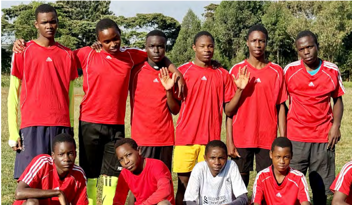
Teens football team