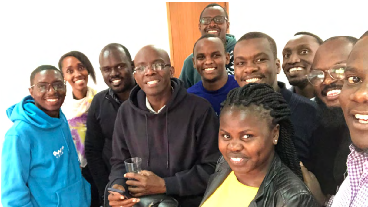
Trainees after Academy session on cross-cultural missions