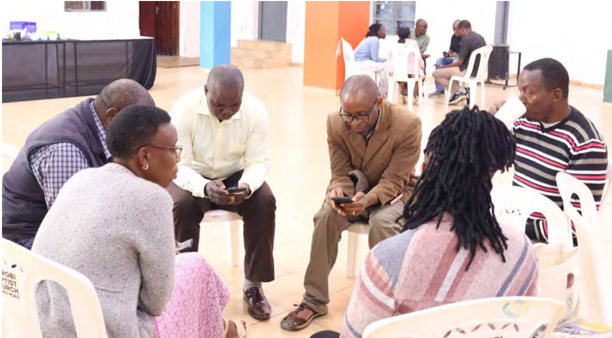
All leaders meeting