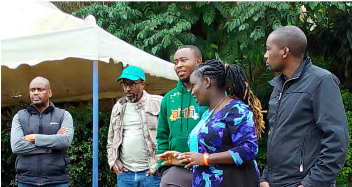
Development Committee visiting NBC Ongata Rongai