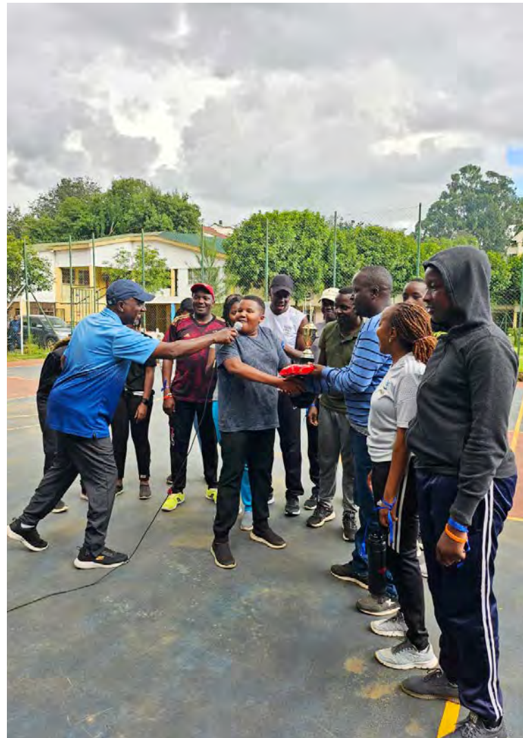
ROPES Day out

ii. Holiday Bible Clubs: We are grateful for partnership with youth ministry. The presence of the children's big brothers and sisters is inspiring for them. In April, the HBC was on "Unstoppable God" and an average of two hundred (200) children attended, while in August, the HBC was on "Built for a Purpose." In addition to Bible lessons, an average of four hundred and seventeen (417) children who attended displayed skills in music, dance, crocheting, artwork and science.