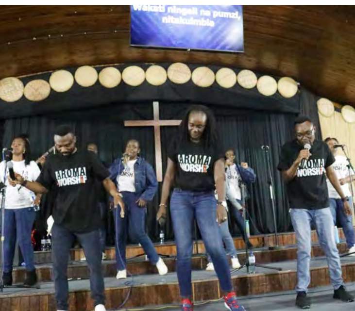
'Aroma' worship experience

ii. On 10th May we had ONE worship concert, with the Bethel Sanctuary full of people coming to magnify the Lord. The prayer service music team also led a worship experience during one of the Thursday services dubbed “Aroma of worship”. We also introduced regular worship experience sessions, every last Friday of the month starting in September. All these worship experiences were very well received.