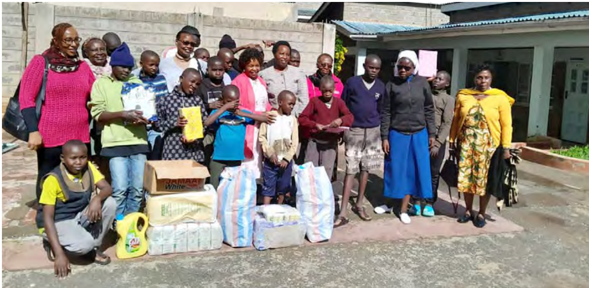
Outreach by Golf course HGF (Nov.2023)

vi. Marriage Enrichment Ministry: The Ministry held their Couples Fun Day Out where thirty-three (33) couples attended the event at the Ngong Forest Sanctuary. Their second activity was a retreat with eighty-six (86) in attendance with the topic 'How to navigate marriage during time of difficulties.'