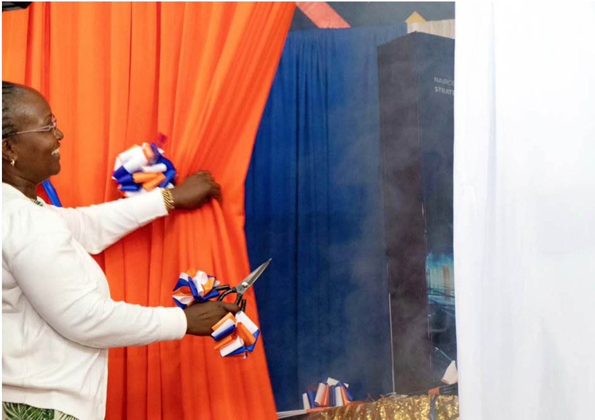
Launch of strategic plan at NBC Ngong Road