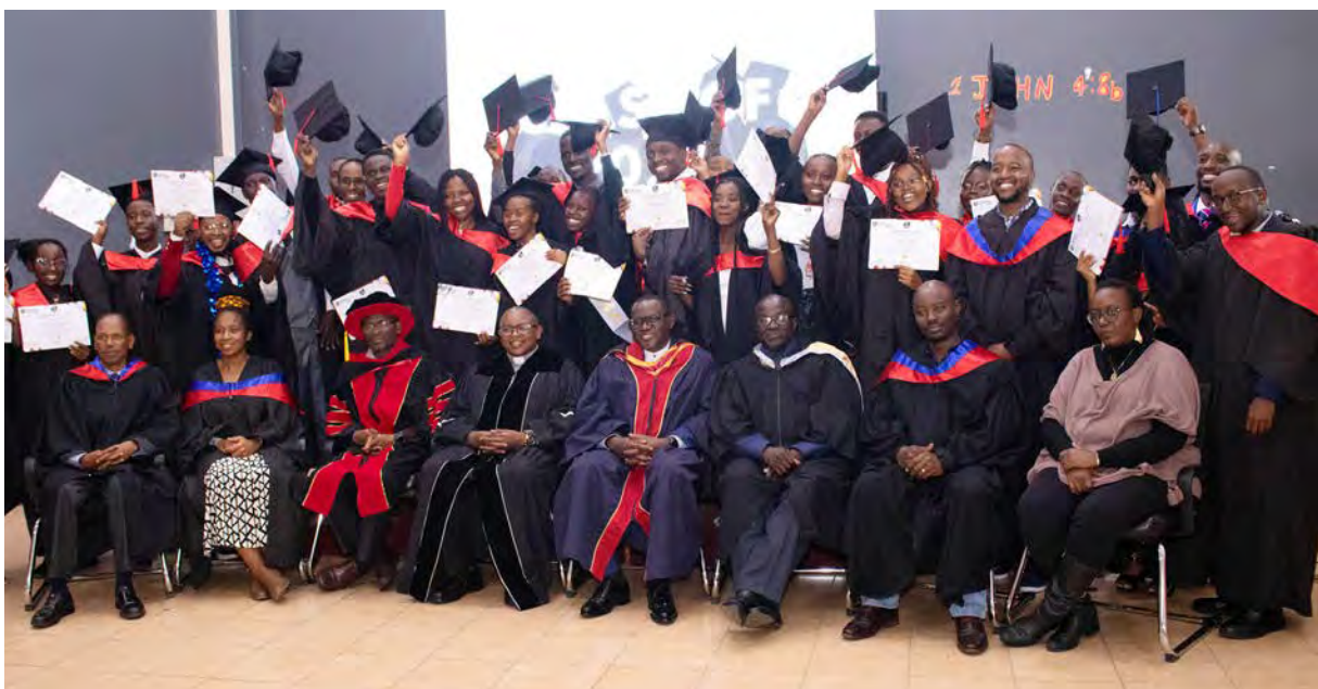
Sauti School graduation

c. Sauti Master Classes: The Media ministry has been able to run two master classes in August covering Video production & Content Creation and in October covering Audio Production and Sound management with participants being from NBC assemblies and neighbouring churches.