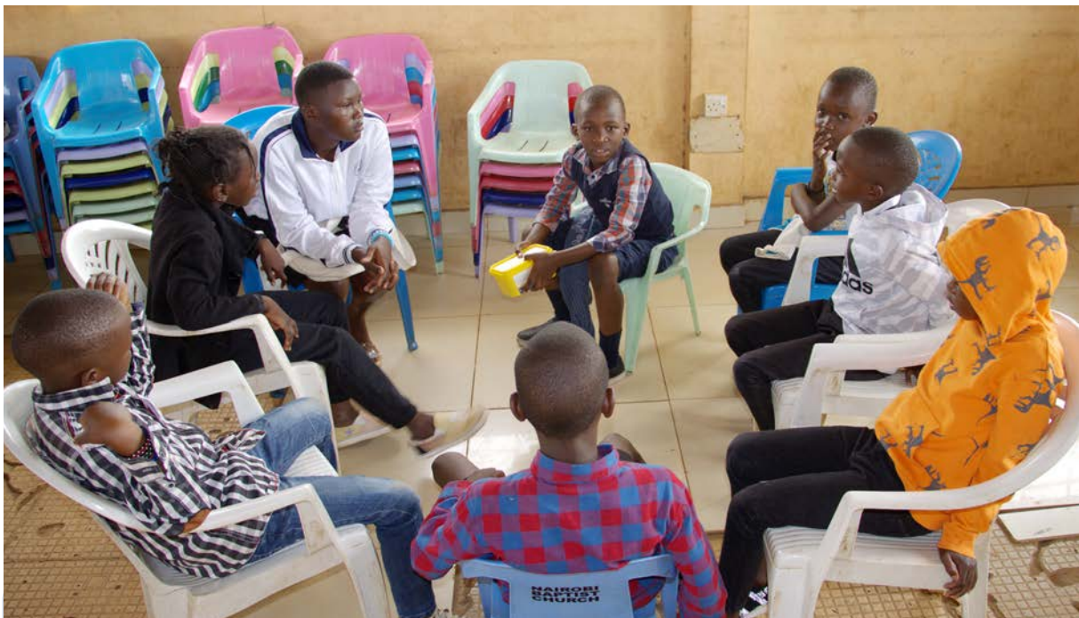
Bible study for Children

Continue to meet monthly in members' homes to open and discuss the word of God at a deeper level.