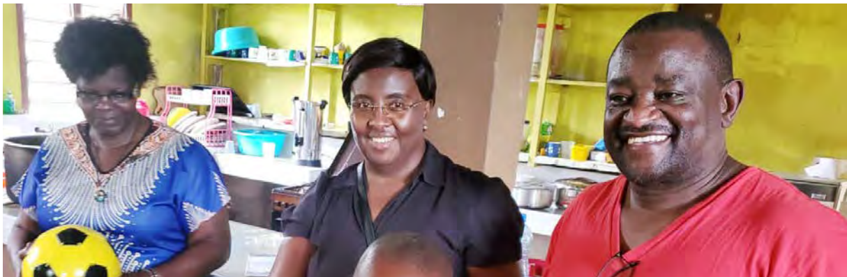
Trustees in Kwale

Under the three commitments, NBC ensures to intentionally seek God's direction through prayer, emphasize and grow member engagement in NBC ministries, small groups and fellowships, intentionally deploy and optimize all resources for ministries and intentionally identify and meet assembly specific development needs.