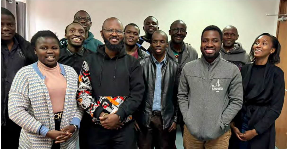
Trainee's training session