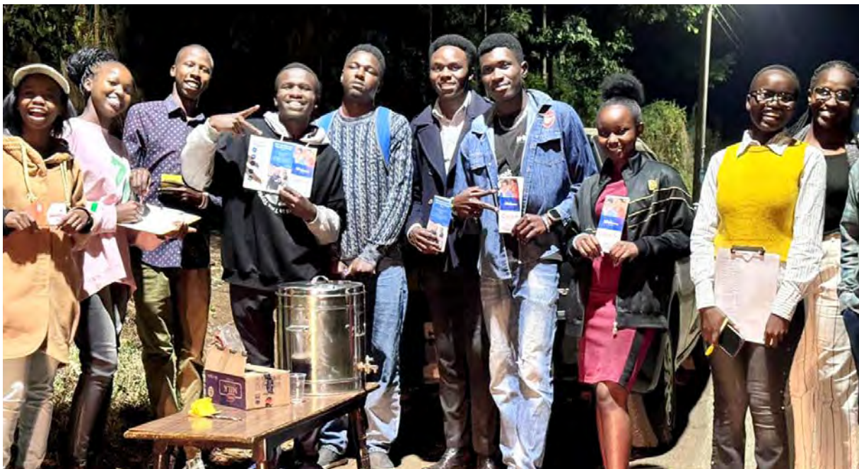
Coffee run evangelism by 3i8 students group