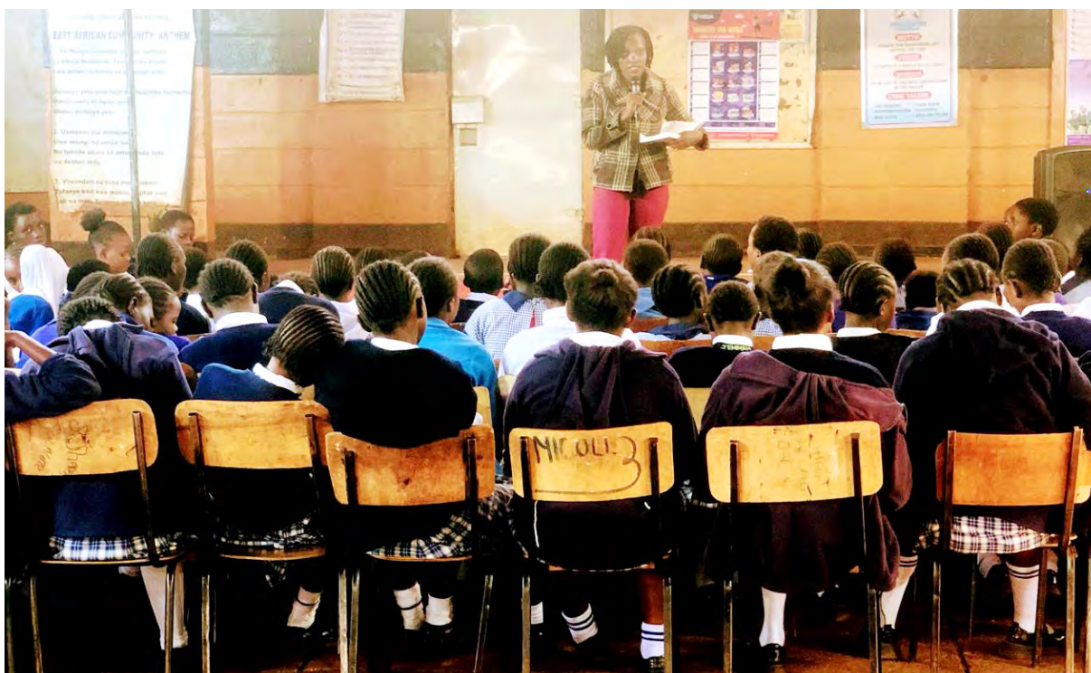
Adopt-a-child girls’ session

We have continued our partnership with Farasi Lane Primary and Secondary Schools where the assembly is involved in Program for Pastoral Instruction (PPI). In addition, Adopt a Child Campaign takes place within the primary school where we minister and provide support through dignity packs, boxers for the boys, and mentorship programs. This initiative has impacted approximately 210 students in total and has also been instrumental by offering vital support to the pupils. Meetings take place every second Tuesday of the month when the school is in session. In all our efforts, we are reminded of the words of Jesus: “Let your light shine before others, that they may see your good deeds and glorify your Father in heaven” (Matthew 5:16).