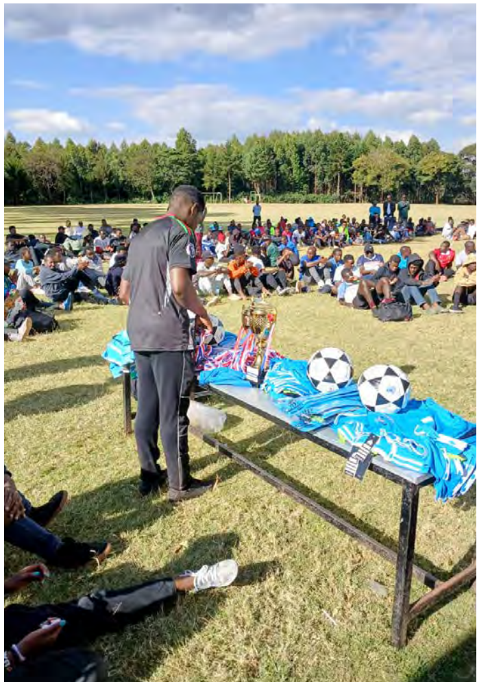
Award ceremony Inter-Assembly football