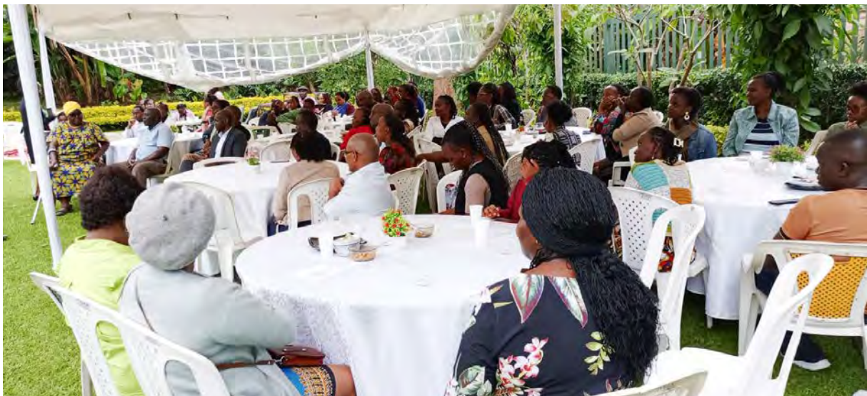
Children's ministry co-workers luncheon