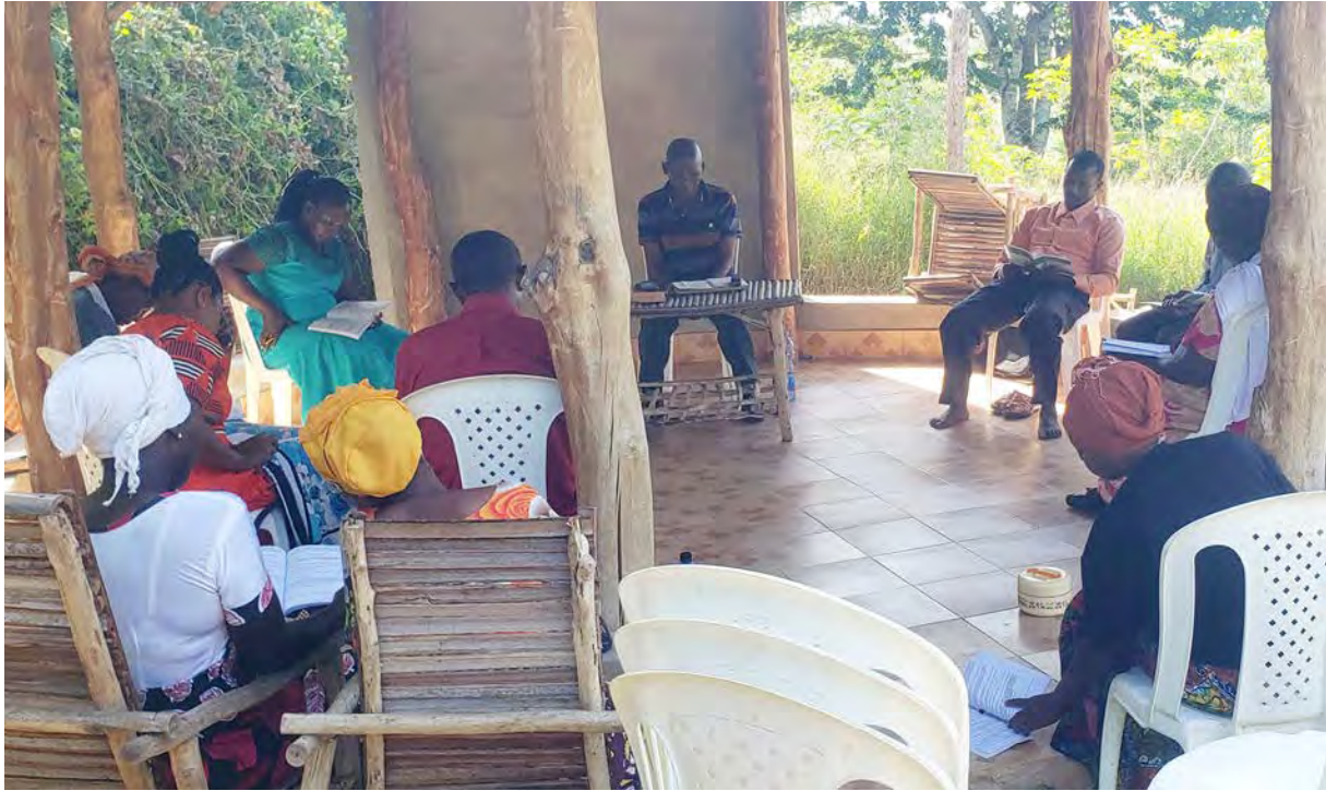
Theological Education by Extension (TEE) for Kwale Pastors

As we reflect on the close of 2024, the Global Missions and Outreach Ministry stands in awe of God's faithfulness and provision. He has continually done immeasurably more than we could have asked or imagined.