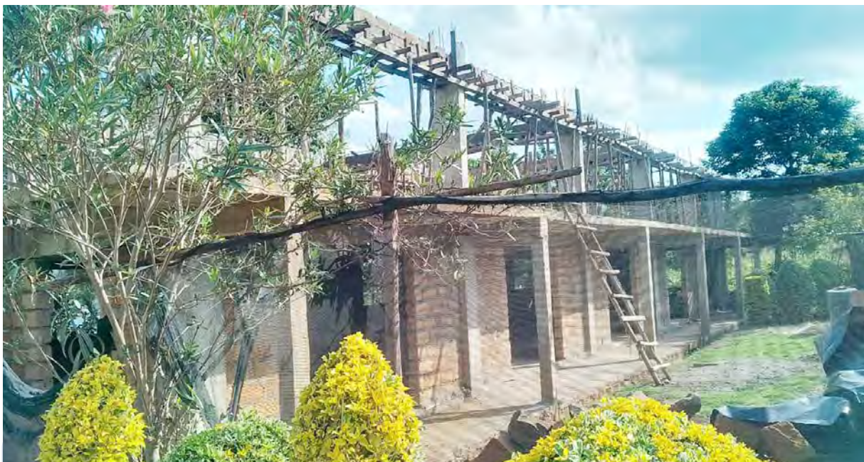
Sunday School classroom project

We pray for God's providence to complete the Sunday school building.