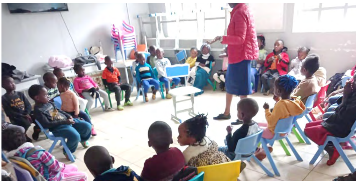
Sunday school class