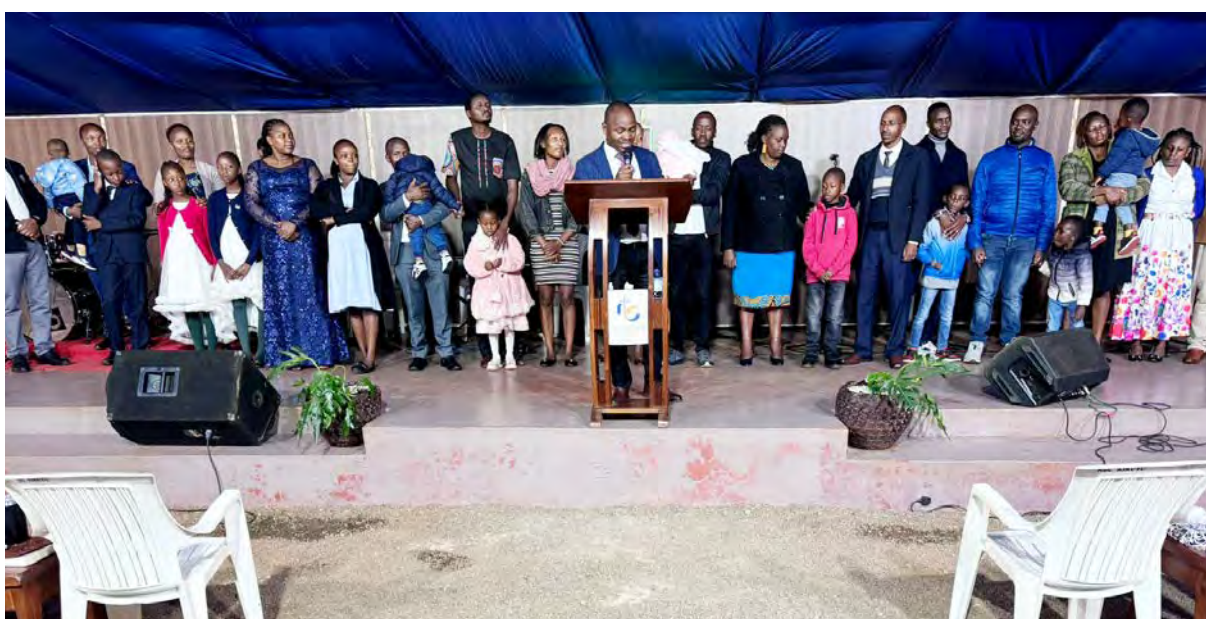
Child dedication service