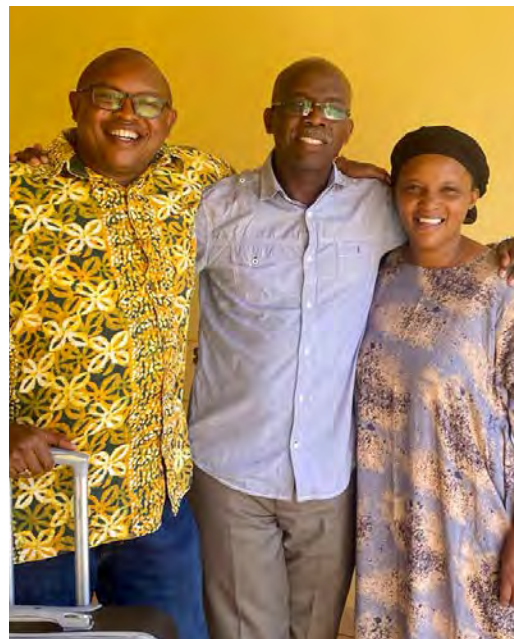
Pastoral visit 2024

Follow the monthly newsletter for regular updates on the mission activities.