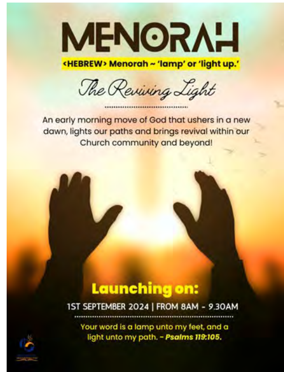
Menorah (8:00am) Service invitation