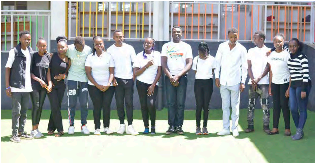
Transformers (Ex-candidates) program

Our teens' classes are conducted every Sunday during school holidays where they are taught God's word. About forty (40) teens were actively and consistently involved during Teens' Week held in April and August. We have contact with about 100 teenagers from the church's neighborhood who are not regular congregants, but we minister to them in partnership with YoungLife Kenya.