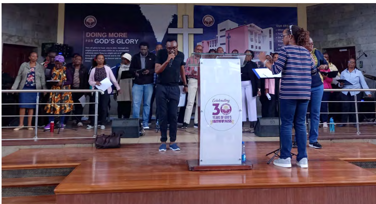
Taraji Choir practice at Kahawa Sukari Baptist Church

i. We thank God for the music and drama ministries and extend a warm welcome to those who joined this year. A highlight was the revival of drama ministry which had become dormant since COVID. In April the Music and drama ministries presented a powerful Easter Cantata.