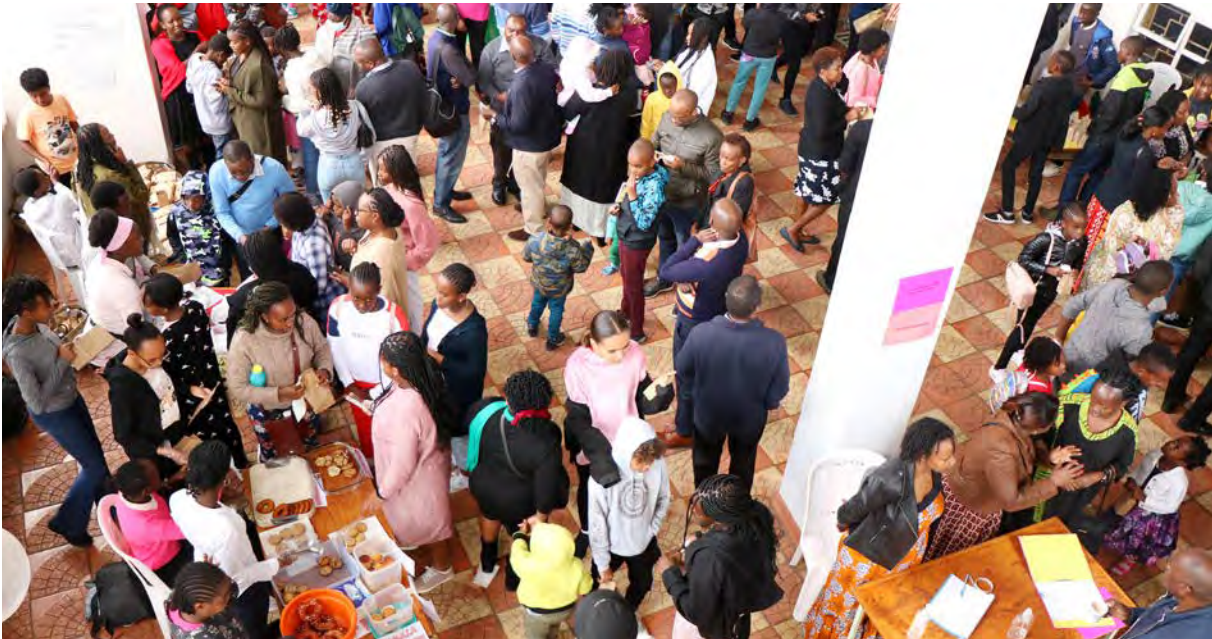
ROPES class entrepreneurship sunday