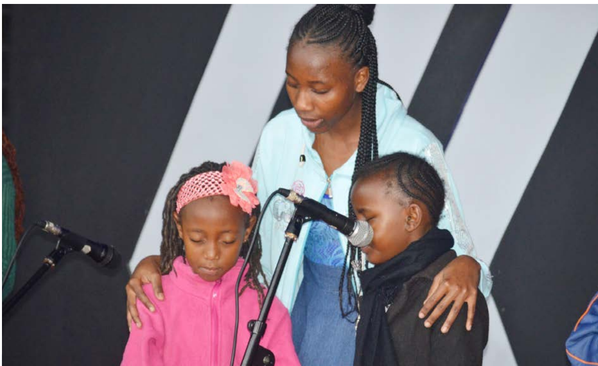
Children leading prayer during Sunday service