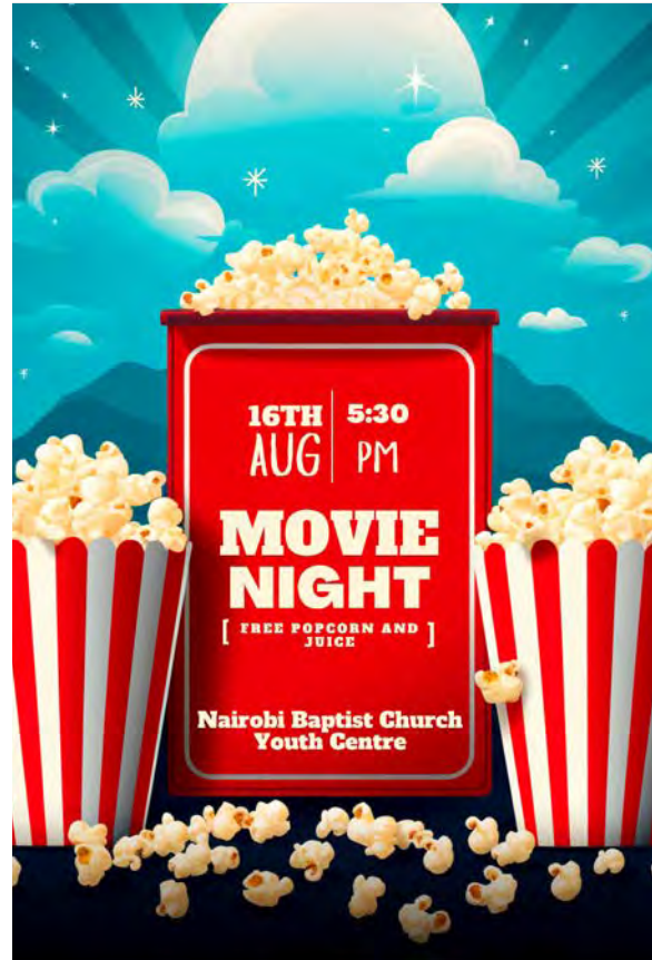
Youth Movie night Invitation

vi. Youth Outreach: There have been several outreach initiatives. Key to note was street evangelism with food distribution which the youth cooked and distributed as they shared the gospel. The gospel was also shared during a youth movie night. We thank God for this opportunity to be the aroma of Christ.