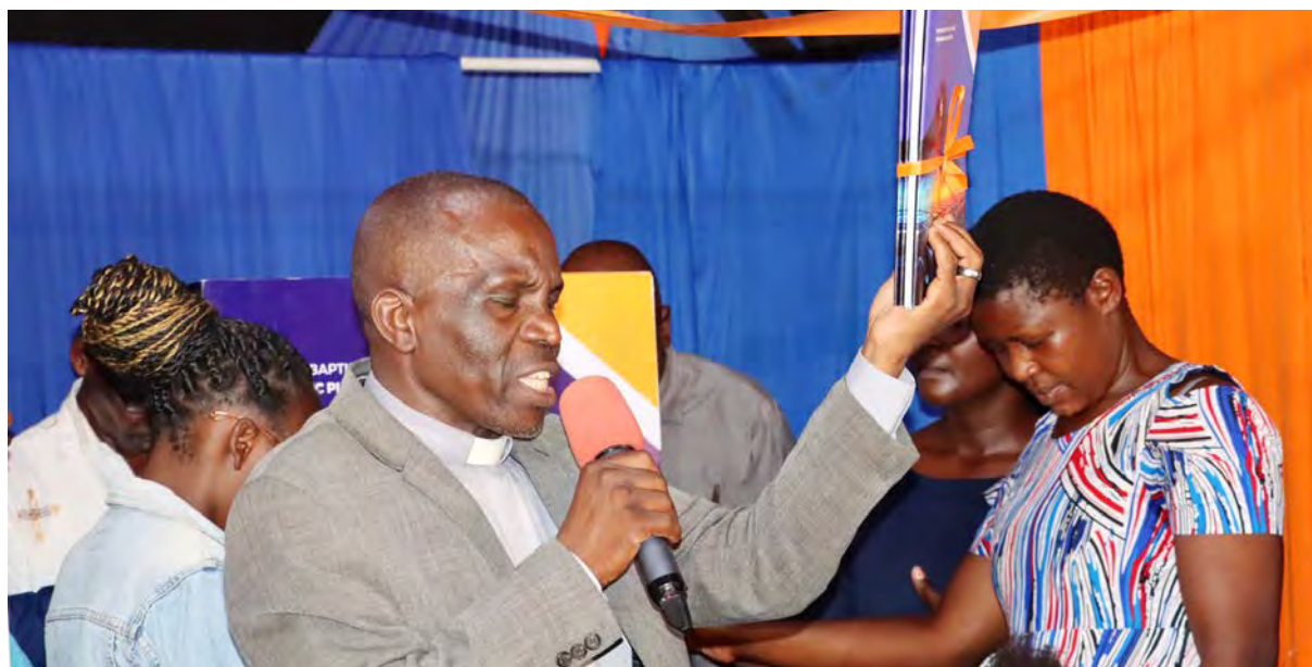
Lead Pastor praying for new strategic plan

We are praying for a lasting solution to our challenge of space especially for the Sunday school. We invite NBC members to pray with us.