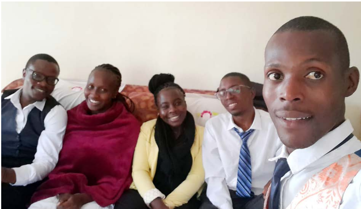
Young adults missionaries in Uganda

The youth and young adults continued their Bible studies and active involvement in the Sunday service. Seven (7) young adults joined a 'Growing in discipleship' group on Sundays using the Navigators' material. The IMPACT (ex-high school) program took place in quarter one of the year, with eight (8) participants who were trained in Christian living and participated in outreach and other ministry engagements. In September, six young adults attended an annual youth camp, in Uganda, organized by the Luweero Community Pastors Fellowship.