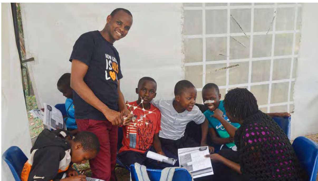
Holiday Bible Club class