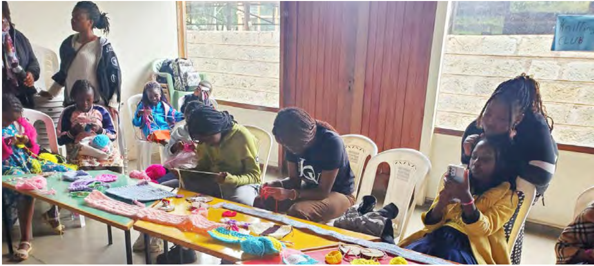
HBC talent displays