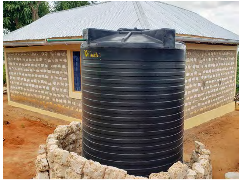
Community Engagement in Kwale by Church Trustees