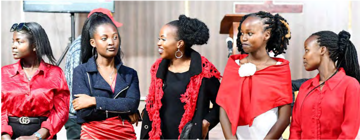
Colleger's Valentine dinner