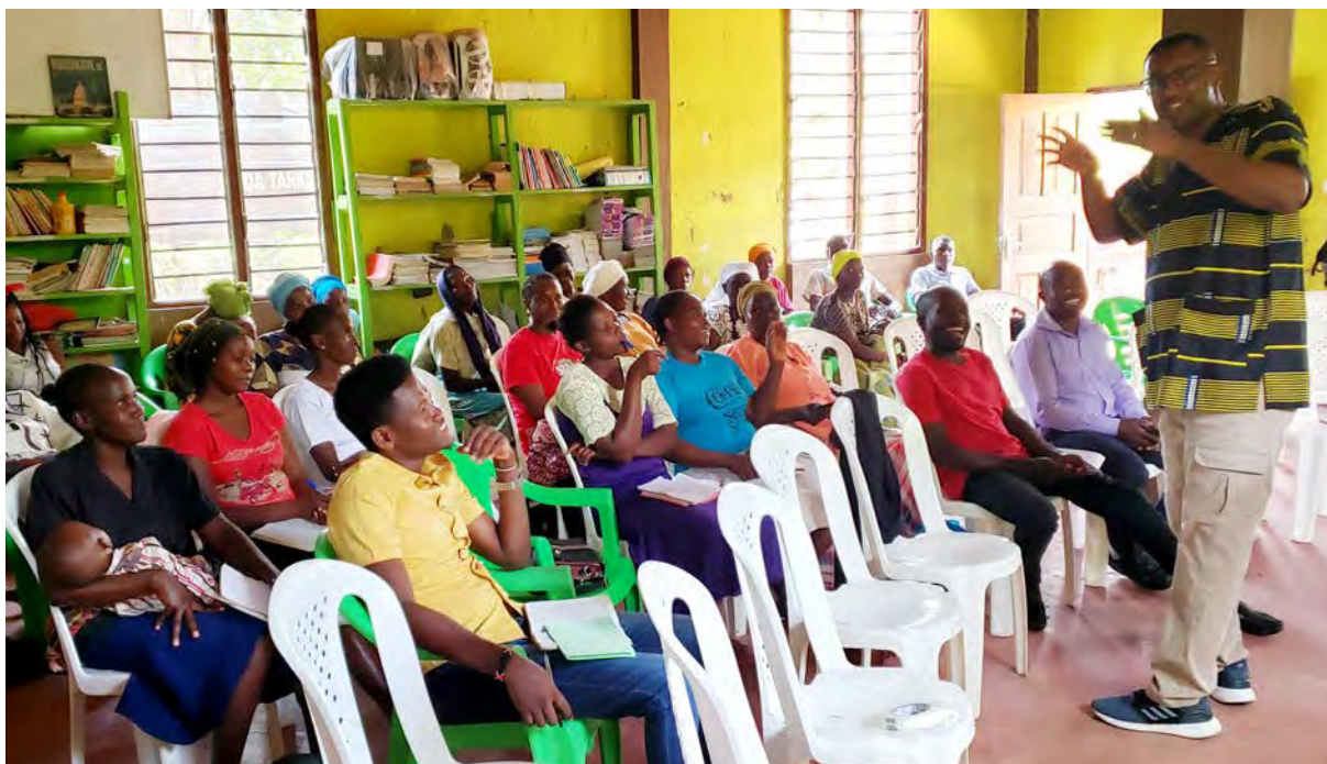
Children ministry co-workers training