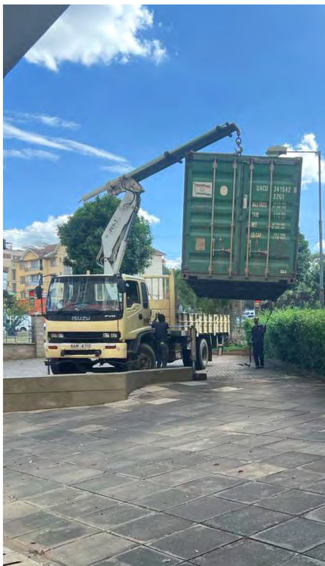
Arrival of storage container