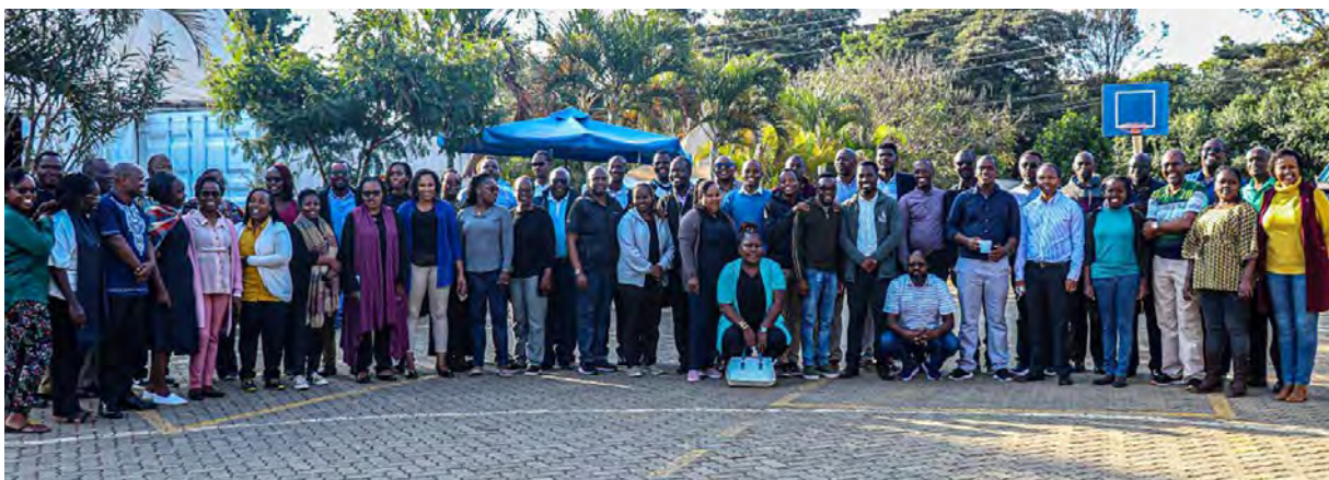
Staff after a planning meeting

c. The Procurement, ICT and Support Services functions continue to support ministry in all assemblies, to the glory of God.