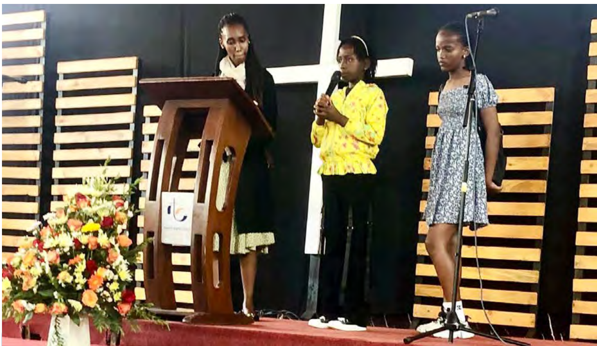
Child led service