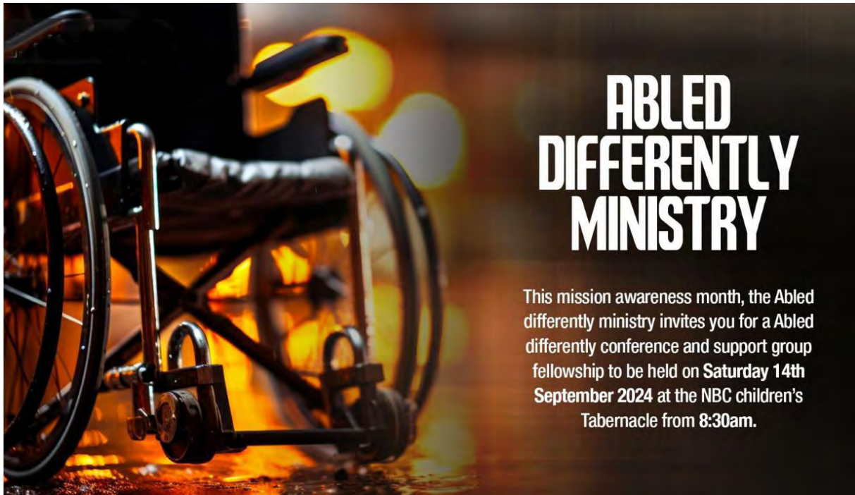
Conference invite for Abled-Differently and caregivers

In August this year, we had a successful retreat for the individual missionaries that aimed to refresh and refocus the team towards the urgency of missions