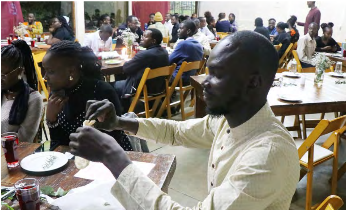
Young adults dinner