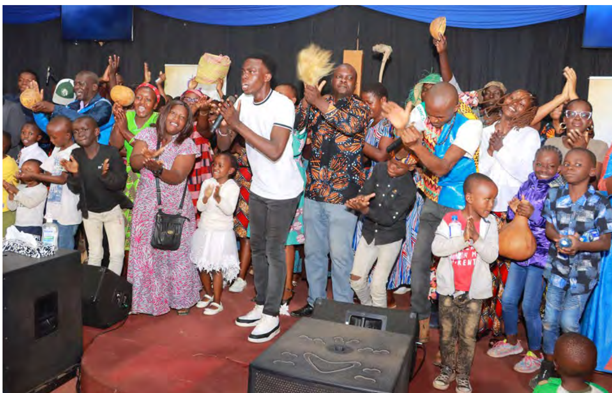
Cultural Sunday 2024