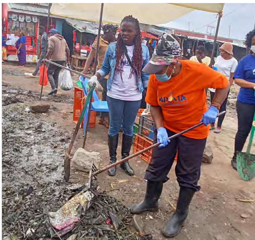
Community clean-up day

The Assembly couples held a dinner in February attended by thirty-six (36) couples whose marriages were enriched. The children, youth, Angaza Ladies, and Men of Valour enjoyed fellowship every last Sunday of the month during our Pamoja Sunday. In addition, the Angaza Ladies held a successful breakfast meeting with over thirty (30) women. The Men of Valour continued their monthly breakfast fellowships. During a special breakfast on 10th October, men’s fellowship hosted the youth football team. This answered a long-standing prayer of the men, to begin mentorship relationships with the youth. Out of this interaction, twelve (12) mentorship groups were formed with a minimum of four (4) persons each, comprising a mix of older men, young adults and youth.